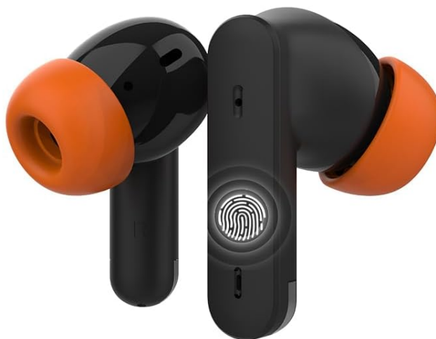
Image: AGM B3 Earbuds with the touch control area indicated.

With the AGM Buds 3, control is literally at your fingertips. Want to pause the track, adjust the volume, or pick up a call? Just tap or press. No more fumbling with your phone—everything is smooth and effortless, right on the buds themselves.