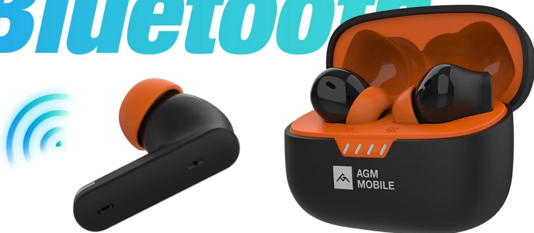
Image: Earbud in use, demonstrating noise cancellation.