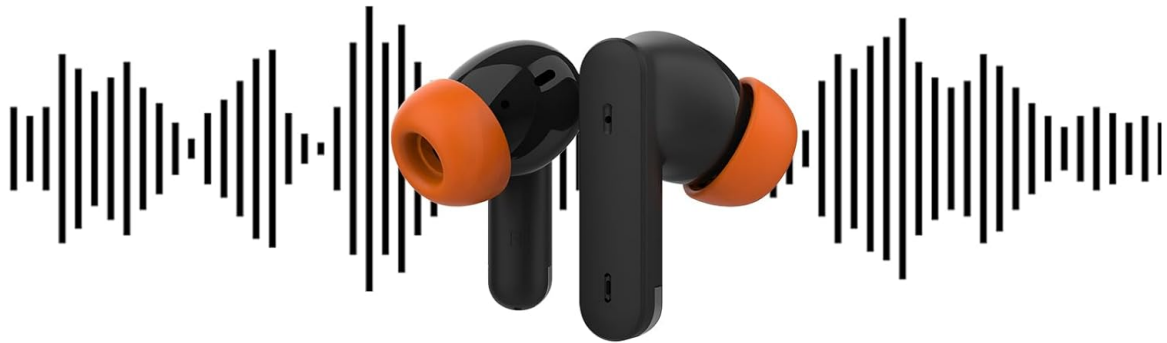
Image: Illustration of ANC and ENC technology in action.