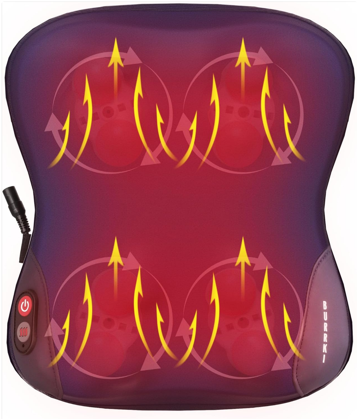
Figure 3.1: Front view of the Burrki Shiatsu Back Massager with Heat. This image shows the overall design of the massager, highlighting its compact and ergonomic shape, suitable for various body parts.

Before first use, ensure the massager is clean and free from any damage. Unpack all components and prepare for placement.