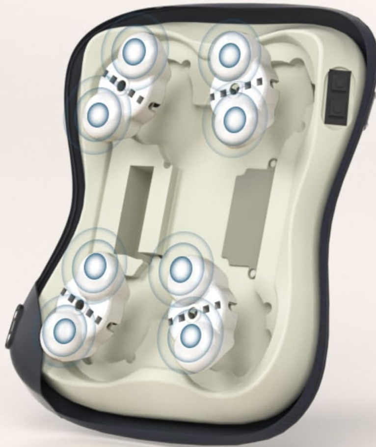
Figure 4.3: An internal diagram illustrating the placement of the 8 massage nodes within the device. These nodes provide deep-kneading shiatsu massage action.