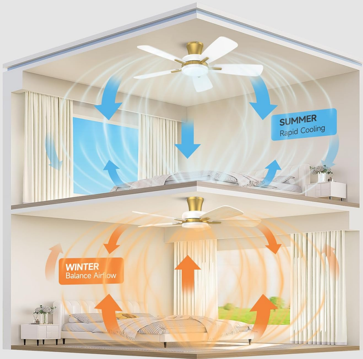
Figure 4: Illustration of the reversible DC motor, showing summer cooling and winter air circulation modes.