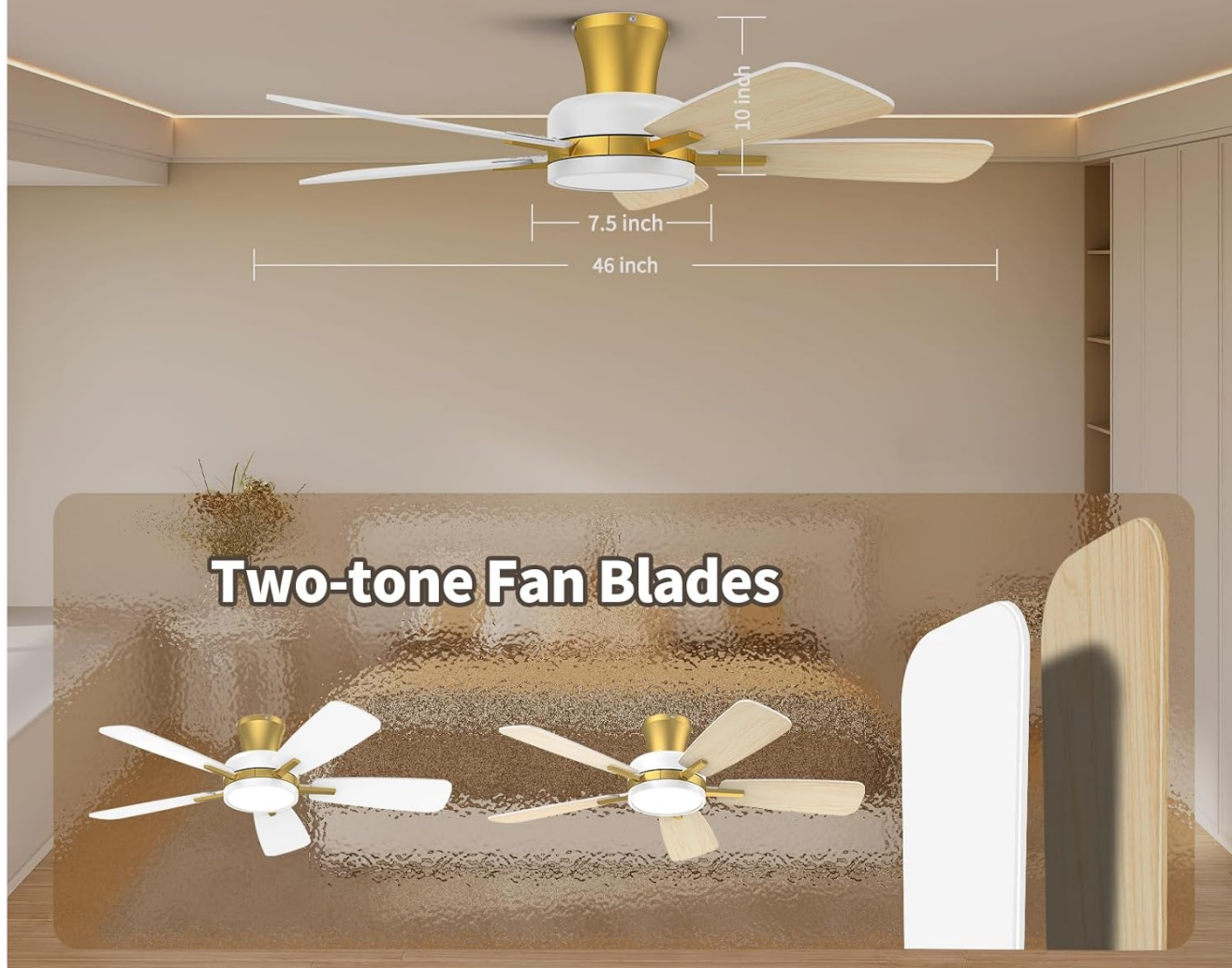
Figure 3: Dimensions of the 46-inch low profile ceiling fan, showing its flush-mount design.