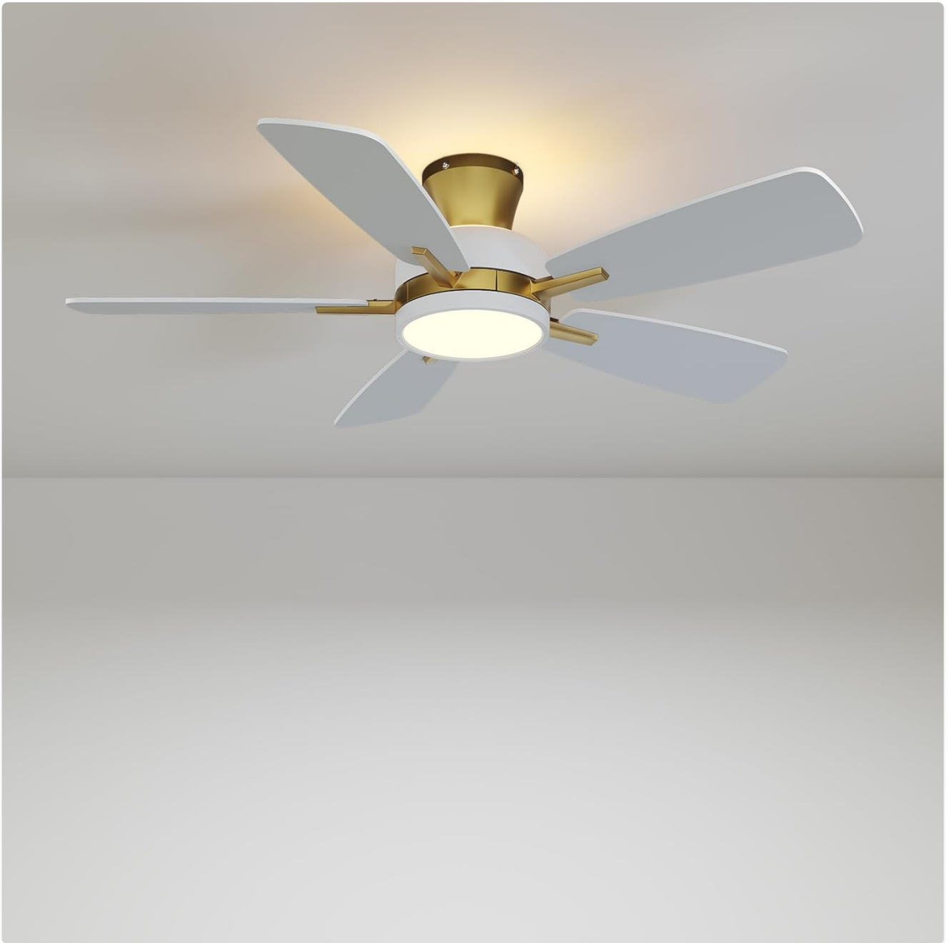
Figure 1: TALOYA 46 Inch Low Profile Ceiling Fan with Light.