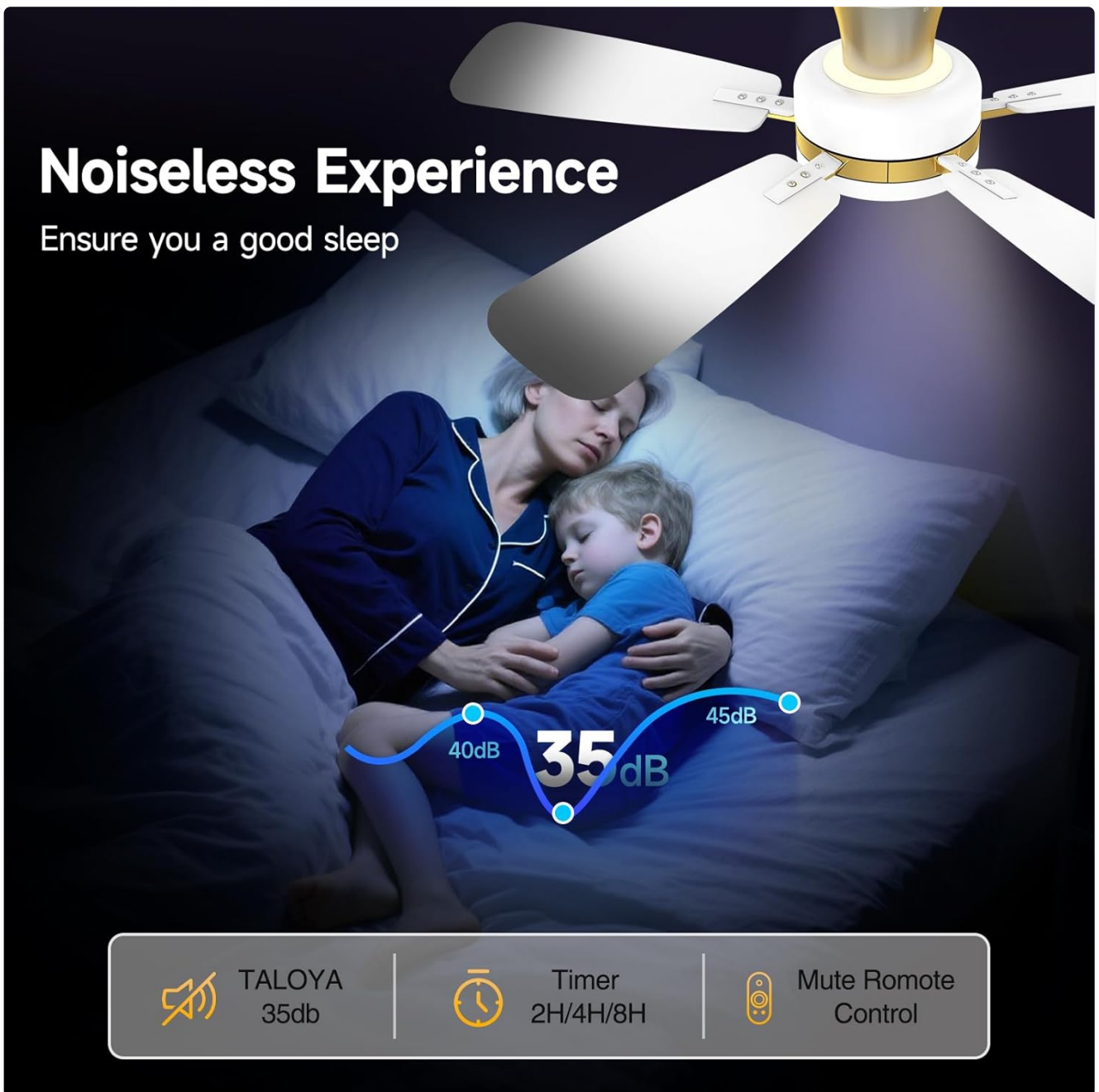
Figure 7: Highlights the fan's quiet operation (35dB) and timer functions for a peaceful environment, especially with the nightlight feature.