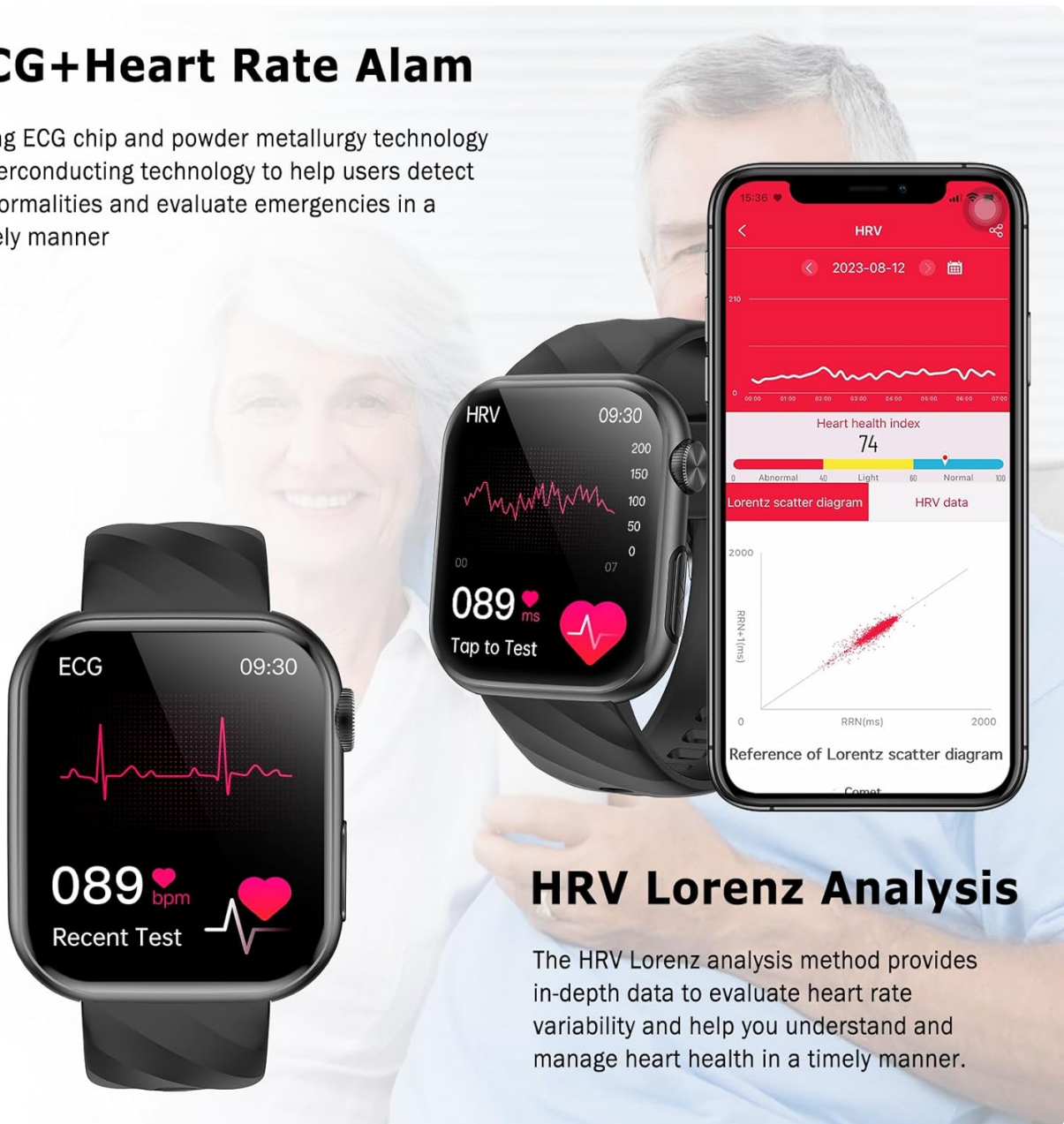
Image 2: The smartwatch showing an ECG reading and heart rate (89 bpm). The accompanying smartphone screen illustrates HRV Lorenz Analysis, providing detailed heart rate variability data.

Using ECG chip and powder metallurgy technology superconducting technology to help users detect abnormalities and evaluate emergencies in a timely manner