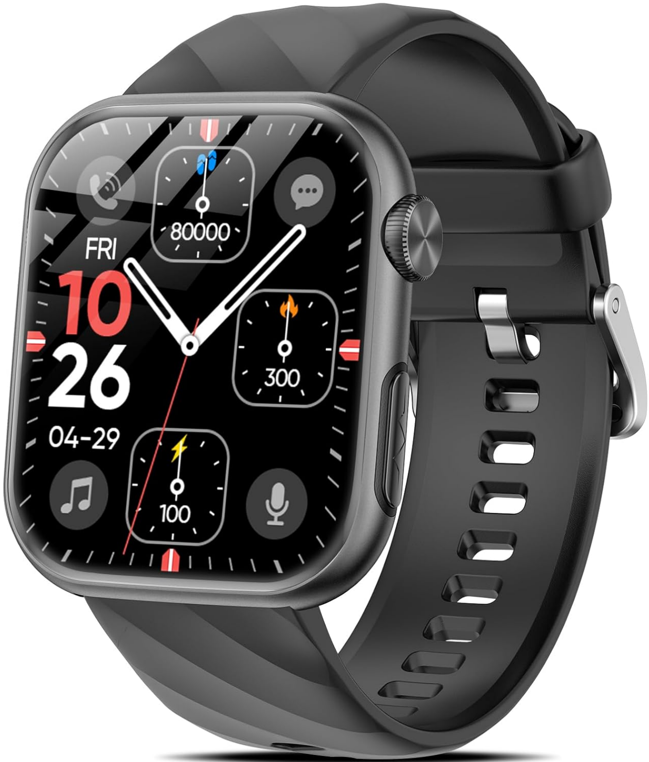
Image 1: The Marsyu MT500 Smartwatch displaying its main interface with time, date, and various activity metrics. The 1.97-inch AMOLED screen provides a clear and vibrant visual experience.

The Marsyu MT500 features a 1.97-inch AMOLED HD touch screen. Swipe left, right, up, or down to navigate through menus and functions. Tap to select items. The screen offers clear visibility, even in sunlight, and is designed for energy efficiency.