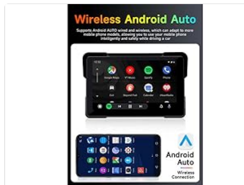
Image: The device displaying the Wireless Android Auto interface, featuring app icons such as Google Maps, YT Music, and Spotify, with a smartphone below illustrating wireless connectivity.