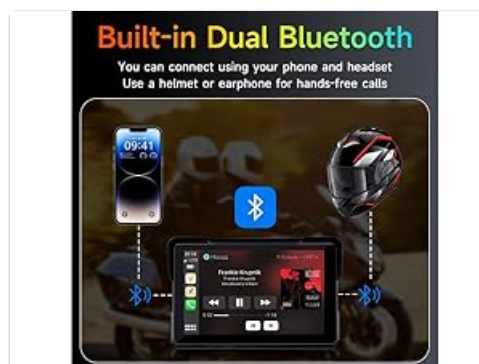
Image: A diagram illustrating the dual Bluetooth connection, showing a smartphone connected to the device and the device simultaneously connected to a motorcycle helmet, enabling hands-free communication and music.

The device supports dual Bluetooth channels. After pairing your phone for CarPlay/Android Auto, you can simultaneously pair your Bluetooth-enabled helmet or earphones directly to the device. This allows for hands-free calls and audio playback through your helmet's speakers.