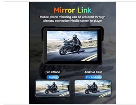
Image: The device screen displaying a mirrored image of a motorcycle on a road, with smaller images below showing how an iPhone (Airplay) and Android (Android Cast) can mirror their screens.