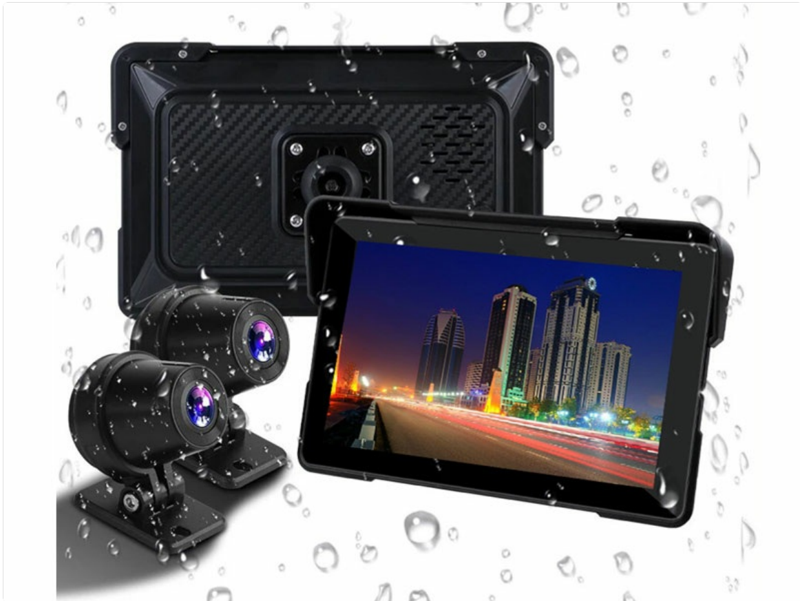
Image: A visual representation of all items included in the product package, such as the main display unit, mounting hardware, and various cables.