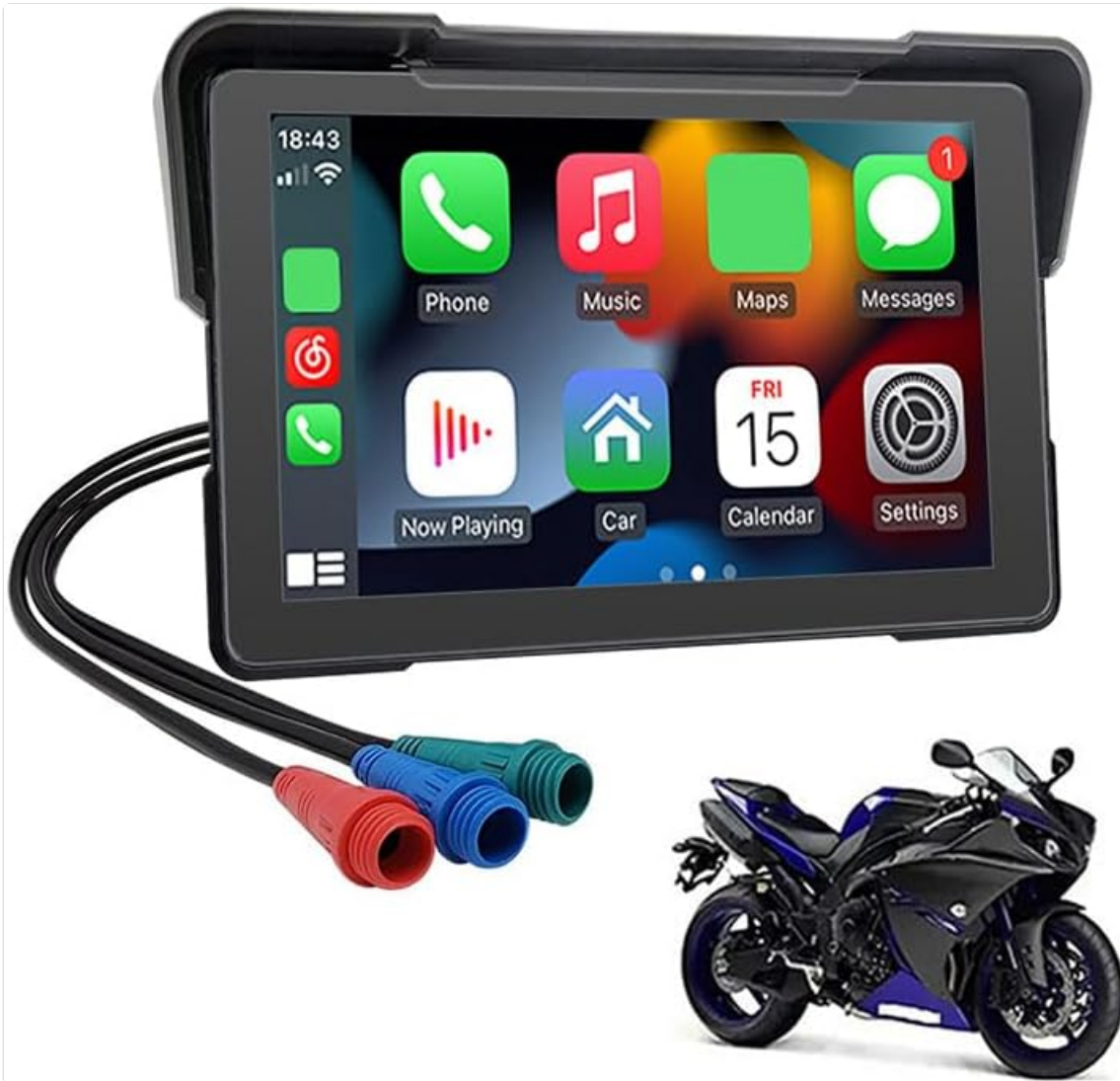
Image: The DRATZTECH 7-inch IPS Touch Screen Portable Carplay Screen for Motorcycle, shown with its connecting cables and a motorcycle in the background.