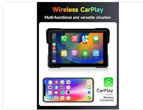
Image: The device displaying the Wireless CarPlay interface, showing various app icons like Phone, Music, Maps, and Messages, with a smartphone below demonstrating wireless connection.

allowing access to navigation, music, and communication apps.