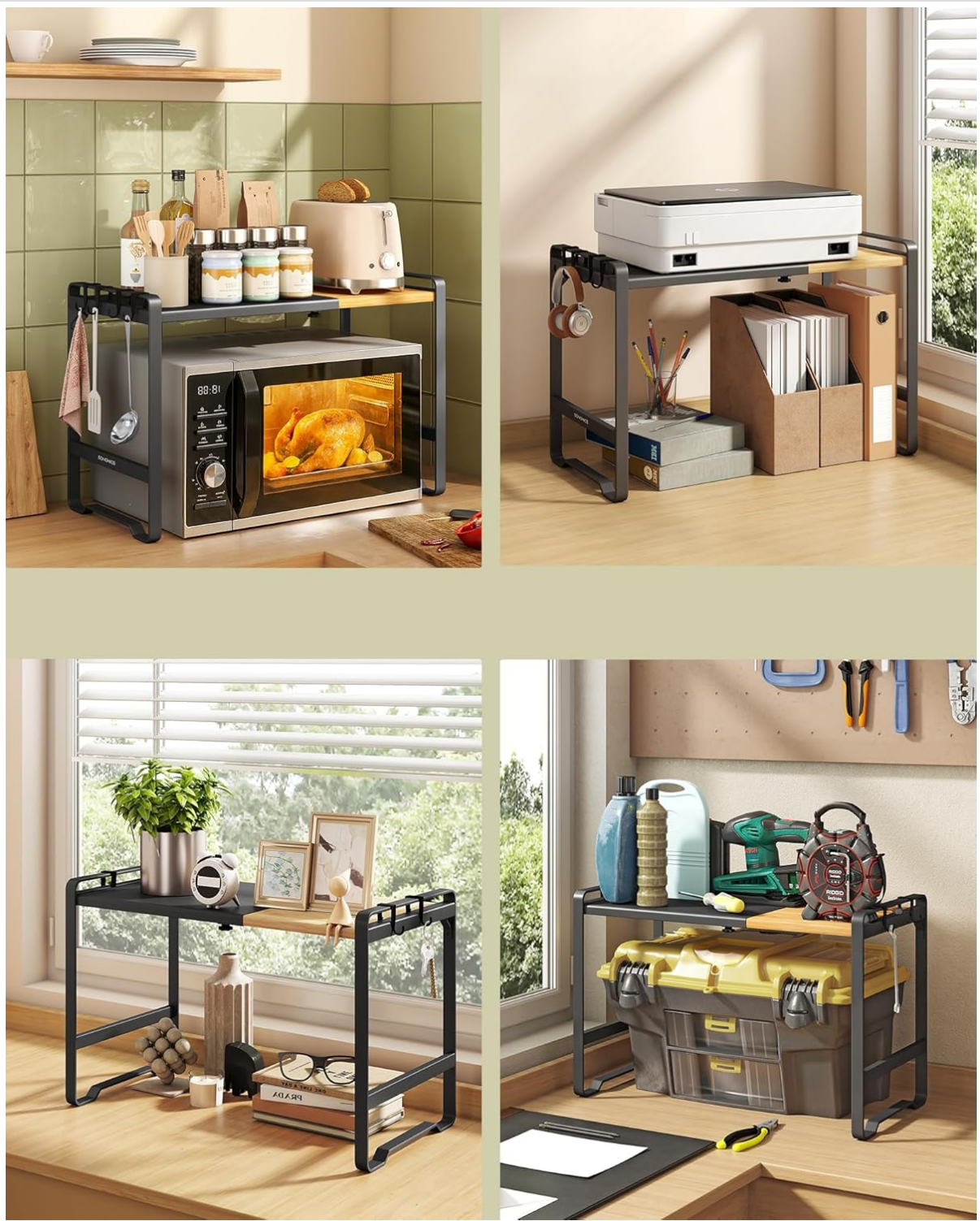
Figure 5: Examples of the shelf's versatility, showcasing its use in a kitchen, office, and workshop environment.