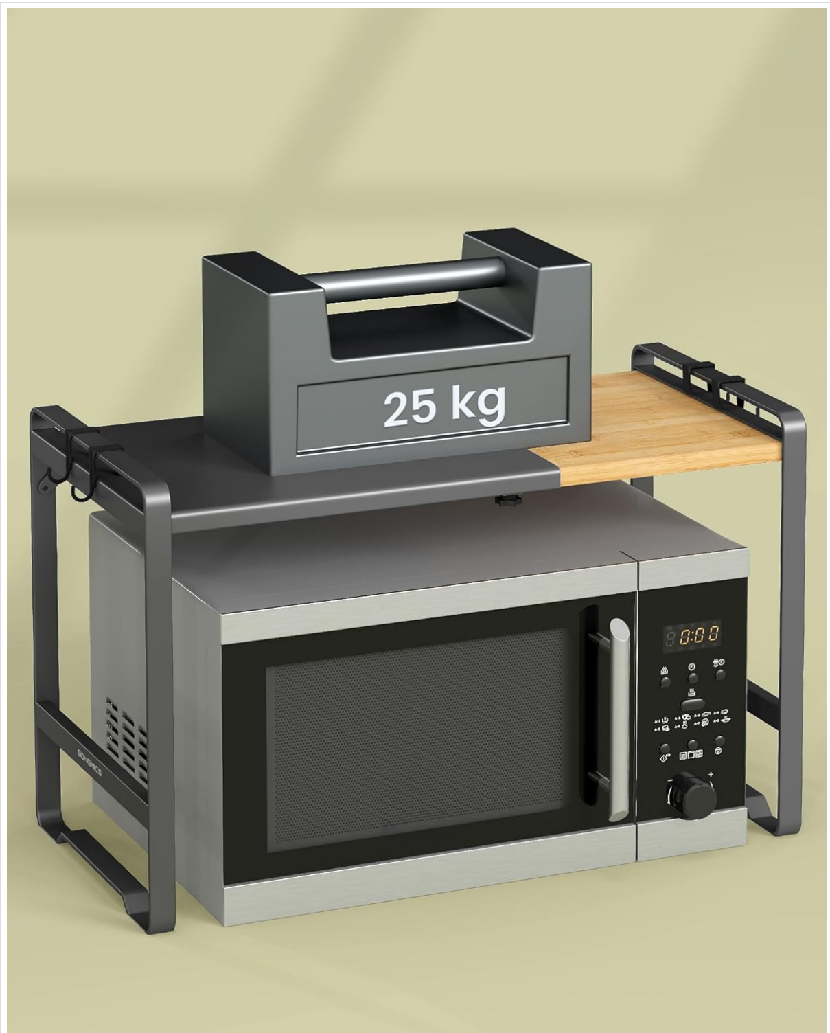
Figure 4: Visual representation of the shelf's strong support, capable of holding up to 25 kg.