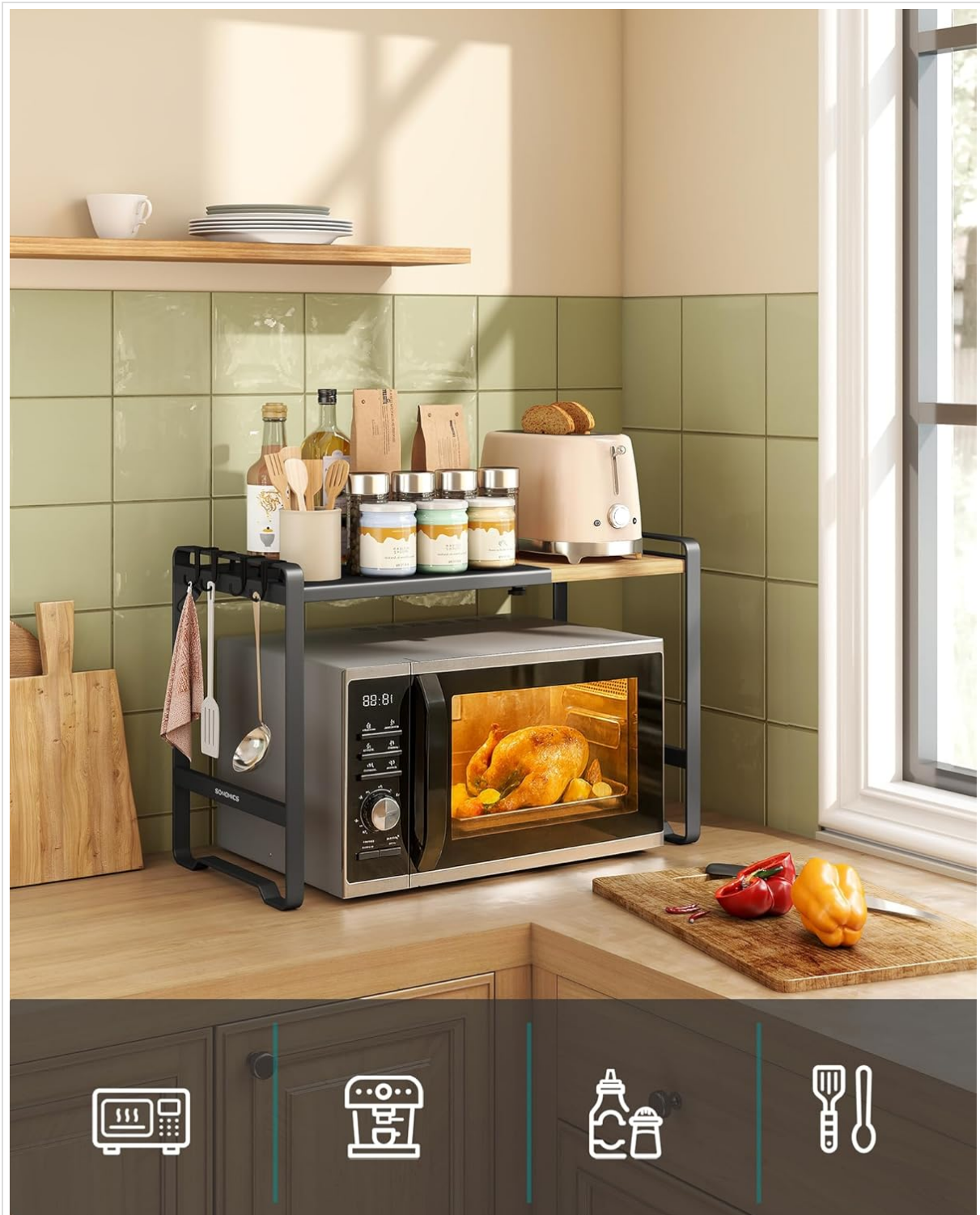
Figure 3: The microwave shelf in use, demonstrating its function as an organizer for kitchen appliances and accessories.

Place the assembled shelf over your microwave oven, toaster oven, or other kitchen appliances. The top shelf provides additional space for spice bottles, cookware, or other kitchen essentials. The removable hooks can be used to hang spoons, spatulas, oven mitts, or dish towels.