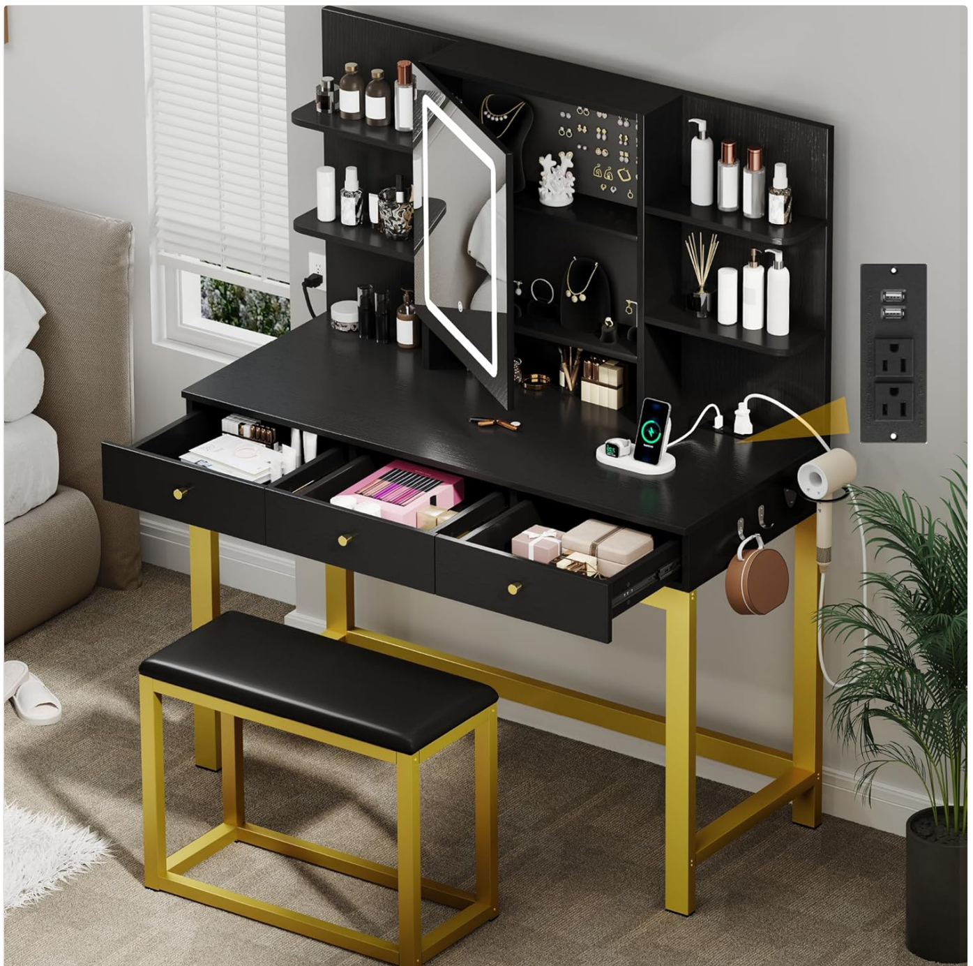
Figure 1: The DWVO Vanity Desk, featuring an LED lighted mirror, integrated power outlets, and ample storage.