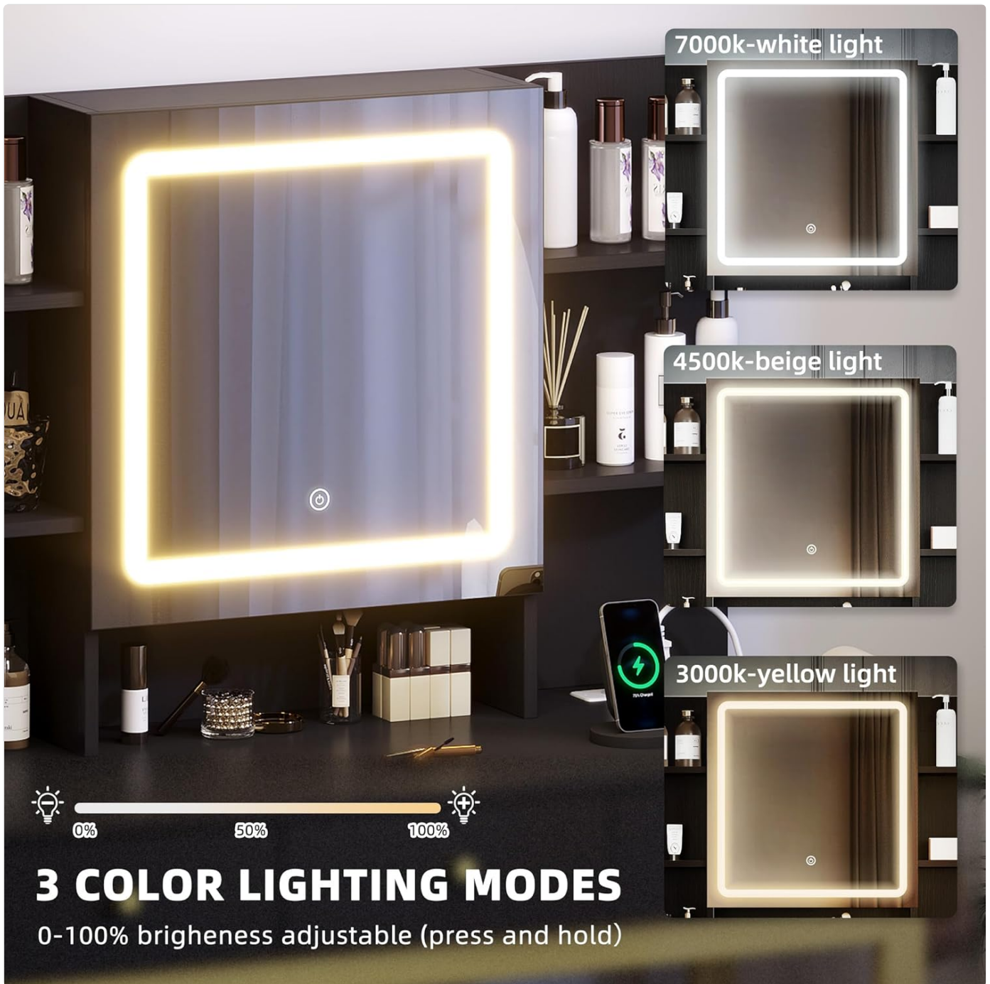
Figure 3: Illustration of the three adjustable color lighting modes and brightness control on the LED mirror.

gradually increase or decrease. Release the button when the desired brightness is reached.