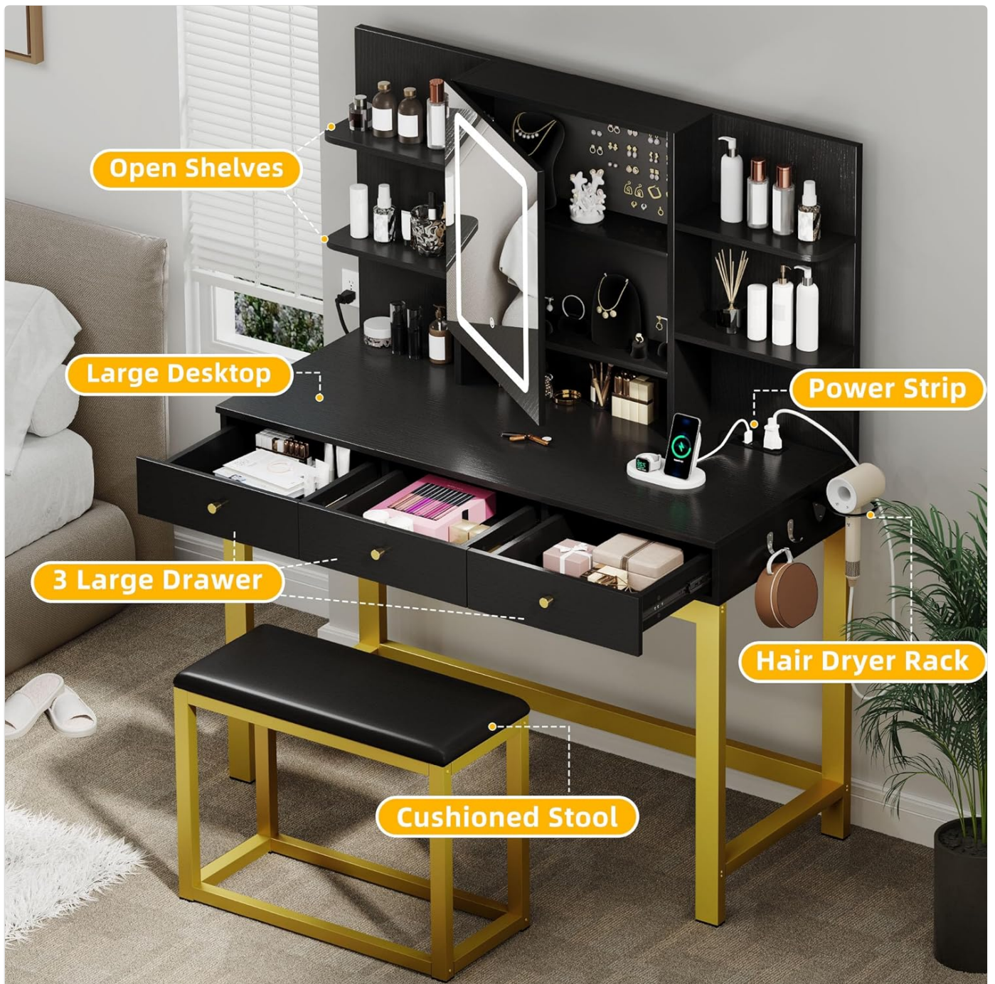
Figure 2: Key features of the DWVO Vanity Desk, highlighting storage and utility components.