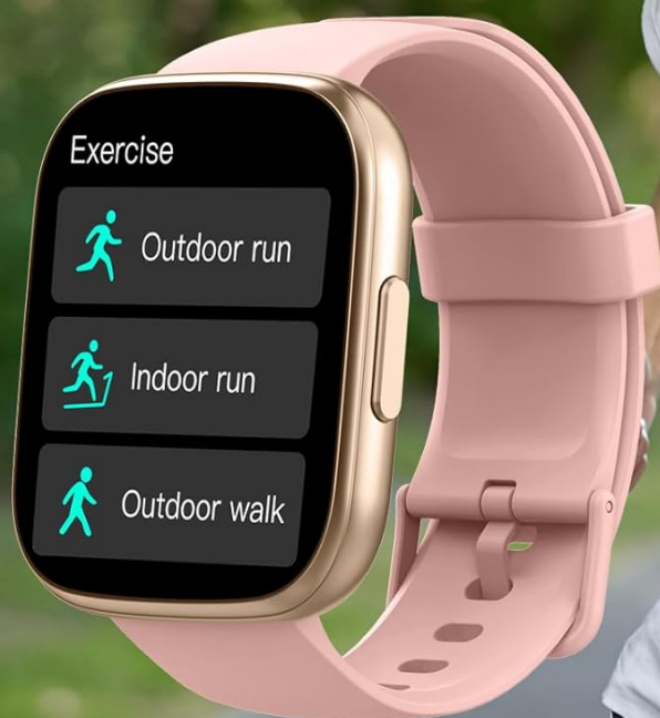
Figure 4: The T80 Smart Watch supports over 110 sport modes for diverse activities.