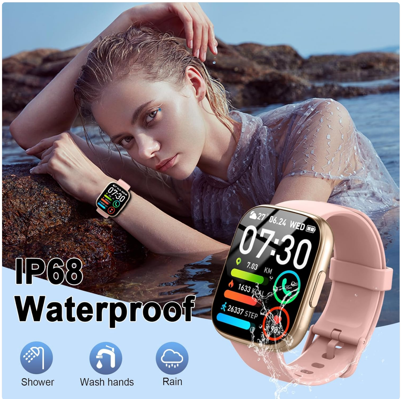
Figure 5: IP68 waterproof rating for daily use, excluding swimming or hot showers.