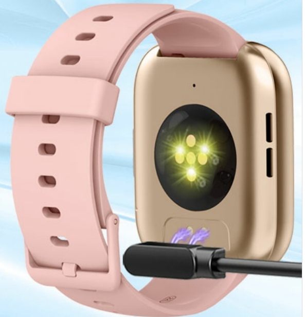
Figure 7: Battery life and charging information for the T80 Smart Watch.