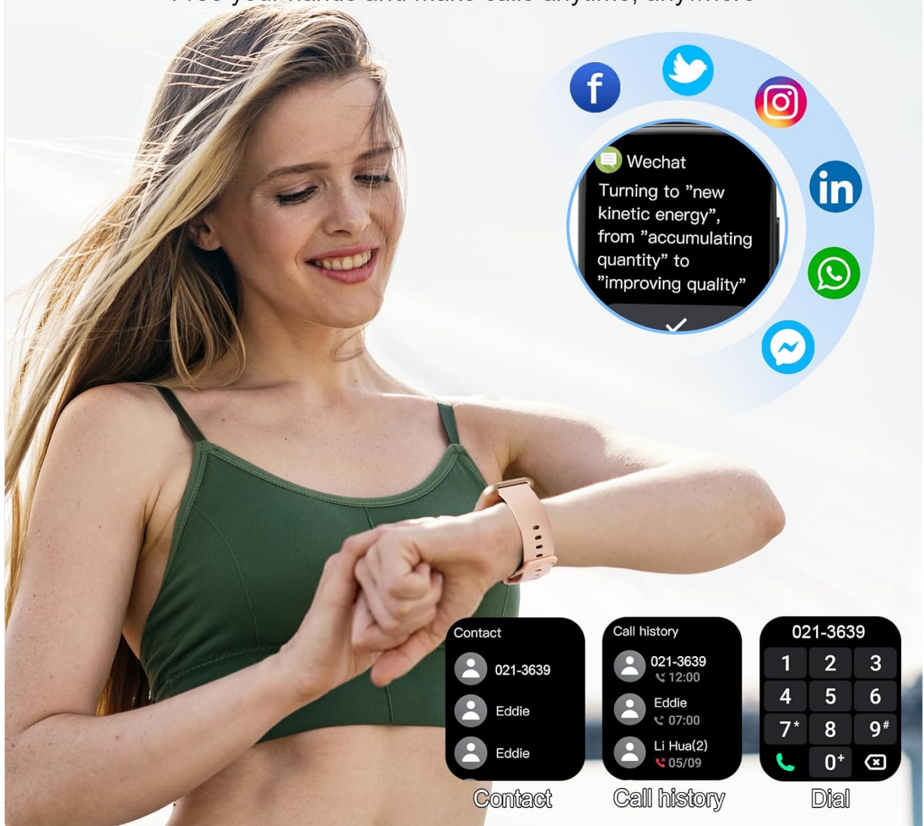
Figure 3: Bluetooth call and smart notification features on the T80 Smart Watch.

Free your hands and make calls anytime, anywhere