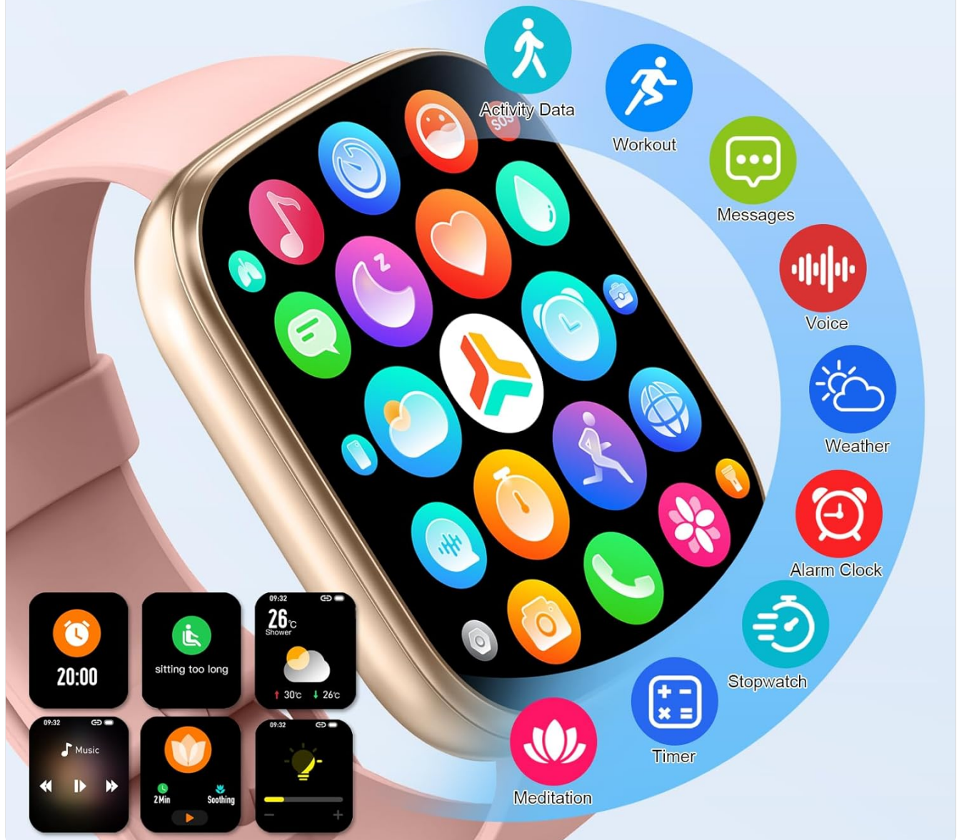
Figure 8: Overview of the multifunctional capabilities of the T80 Smart Watch.