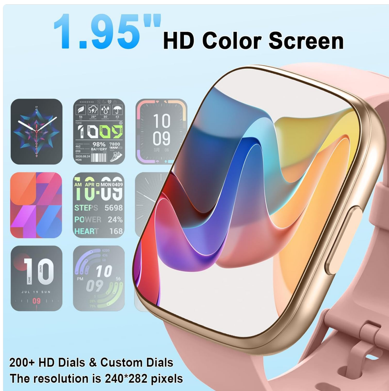
Figure 2: The 1.95" HD color screen with multiple customizable watch faces.

320×385 pixels for enhanced clarity and a broader viewing experience. Its slim 8mm profile and light weight of just 32g ensure comfort for all-day wear. The display includes 4-level adjustable brightness for clear visibility in various lighting conditions, including bright sunlight. Through the dedicated "GloryFit" application, users can access over 200 stylish watch faces and create custom designs to personalize their device.