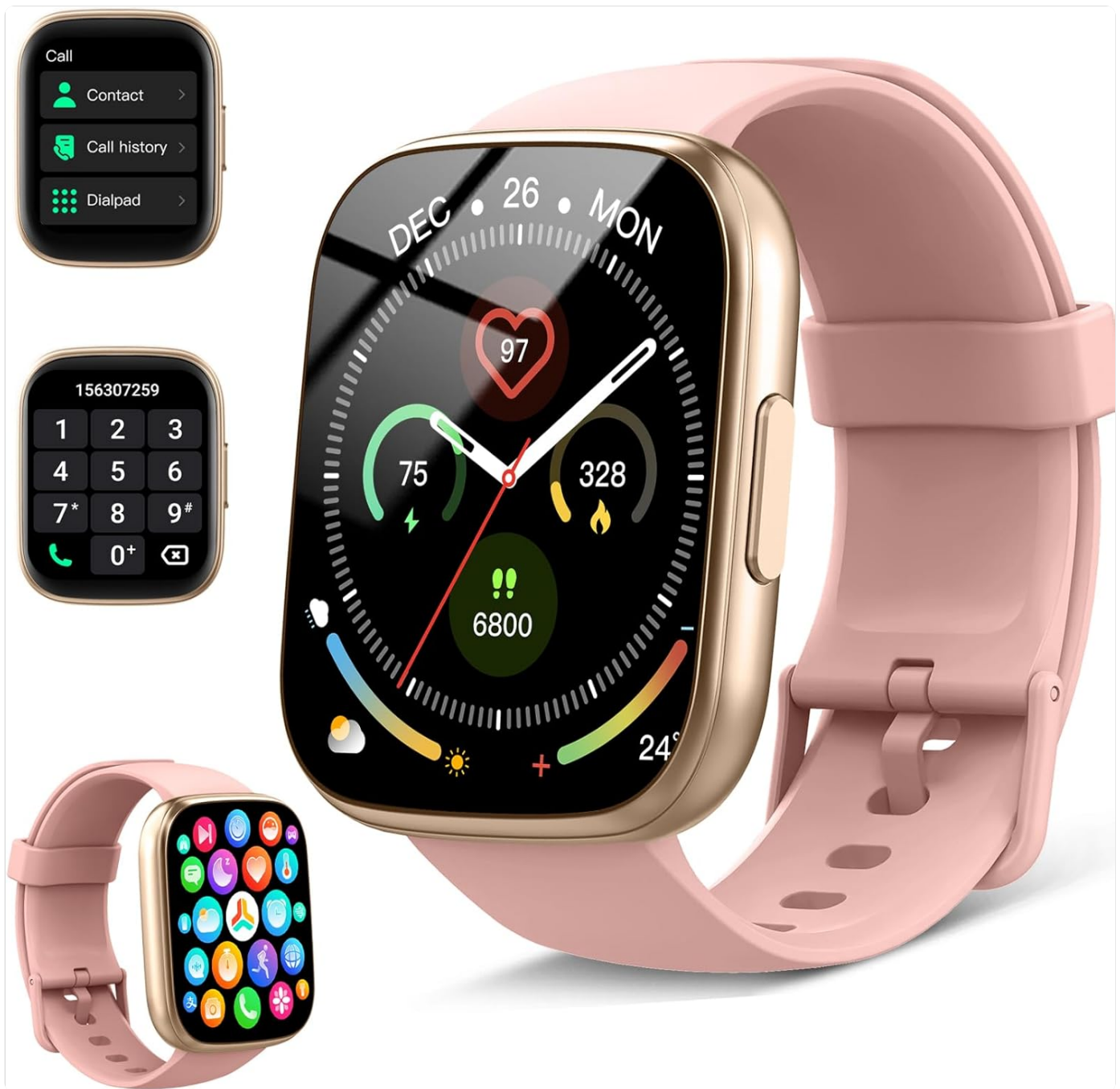
Figure 1: Cillso T80 Smart Watch overview, highlighting its main display and call functions.