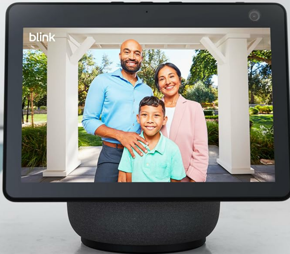
Image: An Amazon Echo Show displaying a live feed, illustrating the integration with Alexa for viewing and speaking.

See and speak with visitors on our easy-to-use Blink app or an Alexa-compatible device