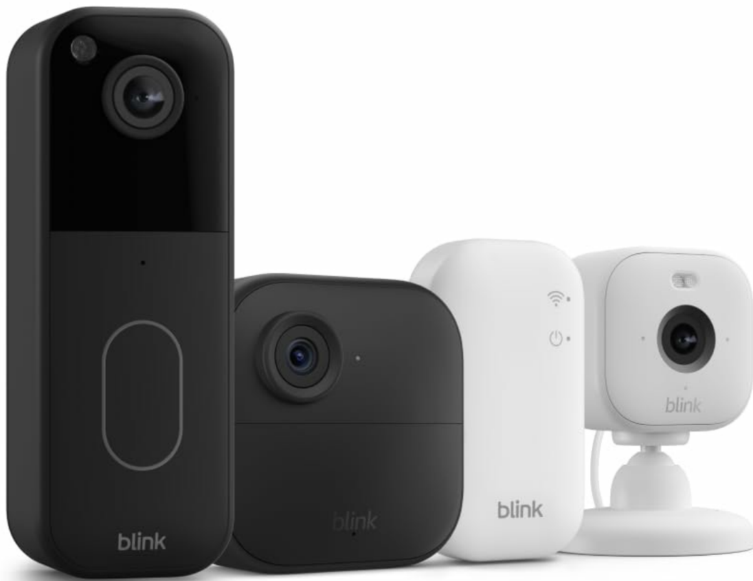
Image: The complete Blink Whole Home Bundle, showcasing the Video Doorbell, Outdoor 4 Camera, Mini 2 Camera, and Sync Module Core.