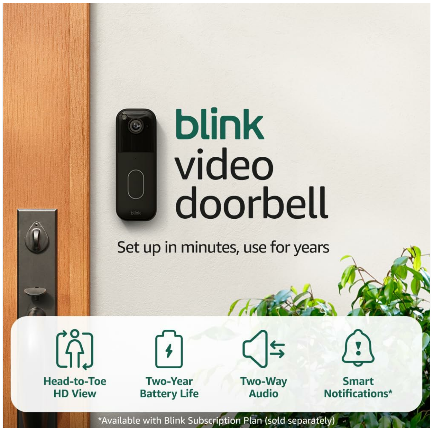
Image: The Blink Video Doorbell installed, illustrating its key features for home security.