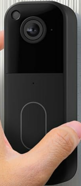
Image: A hand holding the Blink Video Doorbell, demonstrating its design and readiness for installation.

Runs for up to two years with three AA lithium batteries and a Blink Sync Module (both included)