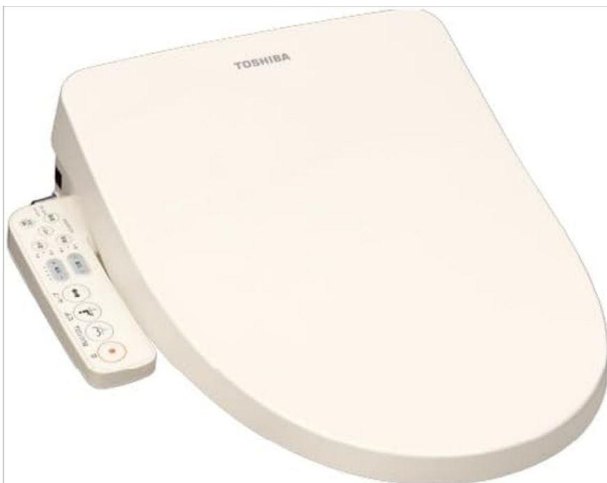
Figure 1.1: Toshiba Lifestyle SCS-SCK7010 Bidet Toilet Seat. This image displays the complete bidet toilet seat unit in pastel ivory, including the attached remote control.

This manual provides essential instructions for the safe and efficient use of your Toshiba Lifestyle SCS-SCK7010 Instantaneous Warm Water Bidet Toilet Seat. Please read this manual thoroughly before installation and operation, and keep it for future reference. The SCS-SCK7010 features instantaneous water heating, a stainless steel nozzle for hygiene, automatic deodorization, and a power-saving timer function.