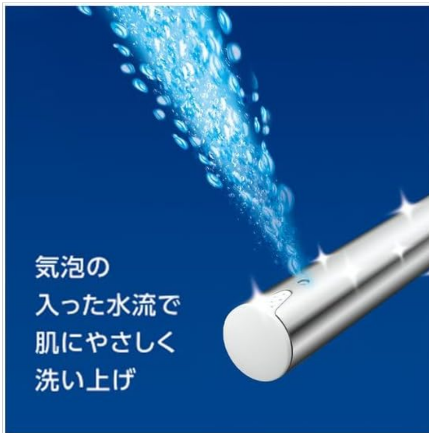
Figure 5.2: Aerated Water Flow. This image shows the bidet nozzle emitting a gentle, aerated water stream, designed for comfortable and effective cleaning.