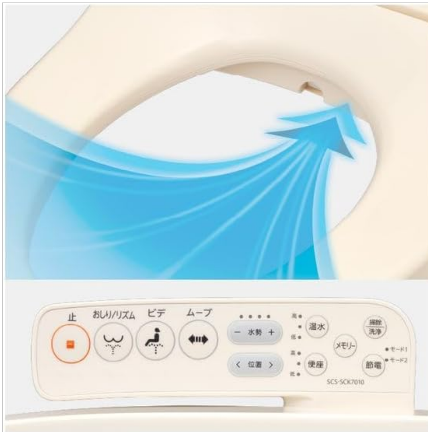
Figure 5.3: Control Panel. This image displays the user interface with various buttons for controlling wash functions, temperature, and other settings.