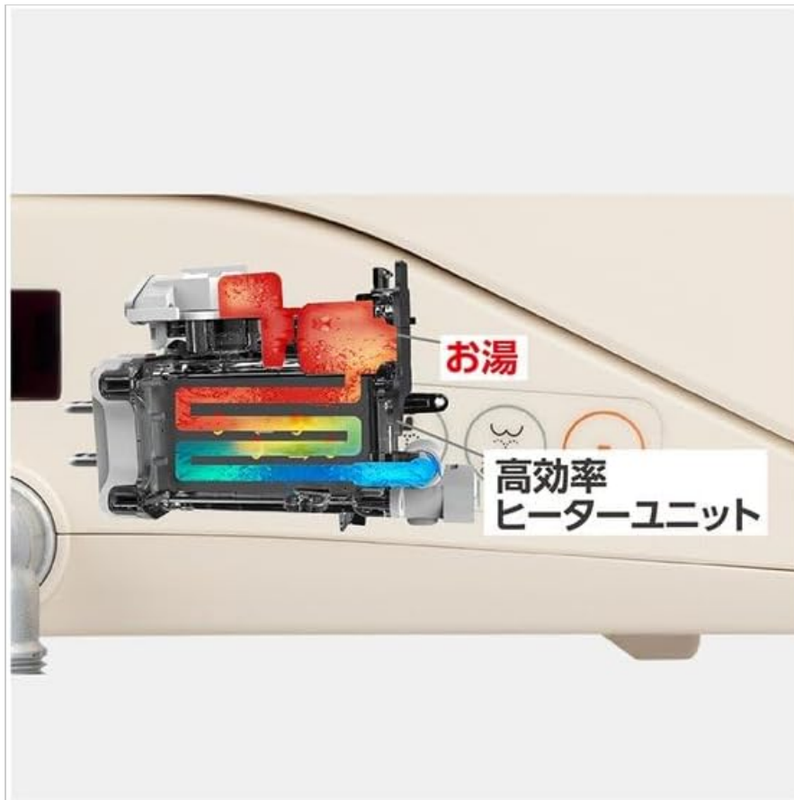
Figure 5.1: Instantaneous Heating Unit. This diagram illustrates the internal high-efficiency heater unit responsible for rapidly warming water on demand.

The instantaneous heating system warms water only when needed, providing a continuous supply of warm water while being energy-efficient. There is no water tank, reducing standby power consumption.