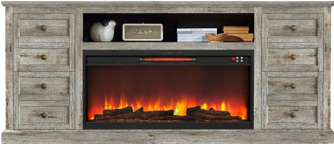
Traditional Log Set Insert Looking