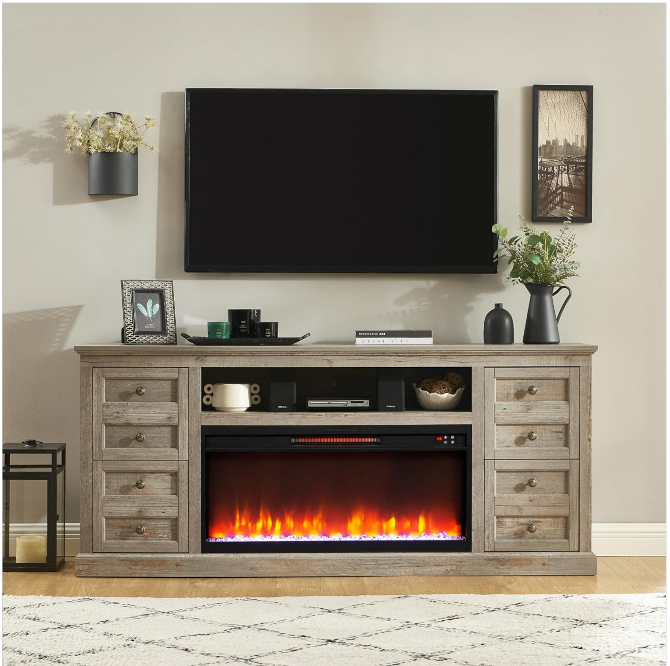
Figure 2.1: Front view of the Unineo 70-Inch Fireplace TV Stand.