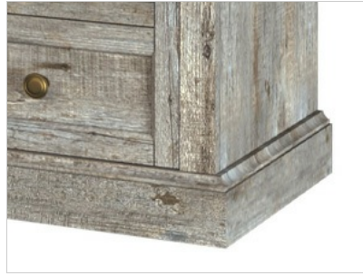
Figure 3.1: Detail of the base construction, highlighting stability.