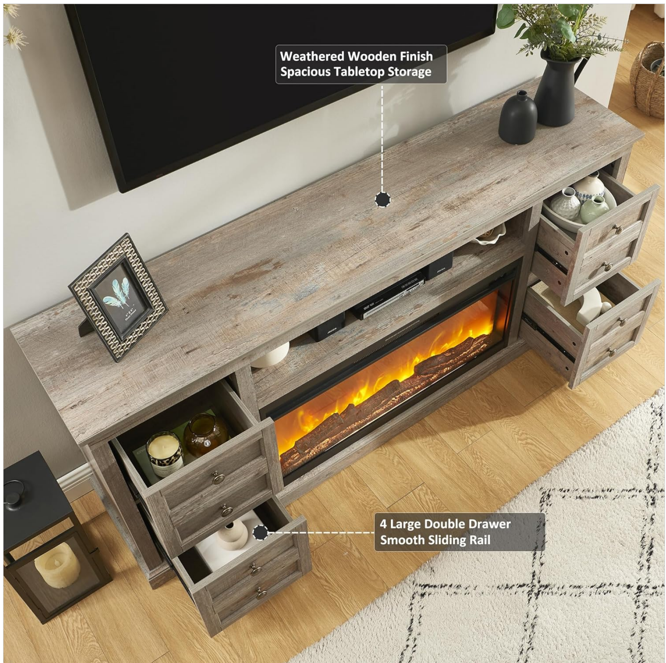
Figure 5.1: Overview of the spacious tabletop and drawer storage.