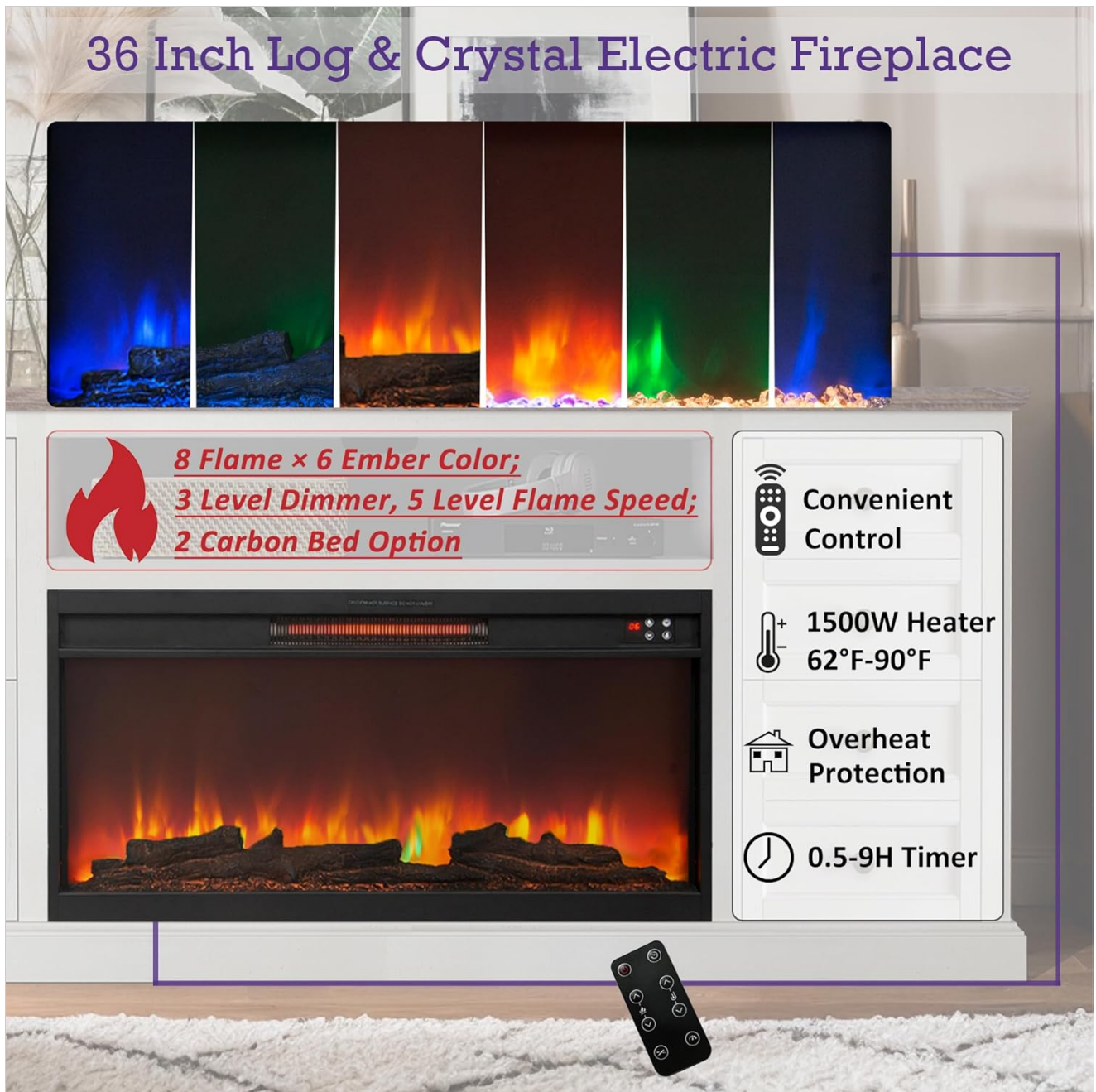
Figure 4.1: Fireplace control panel and display, illustrating flame and heat settings.