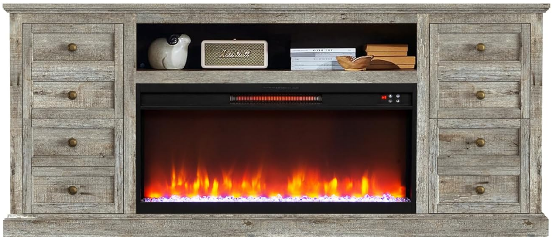
Modern Crystal Looking