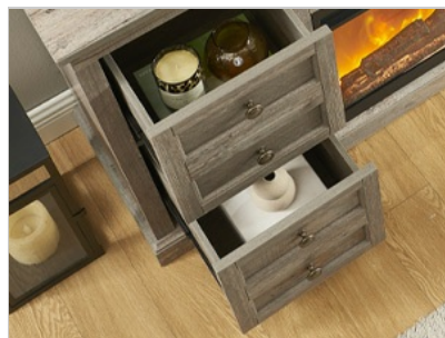
Figure 5.2: Detail of an open drawer, illustrating its storage capacity.