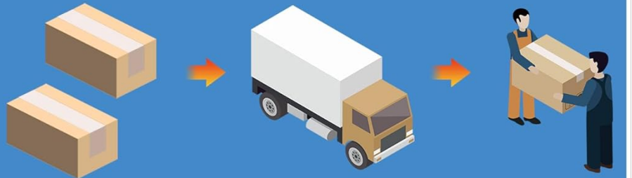
Figure 2.2: Product dimensions and packaging information. The unit ships in two boxes.