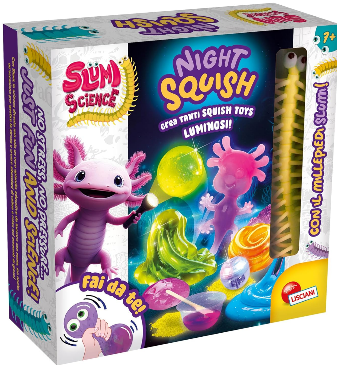
Image: The product packaging for the Lisciani Giochi Slumi Science Creature Glow in the Dark kit, featuring illustrations of glowing creatures and the Slumi millipede character.