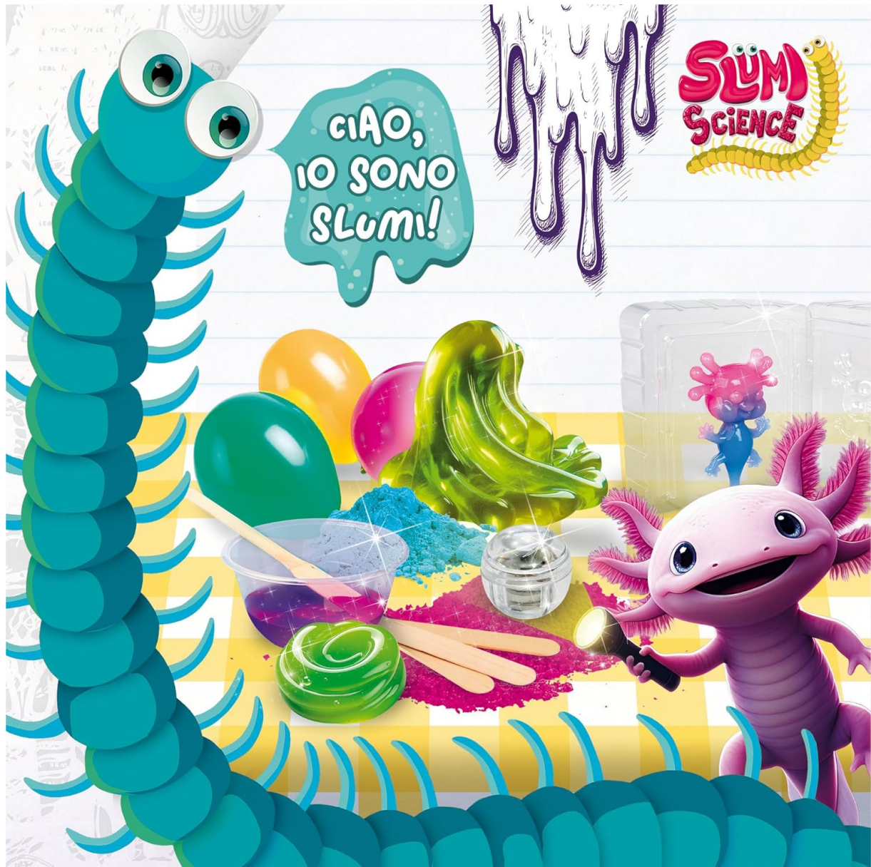
Image: Various components of the kit laid out, including mixing bowls, spatulas, powders, glues, an axolotl mold, and balloons, with the Slumi character in the background.