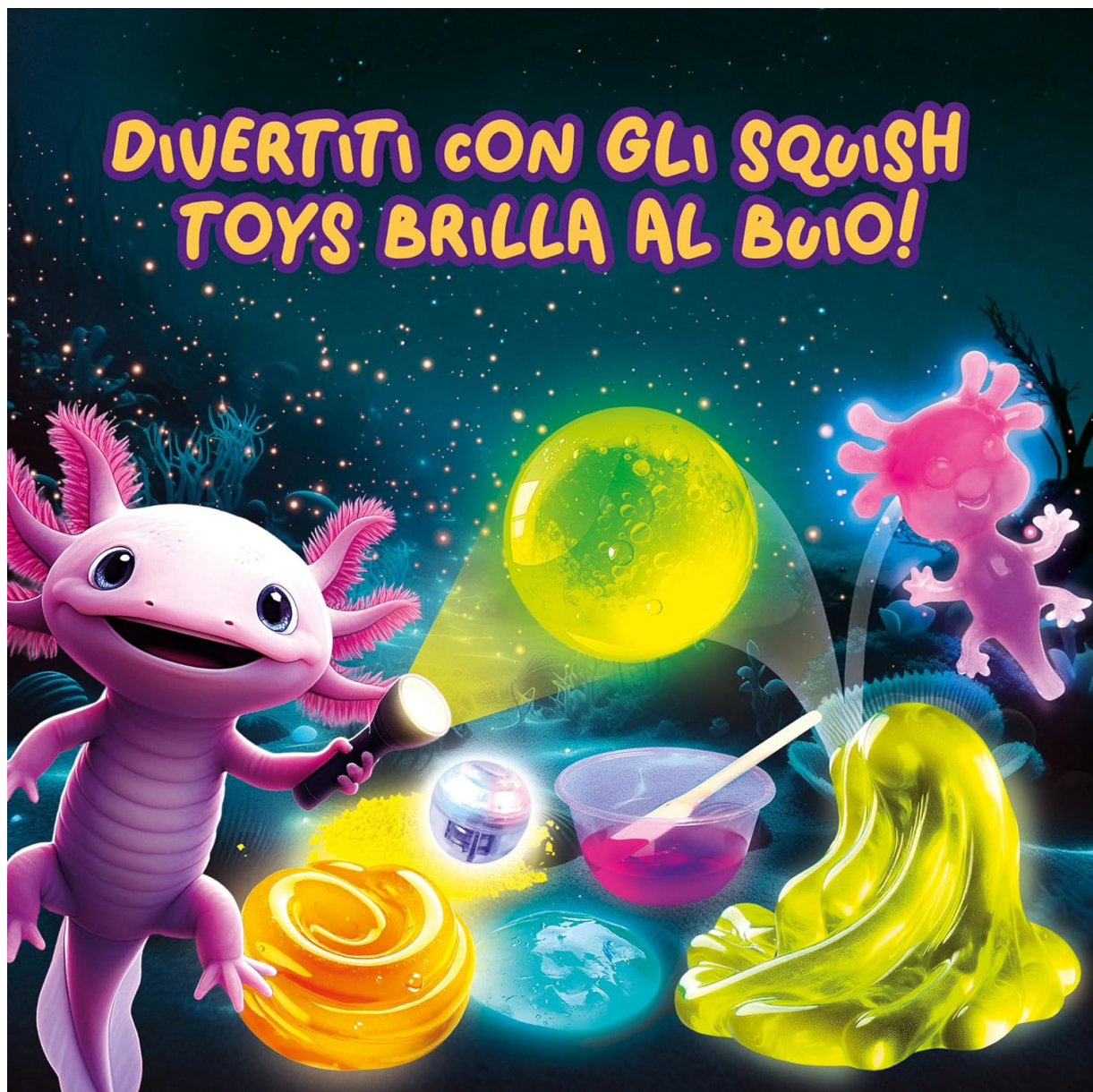
Image: An illustration showing various glowing squishy creatures, including an axolotl, a ball, and a blob, along with mixing bowls and a flashlight activating the glow.