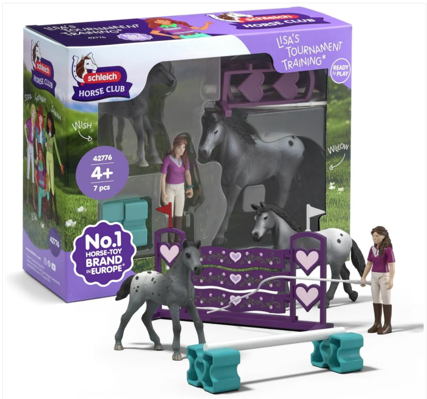
Figure 2.1: Overview of the Schleich Horse Club Tournament Training Set packaging and contents.