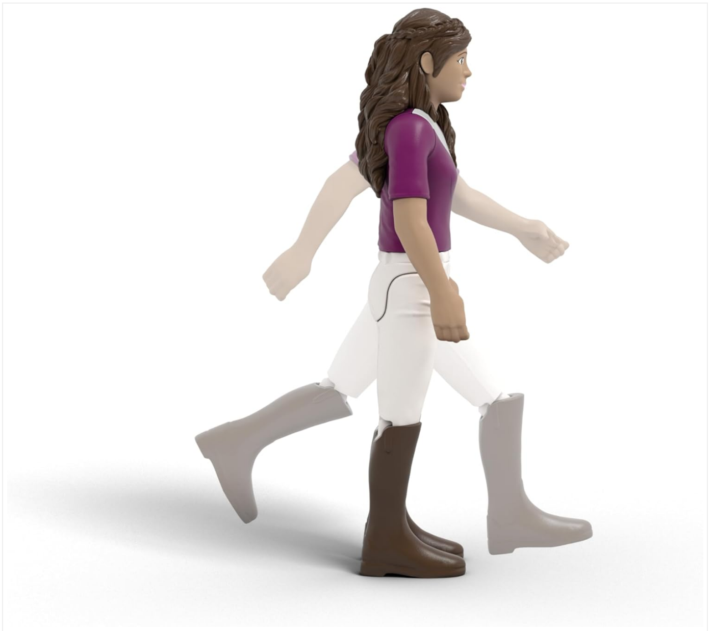
Figure 4.1: The Lisa figurine, designed for posing and interaction with the set.