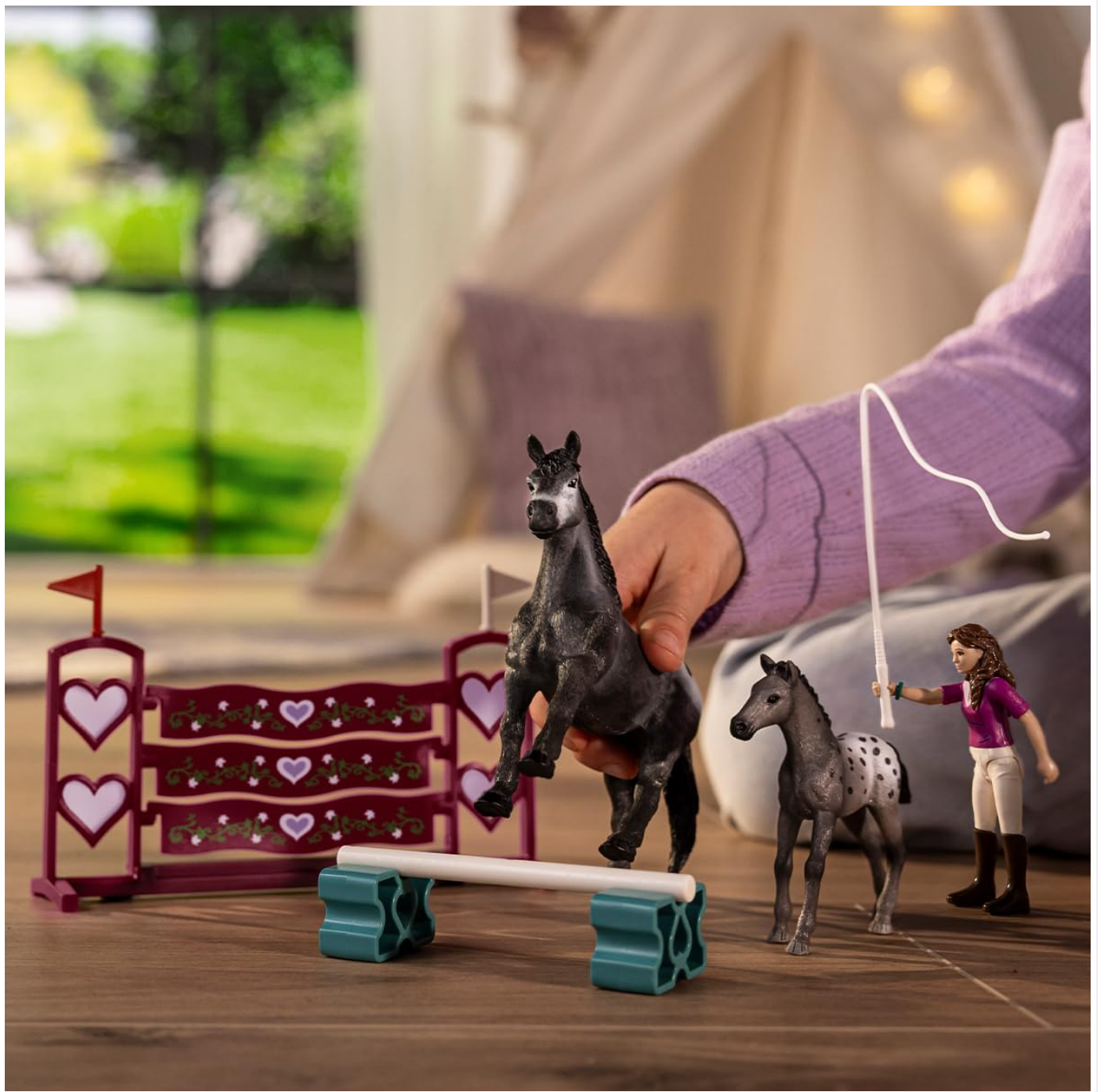
Figure 4.3: Example of interactive play with the horse figure and jump obstacle.