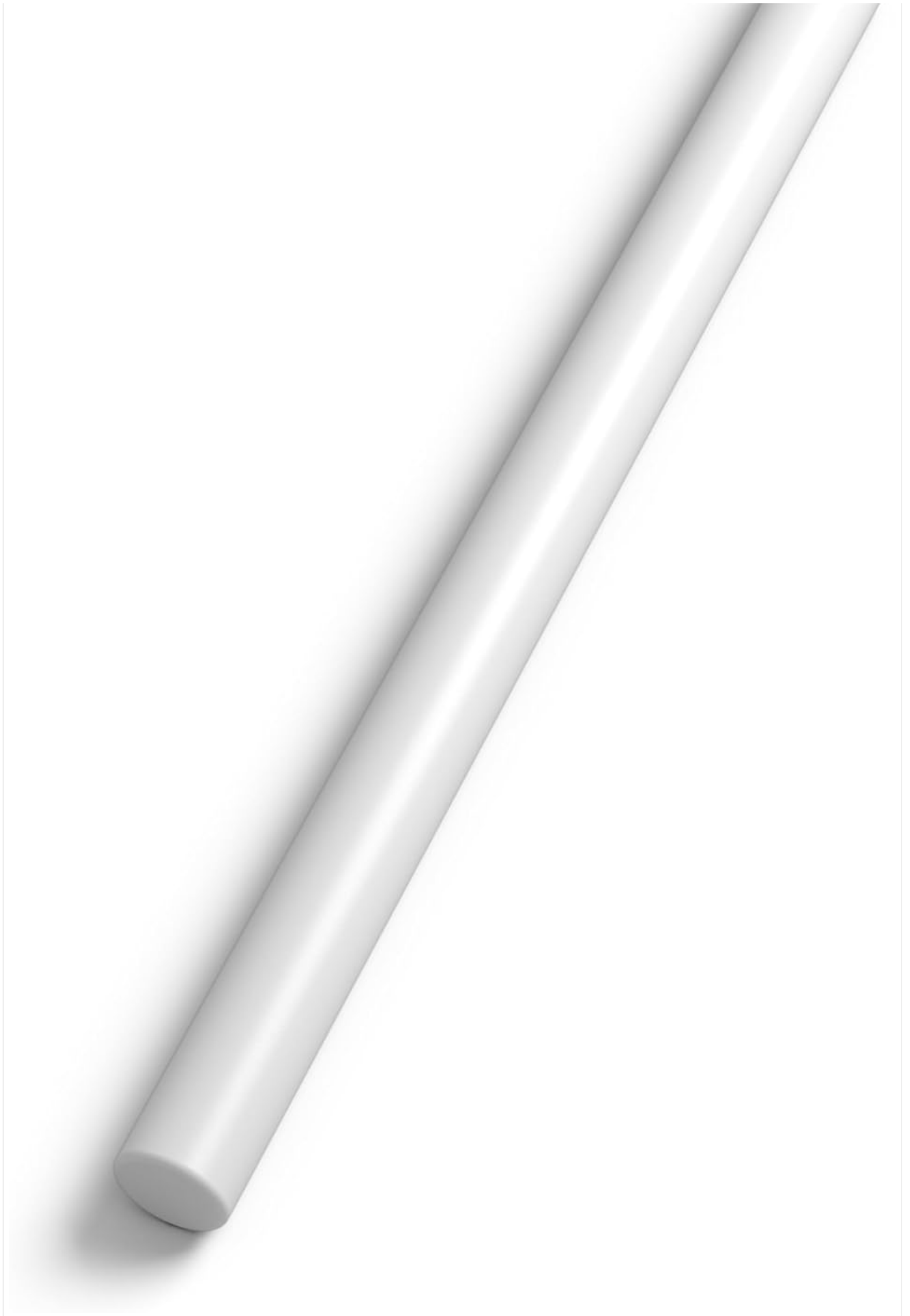
Figure 3.1: The adjustable jump obstacle, showing its individual parts for assembly.