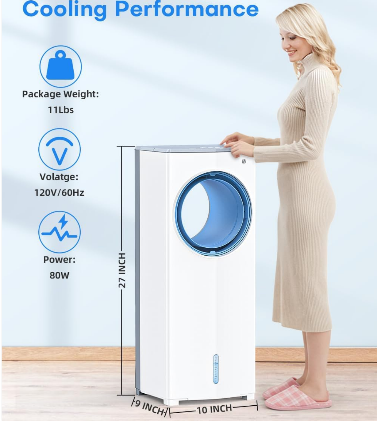
Image: Diagram showing the dimensions of the MYICY Evaporative Air Cooler, which is 27 inches tall, 10 inches deep, and 9 inches wide. It also indicates a package weight of 11 lbs, voltage of 120V/60Hz, and power of 80W.