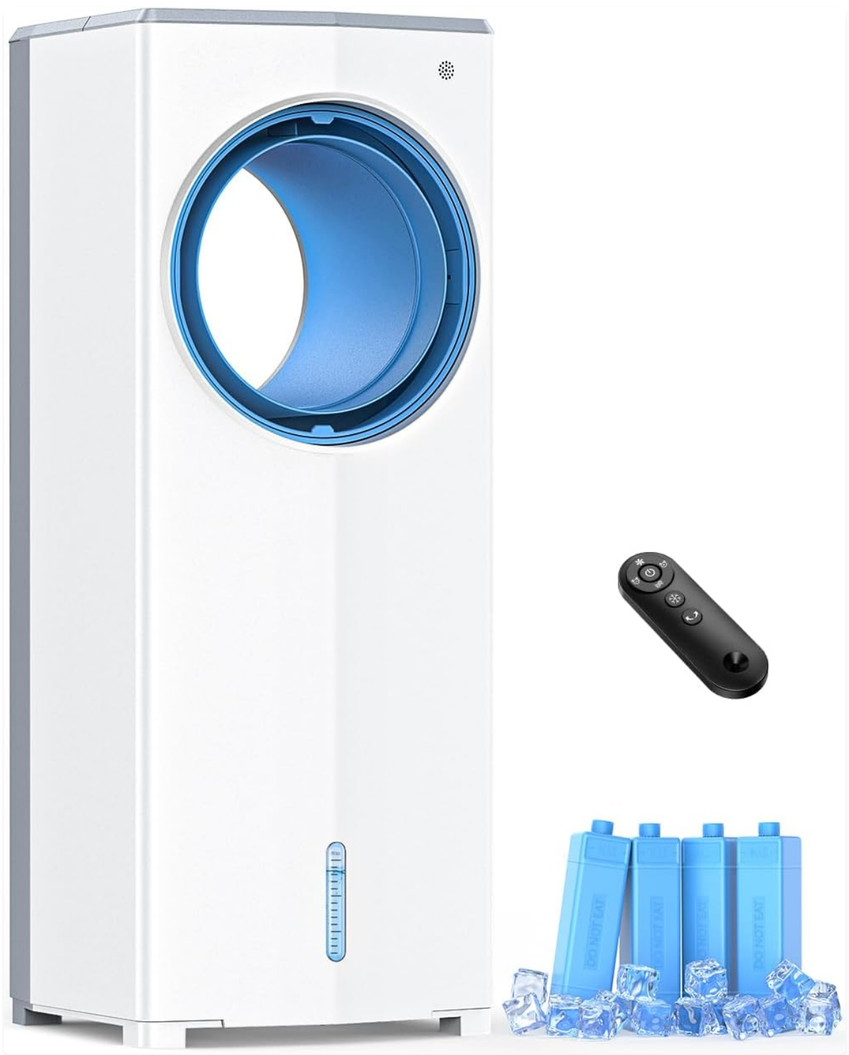
Image: Front view of the MYICY 27-Inch Evaporative Air Cooler, showing its sleek white design with a blue inner ring and a remote control and ice packs beside it.