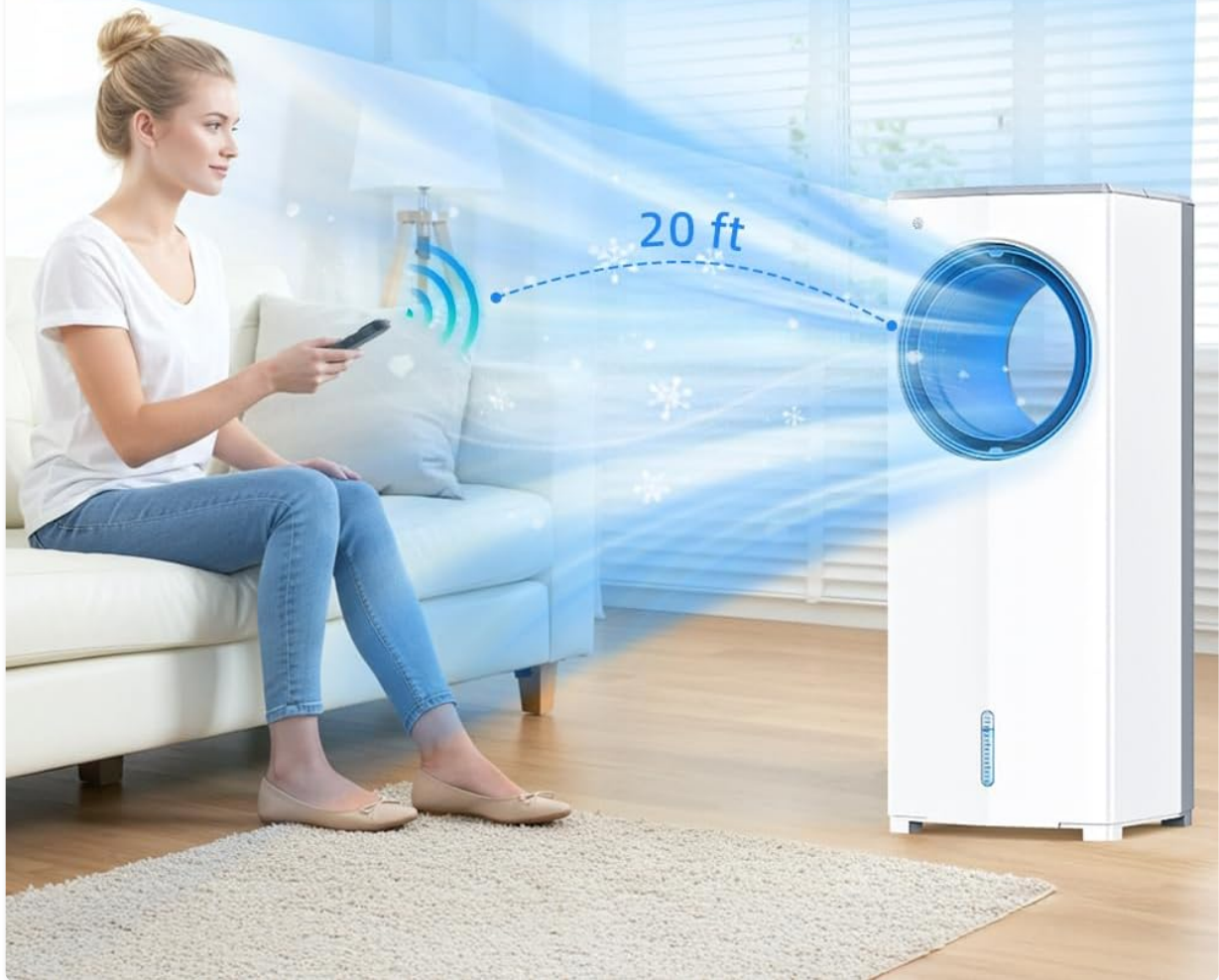
Image: A user operating the MYICY Evaporative Air Cooler with a remote control from a distance of 20 feet, showing the control panel icons for Cooling, Swing, Speed, Mode, Timer, and ON/OFF.