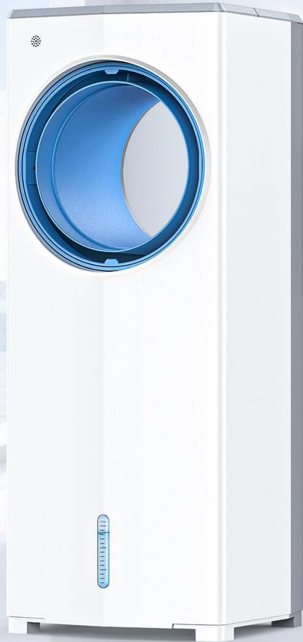
Image: Visual representation of the 4 modes (Normal, Natural, Sleep, Cooling) and 3 speeds (Low, Medium, High) available on the MYICY Evaporative Air Cooler.