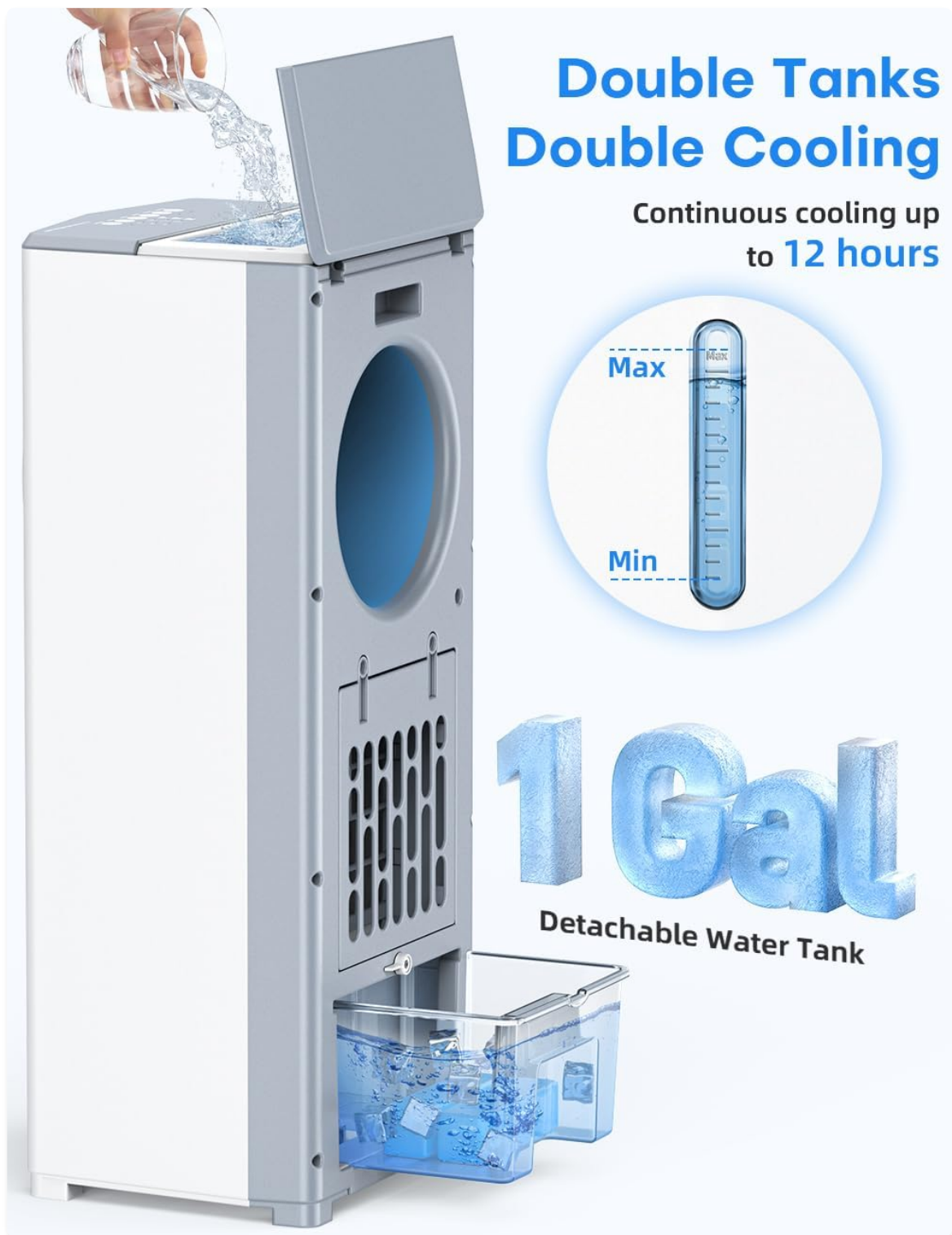
Image: Illustration showing how to fill the 1-gallon water tank of the evaporative air cooler, highlighting the "Max" and "Min" water level indicators and the detachable bottom tank.