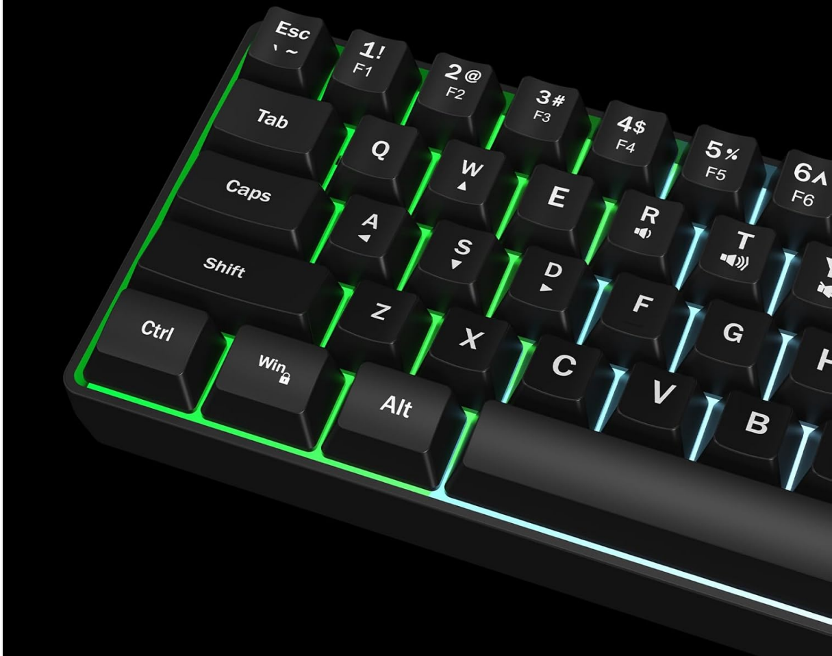
Image: Detailed diagram illustrating the FN key combinations for multimedia, function keys, and lighting controls.