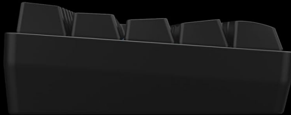
Image: The G70 keyboard displaying its vibrant RGB colorful light effects in both black and white color variants.

FN+U=Streamer speed acceleration FN+J=Streamer speed slows down FN+o or FN+L= Adjust the backlight brightness FN+I=Backlight off/on, cycle switch FN+K=Streamer light switch FN+K=Solid color light switch