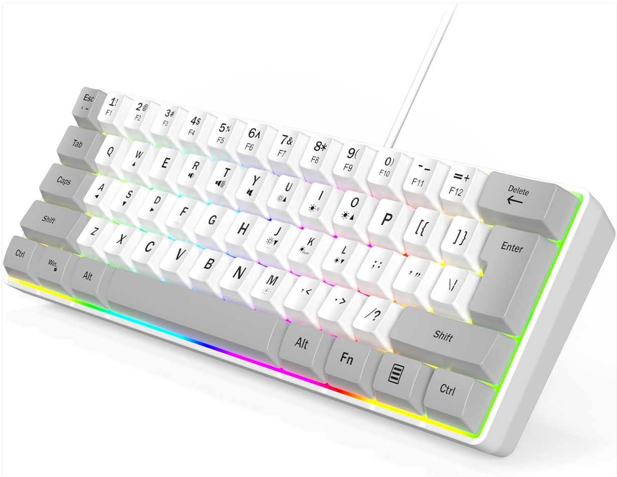
Image: The Generic G70 Wired RGB 60% Mini Gaming Keyboard, showing its compact design and wired USB-C connection.