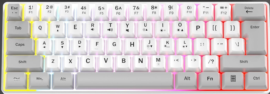
Image: The G70 keyboard with its dimensions clearly marked for reference.