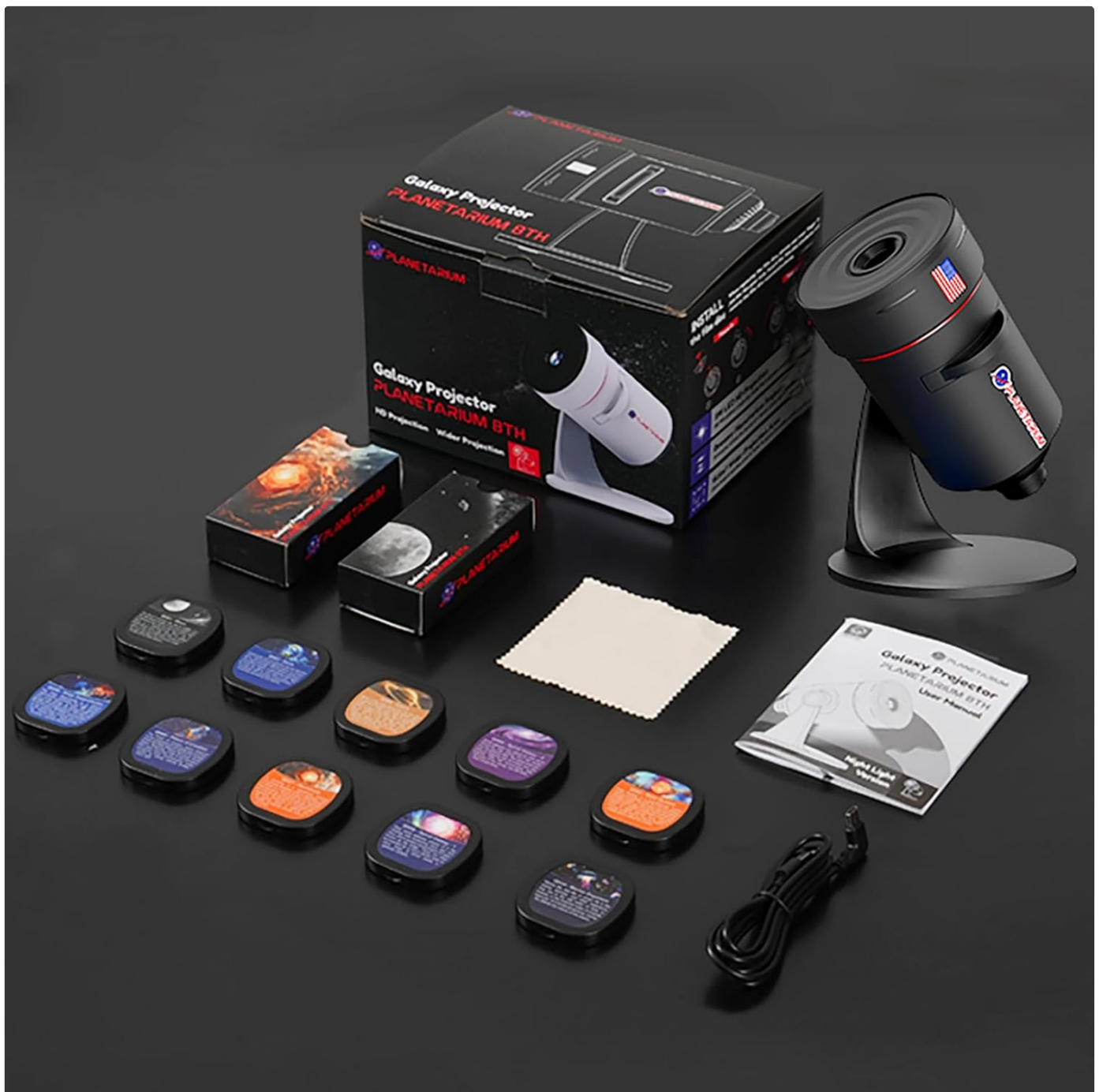
Image: The VanSmaGo Star Planetarium Galaxy Ceiling Projector with its various film discs, USB-C cable, and user manual.