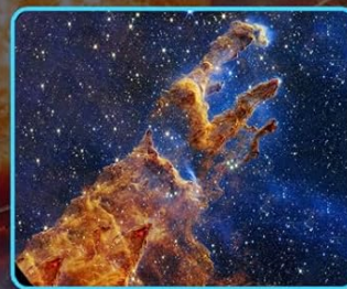
Pillars of Creation