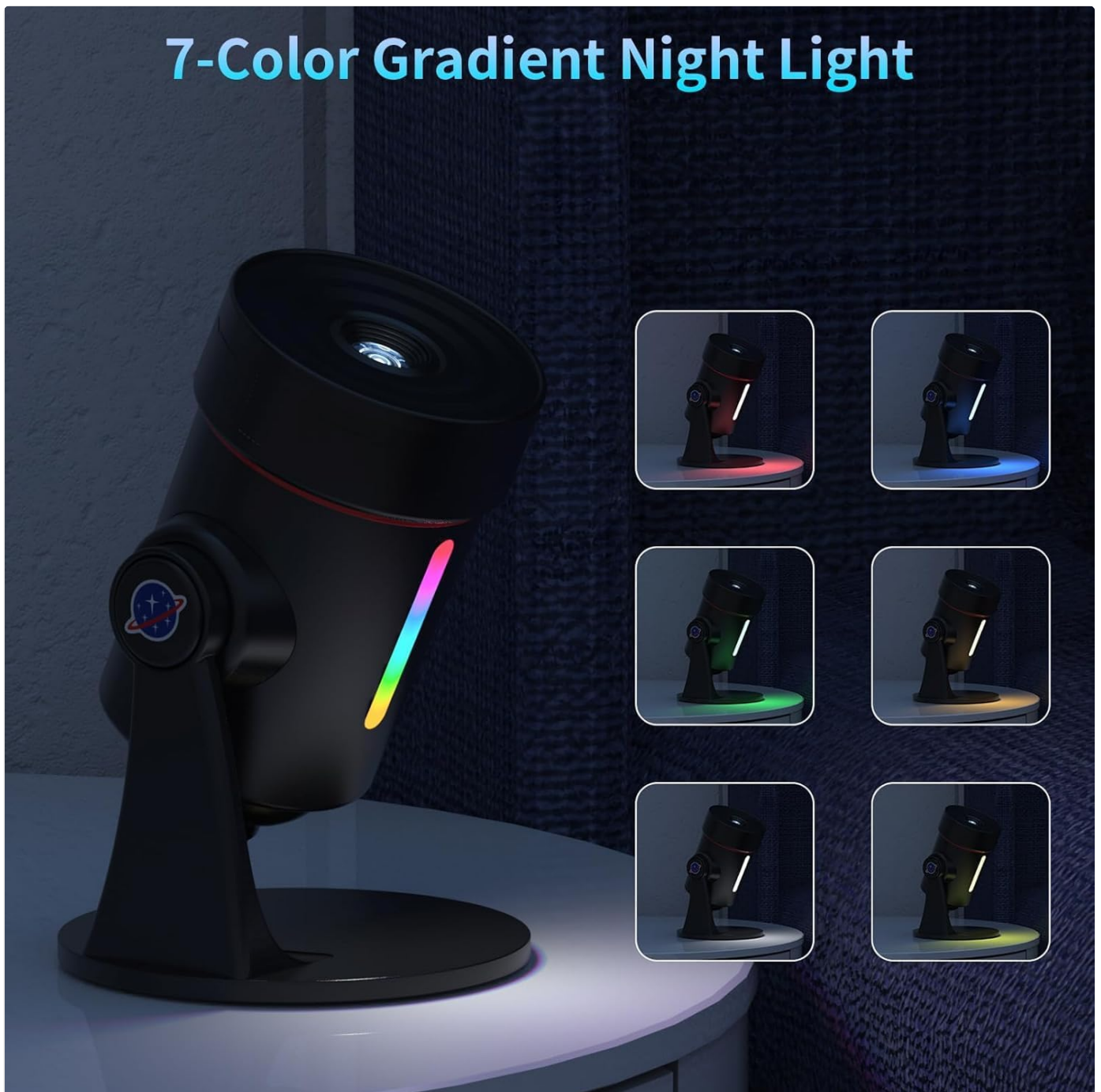
Image: The projector showcasing its 7-color gradient night light feature.