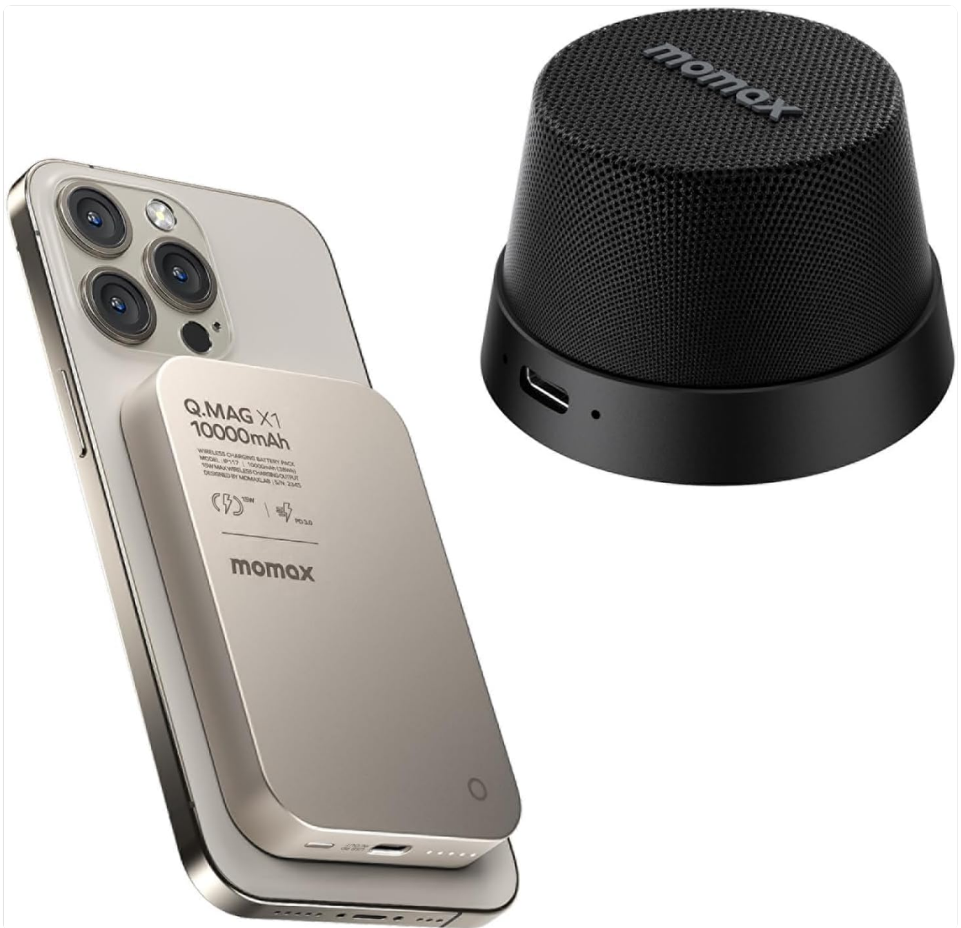
Image: The MOMAX Magnetic Power Bank wirelessly charging an iPhone, alongside the compact MOMAX Magnetic Mini Speaker.