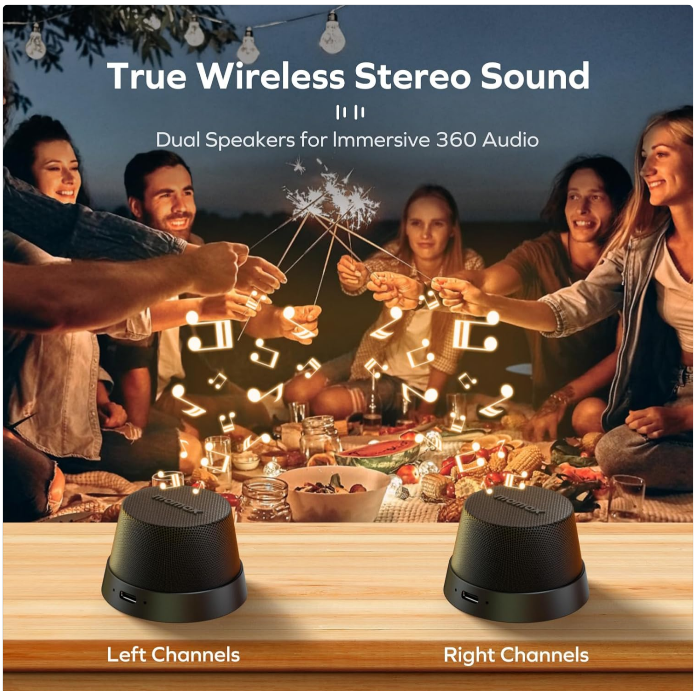
Image: An illustration of two MOMAX Magnetic Mini Speakers set up for True Wireless Stereo (TWS) sound, providing immersive 360-