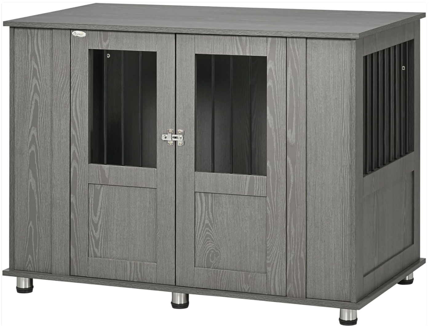
Figure 1: Front view of the PawHut Dog Crate Furniture. This image displays the overall design, including the double doors with clear panels and the side ventilation slats, showcasing its dual functionality as a pet enclosure and a piece of home furniture.