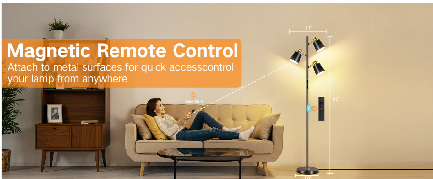
The memory function retaining the last lighting settings.