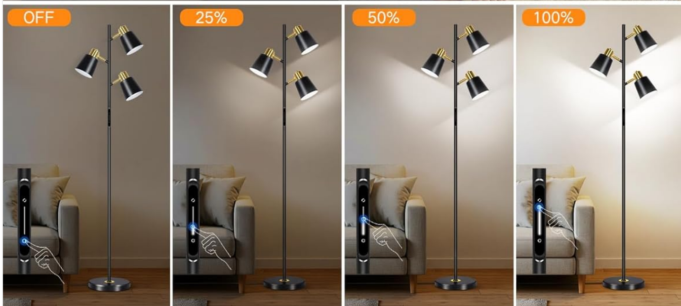
Image: Demonstration of touch-slide dimming and power control on the lamp pole.