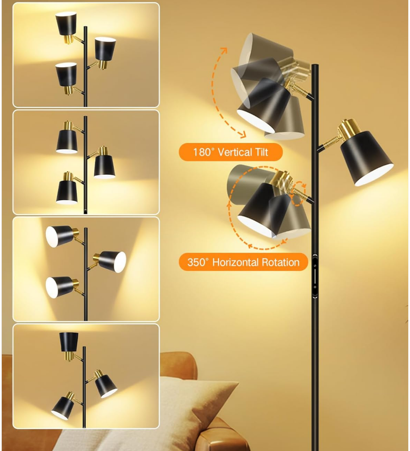
Image: Illustration of the flexible rotation and tilt of the lamp heads.

The head of the tree floor lamp rotates 350° and tilts 180°