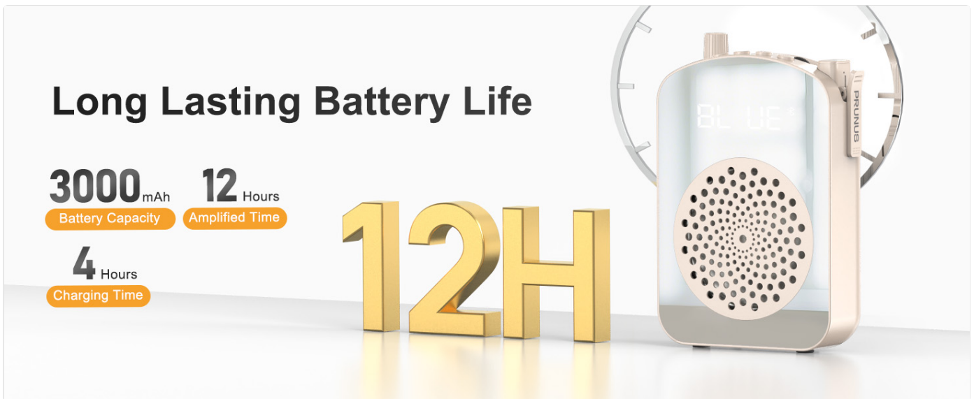
Battery life indicators for the amplifier and wireless microphone.