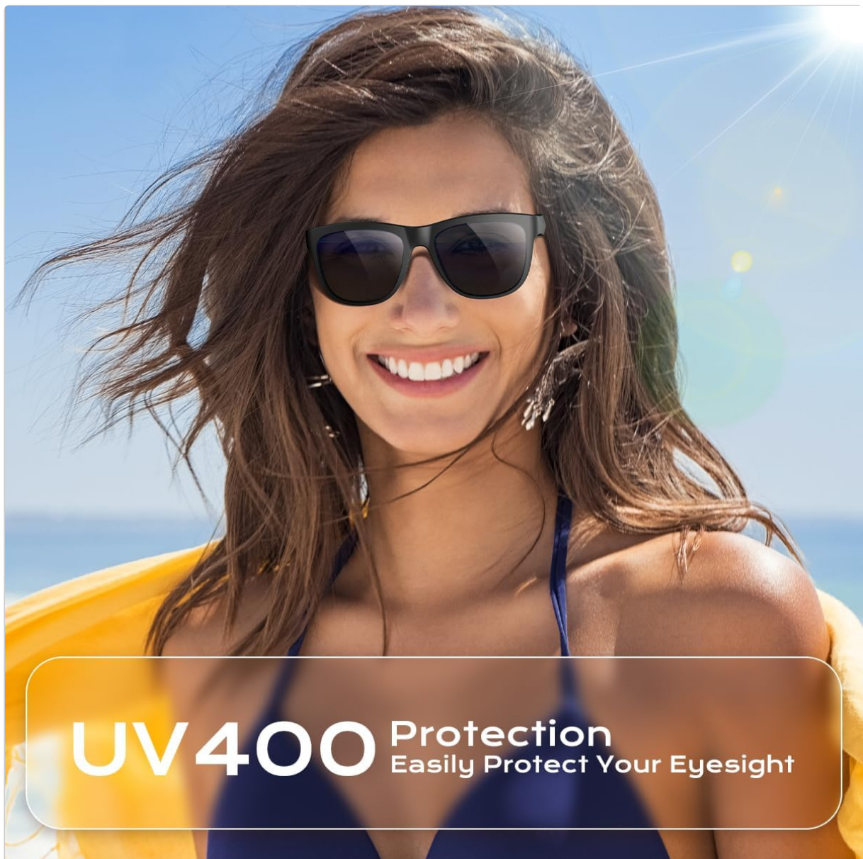
Image: A woman enjoying the sun while wearing the Smart Audio Sunglasses, highlighting the UV400 protection feature.