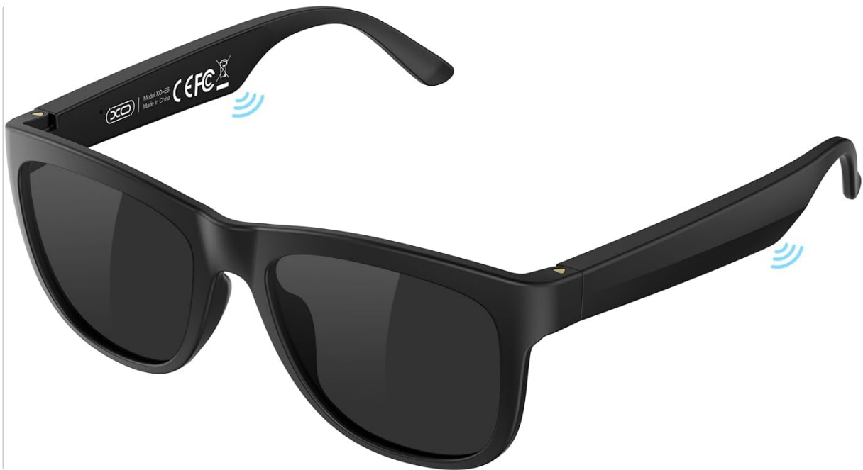
Image: The XO Simple is Beauty Smart Audio Sunglasses Model E6, showcasing their sleek design.