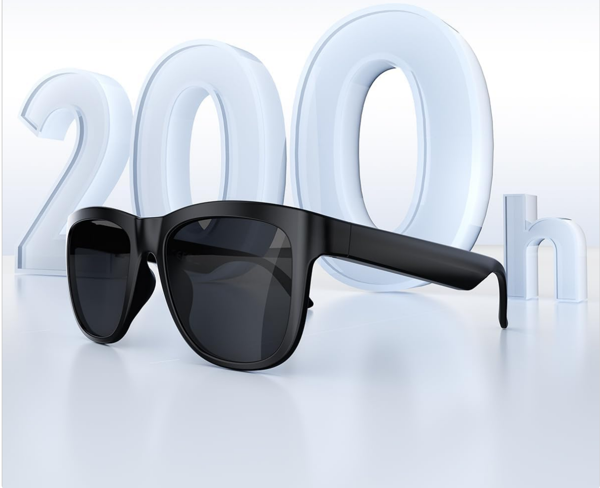
Image: The Smart Audio Sunglasses displayed with an emphasis on their impressive 200-hour standby time.