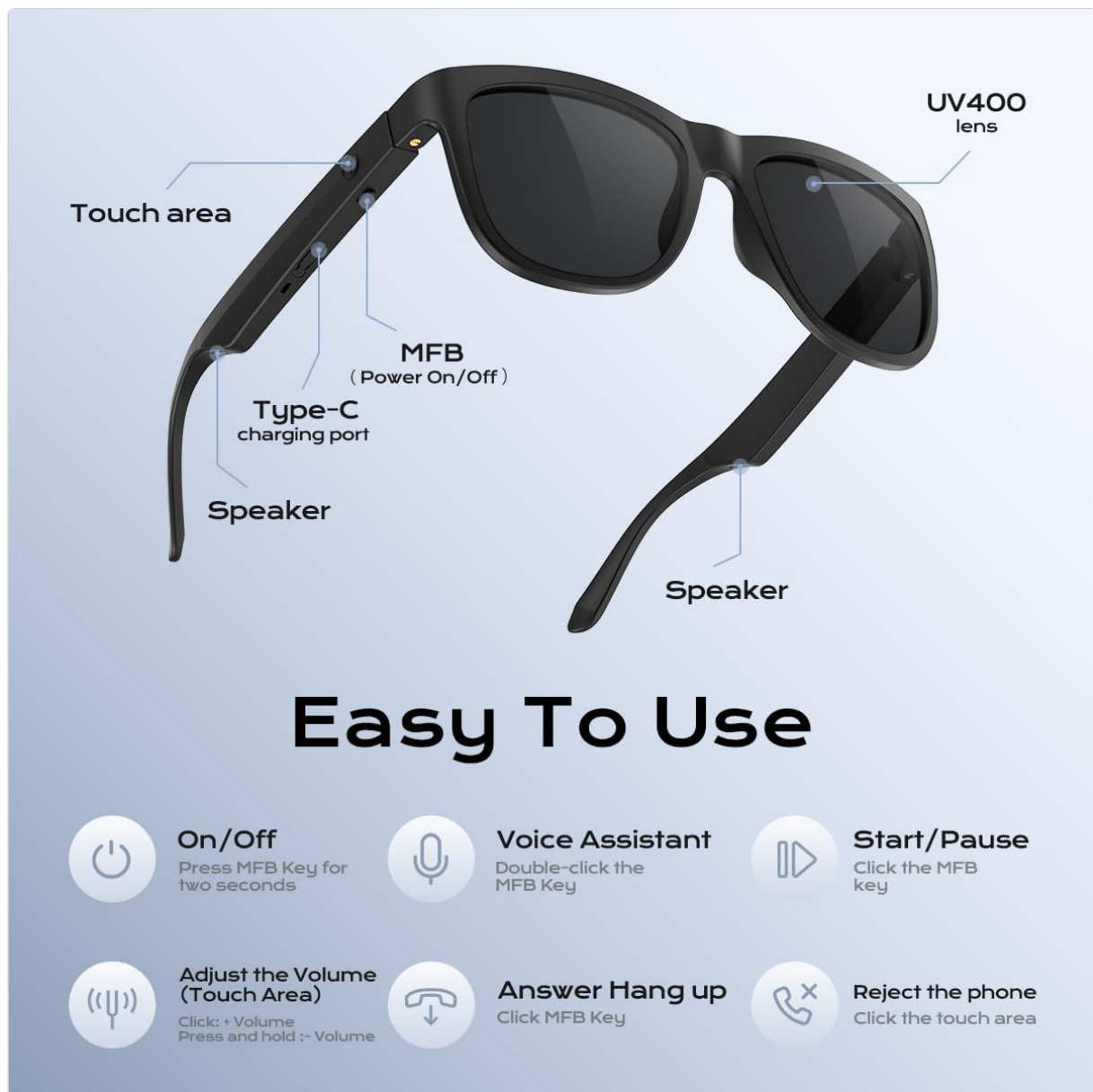
Image: A detailed diagram highlighting the touch area, MFB button, Type-C charging port, and speakers on the sunglasses.