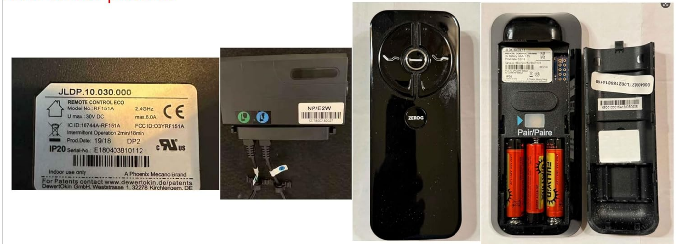
Image: A visual guide emphasizing the importance of verifying compatibility by sending clear pictures of your control box and old remote (front and back) to the seller before purchase.

Remote is Not Universal, Before placing your order, please send some clear pictures of your control box and old remote (front & back) in order to match the Right remote for your bed, refer to our pictures