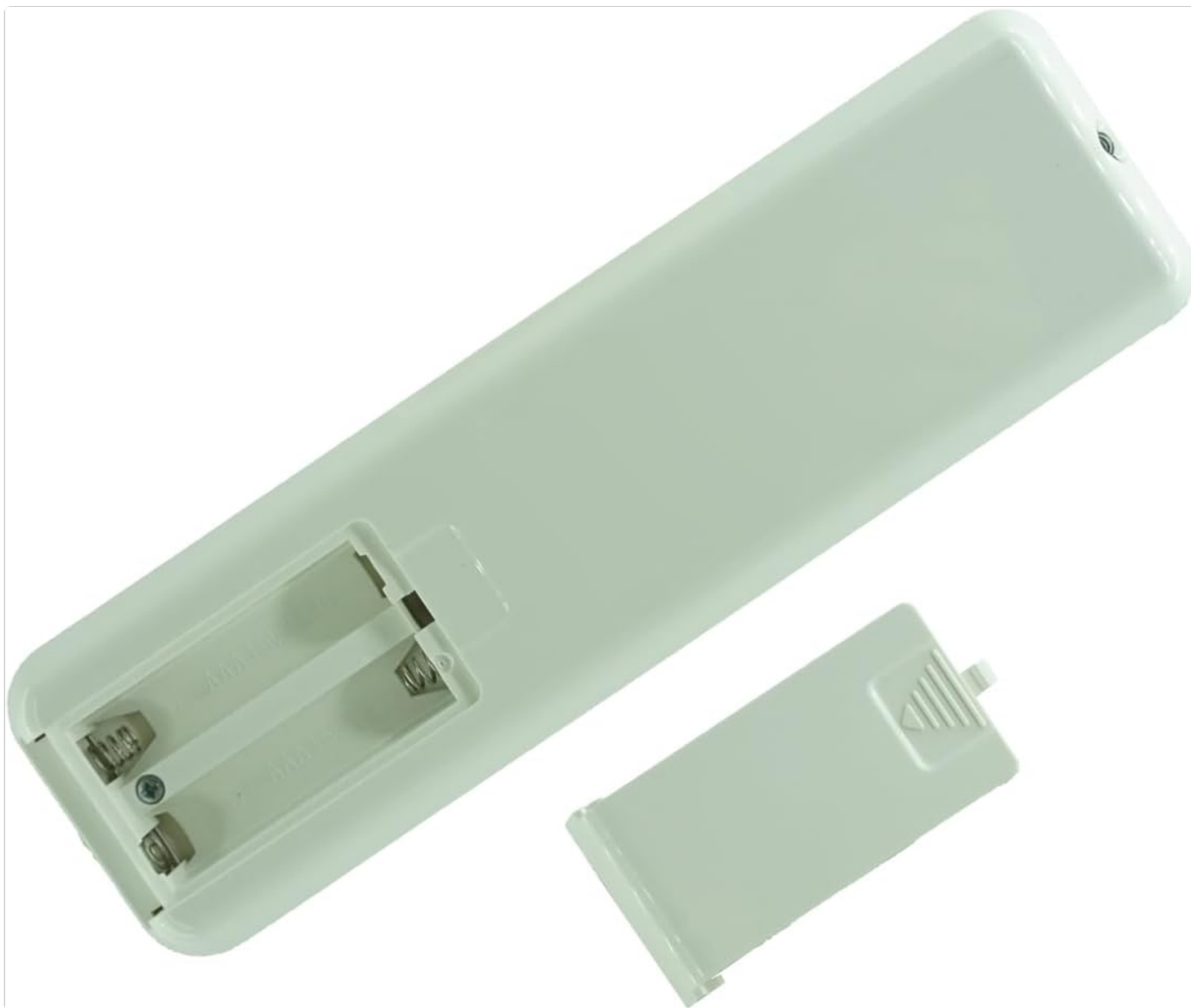
Image: Rear view of the remote control with the battery compartment open, showing the slots for two AAA batteries.