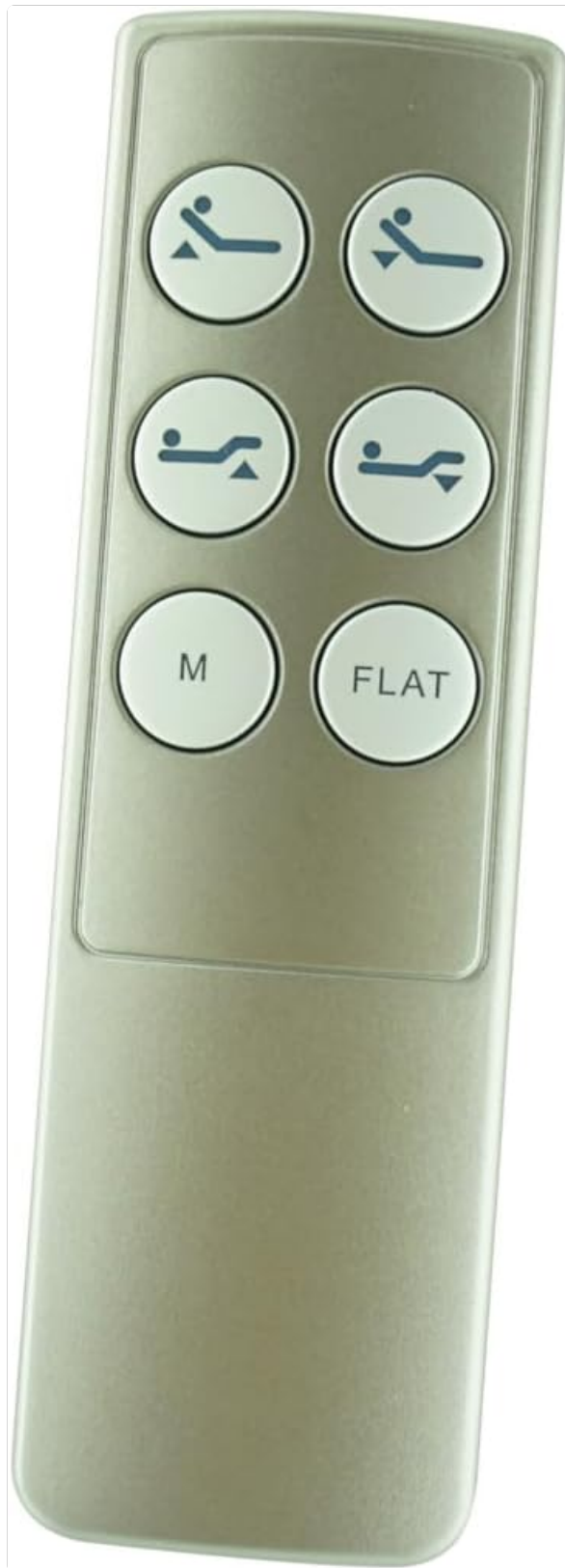
Image: Front view of the remote control, displaying its six primary buttons: head up, head down, foot up, foot down, 'M' for memory, and 'FLAT' for flat position.