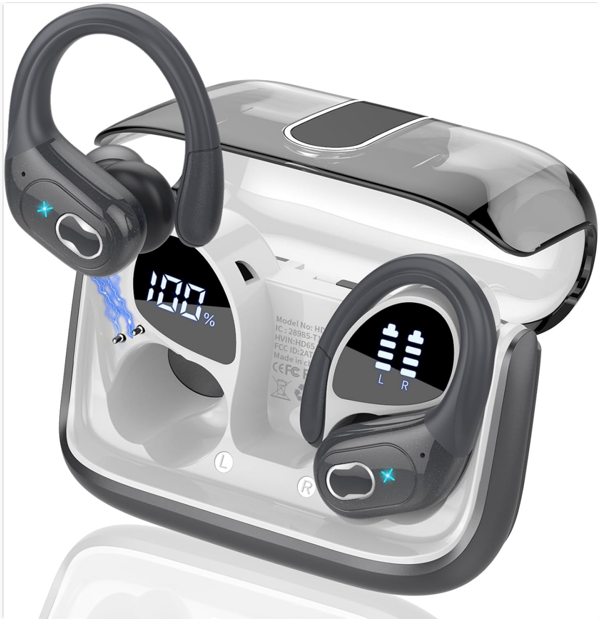
Image: The Aptkdoe HD65 Wireless Earbuds shown inside their transparent charging case, displaying LED indicators for battery levels.