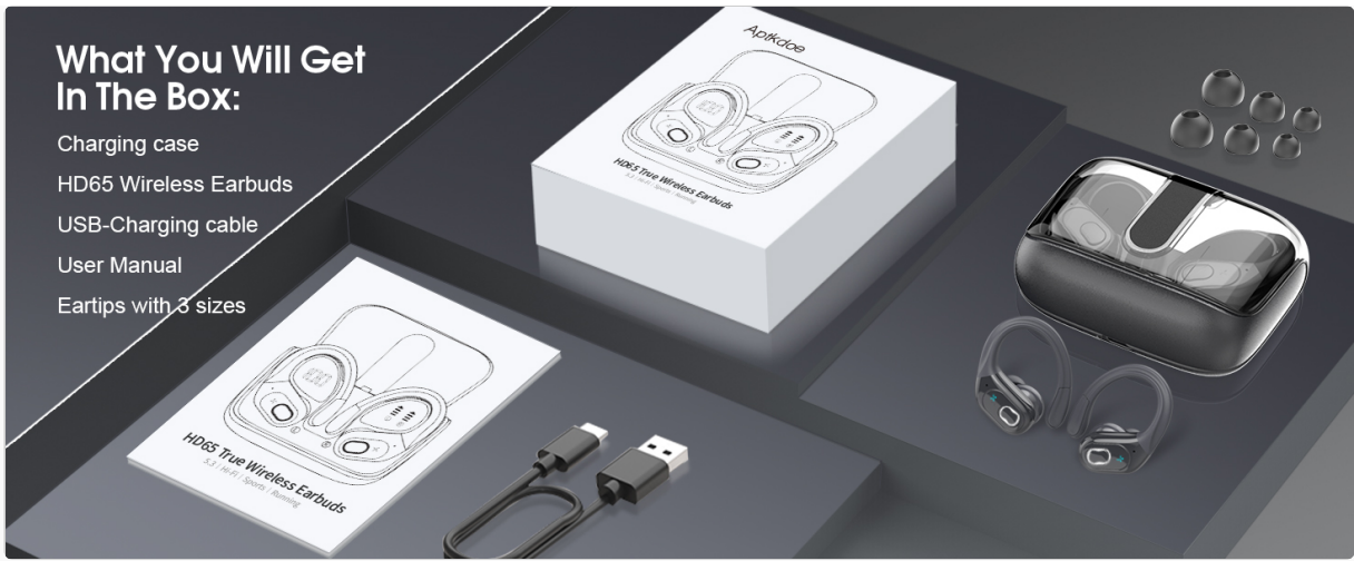
Image: A visual representation of the package contents, including the earbuds, charging case, USB-C cable, and ear tips.