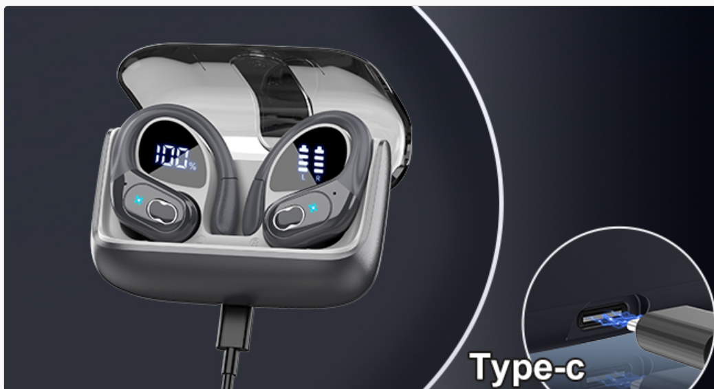
Image: The charging case with its LED digital display showing the battery percentage of the case and the charging status of the left and right earbuds.