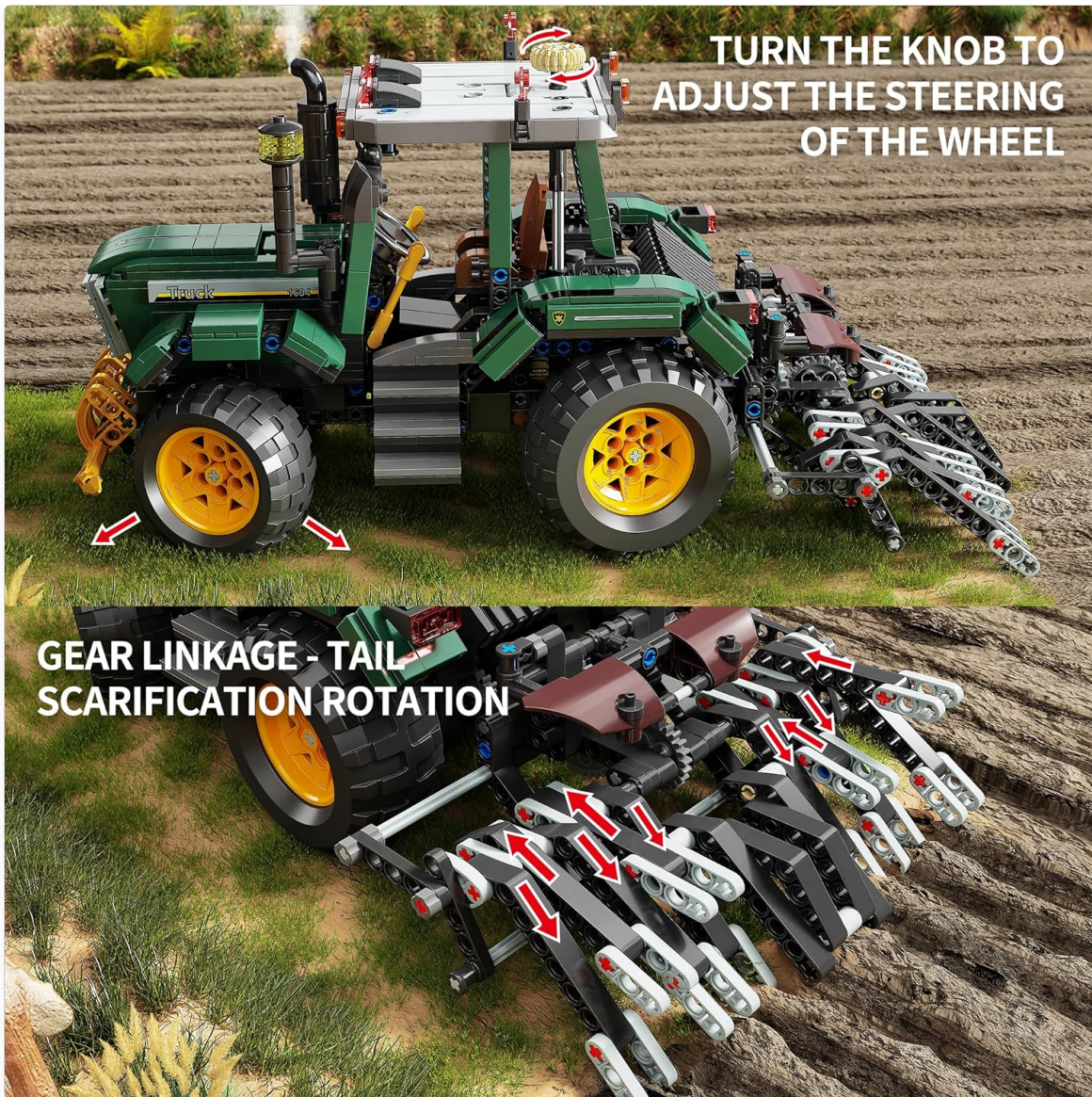
Image: This image illustrates the top-mounted knob used to adjust the steering of the front wheels and the gear linkage that drives the tail scarification tool's rotation.