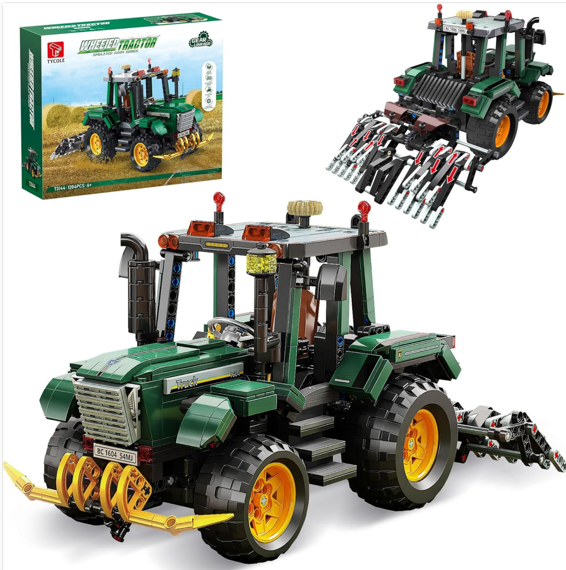
Image: The fully assembled Farm Tractor Building Blocks Set, showcasing its detailed design and green and yellow color scheme.