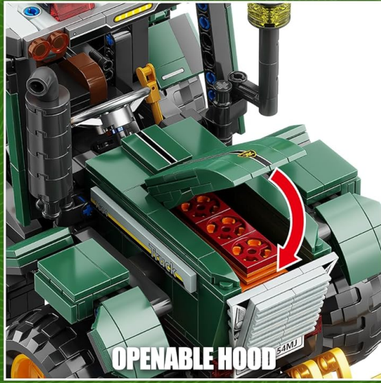
Image: Detailed views highlighting the simulated cockpit, manual steering wheel, the scarification tool's mechanism, and the openable engine hood of the tractor model.