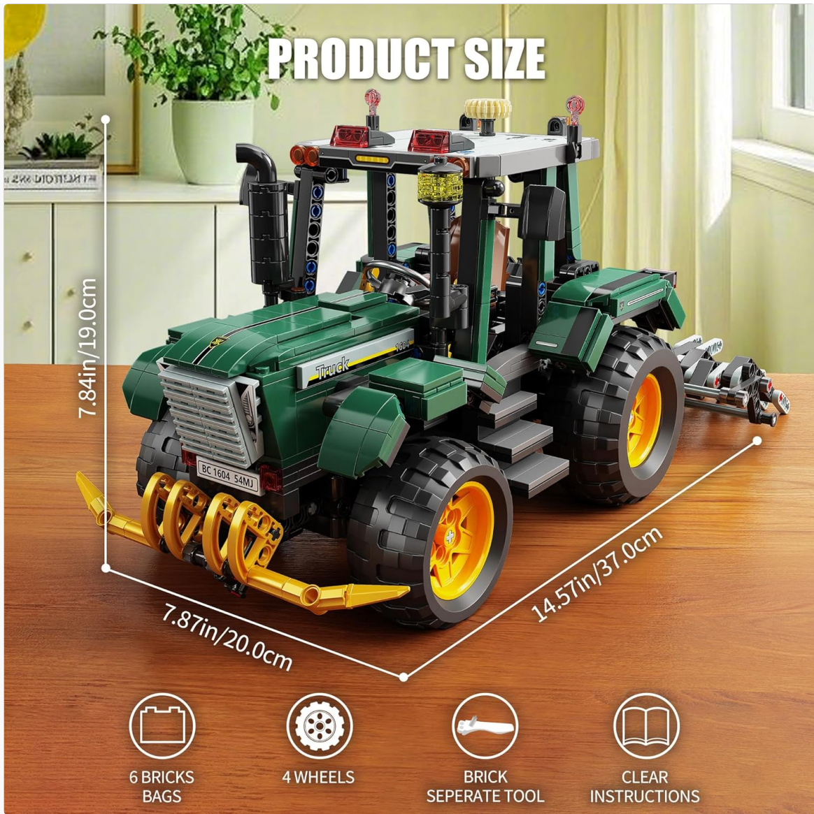
Image: A visual representation of the product's size and key components, including the number of brick bags, wheels, brick separator tool, and clear instructions.