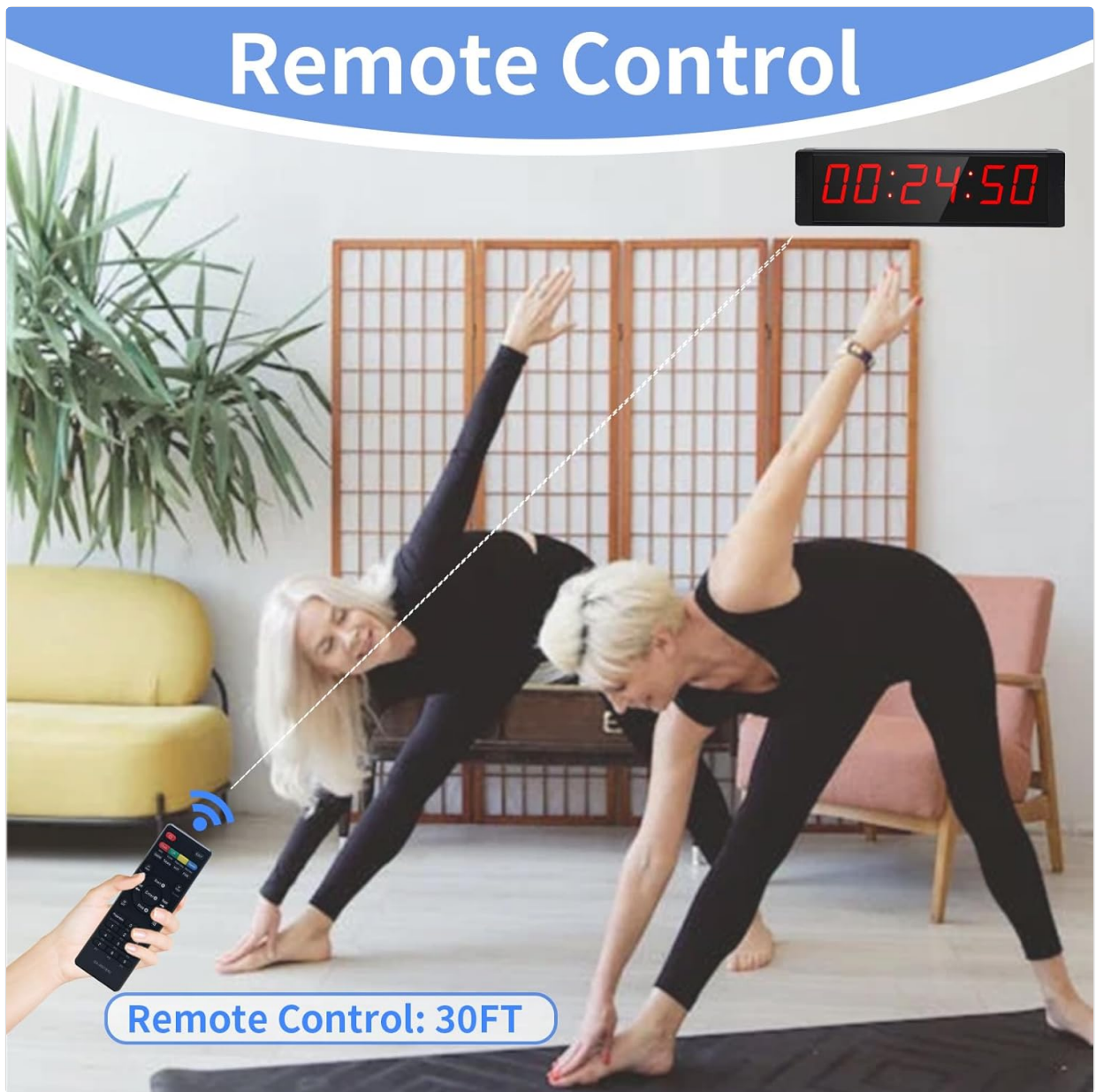
Figure 7: Remote control in use, highlighting its range and convenience.