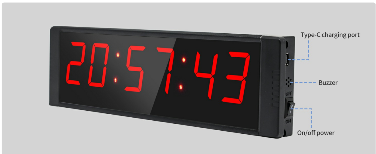
Figure 2: Contents of the Ousmile Digital Gym Timer package.