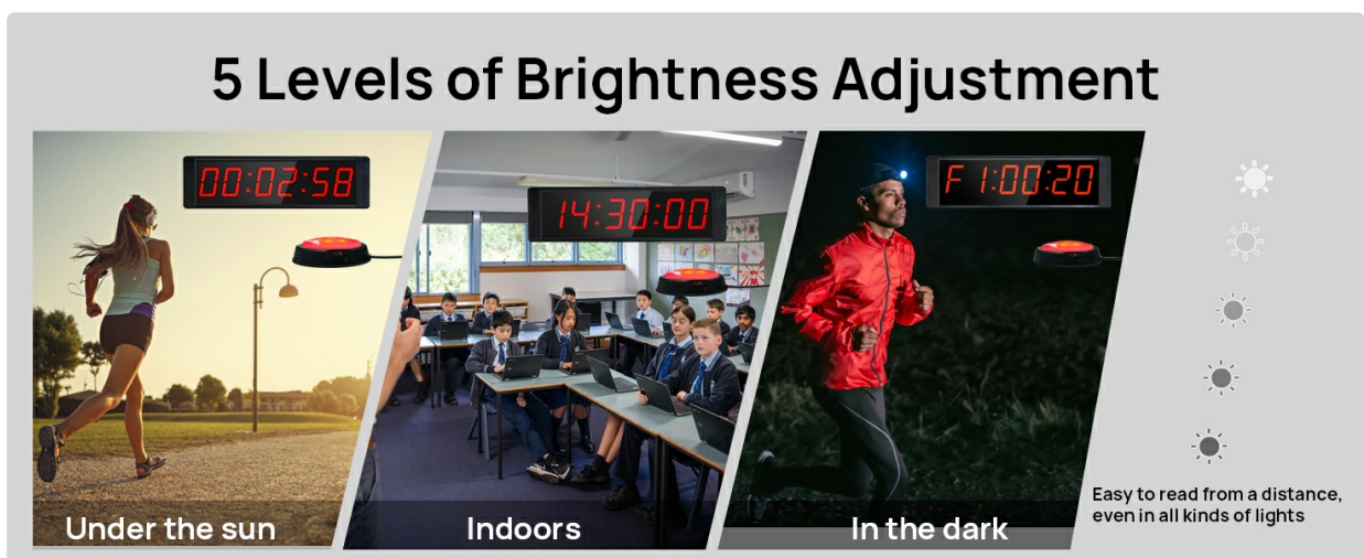
Figure 9: Brightness adjustment for optimal visibility in various lighting conditions.