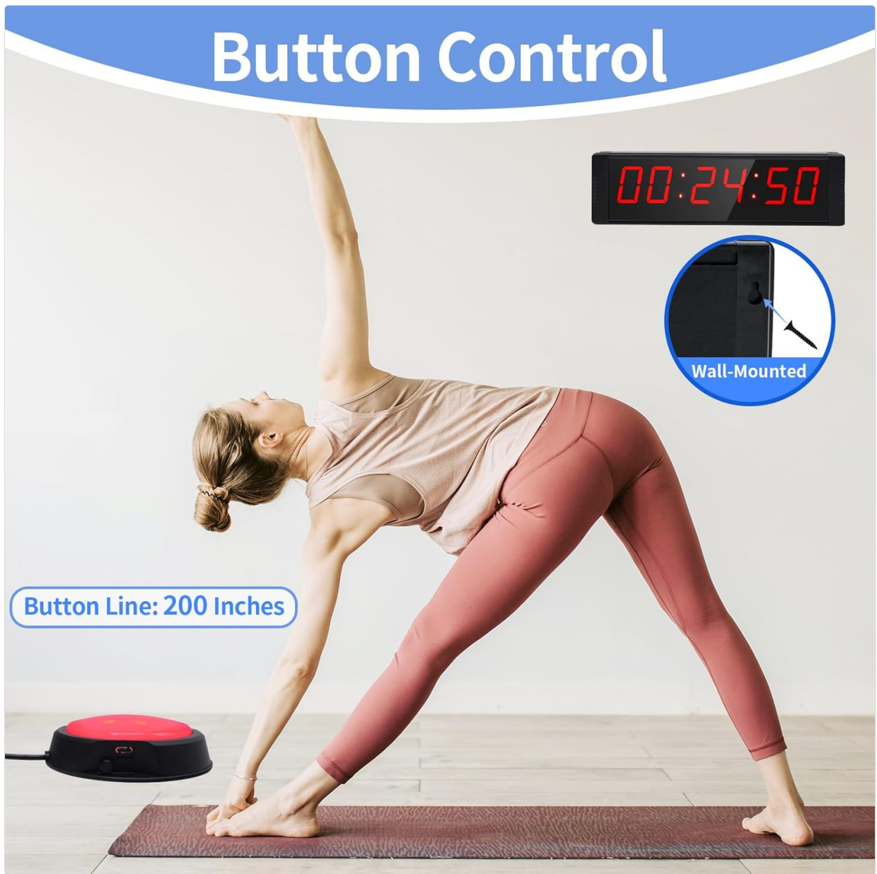
Figure 5: External pushbutton in use, demonstrating its extended cable length for flexible placement.