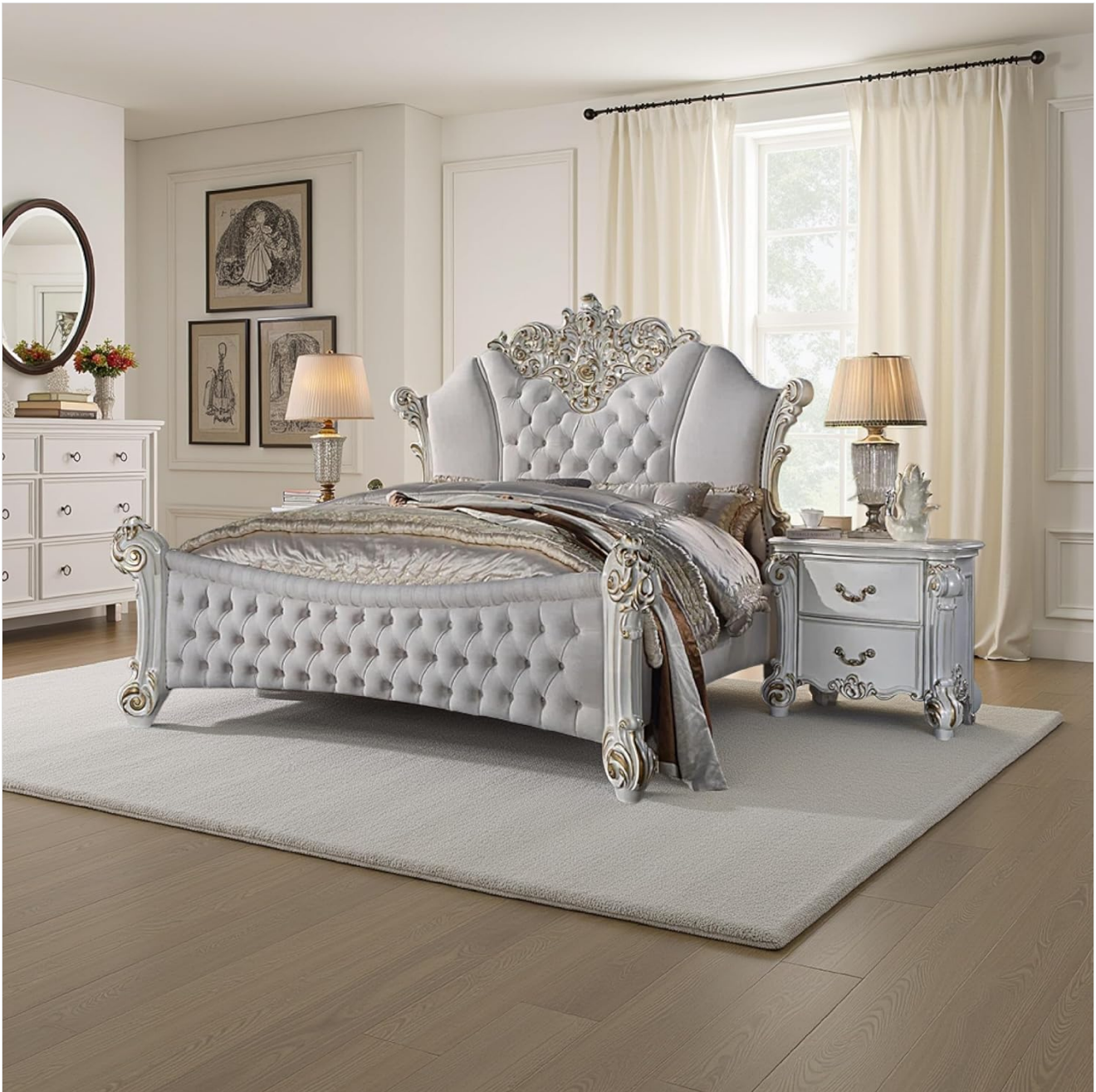
Image: Fully assembled Benzara Antoine King Size Bed.