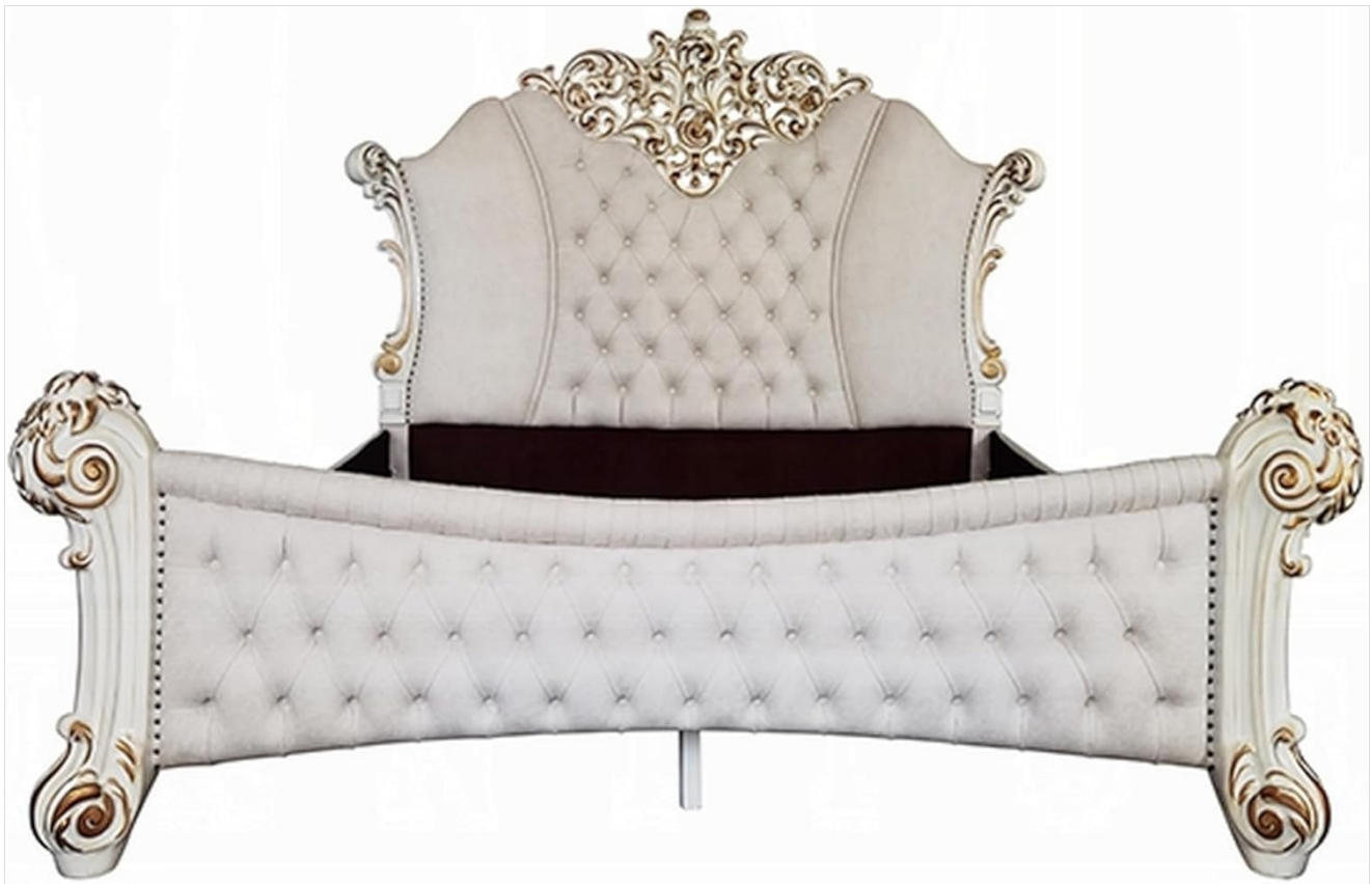
Image: All components of the Benzara Antoine King Size Bed laid out, including the ornate headboard, footboard, side rails, and hardware.