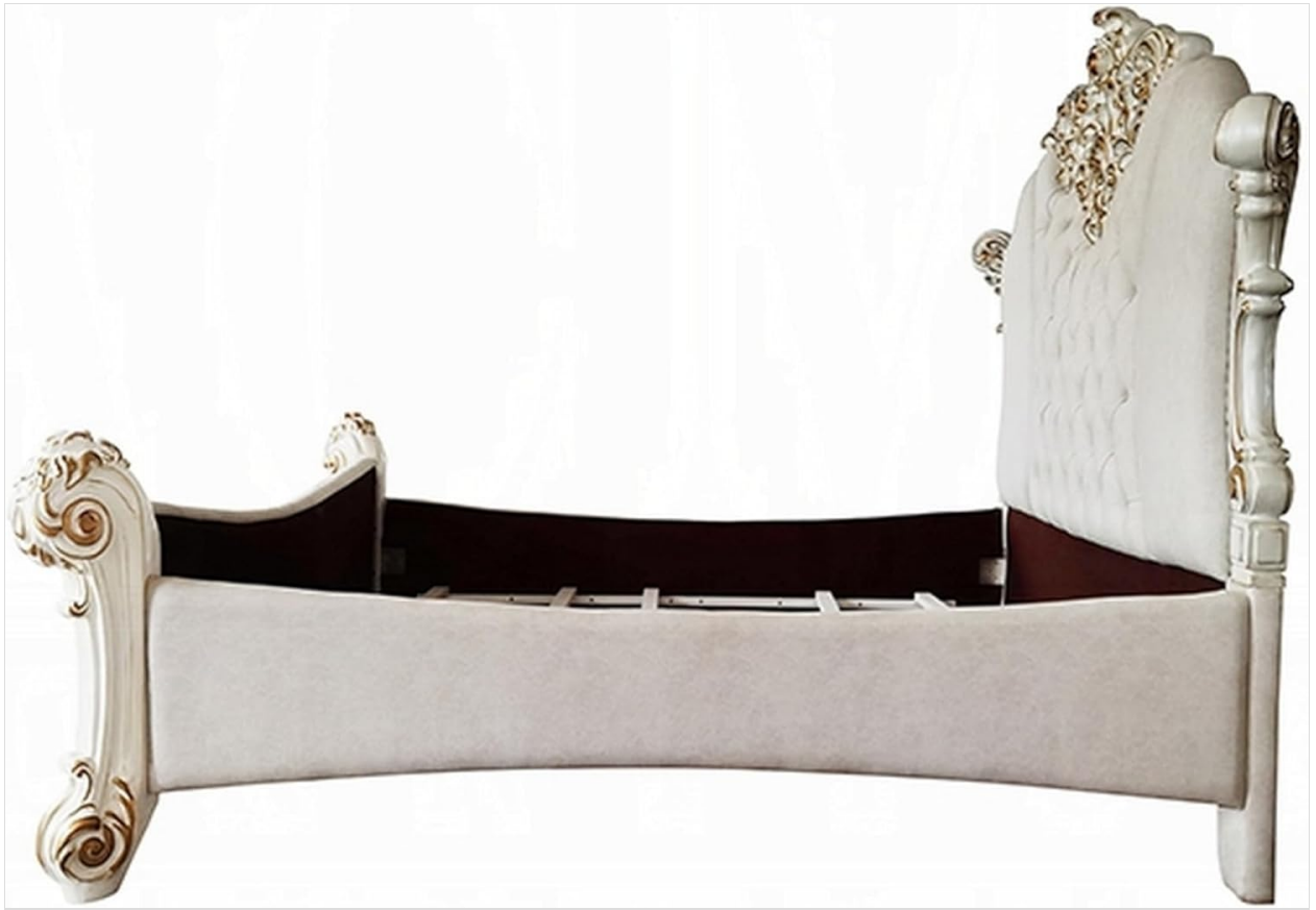
Image: Side view of the bed, illustrating the connection of the side rail to the headboard.

Repeat Step 1 for the footboard, connecting the other end of the side rails. Ensure the footboard is facing the correct direction. Once all connections are made, fully tighten all bolts using the provided Allen wrench.