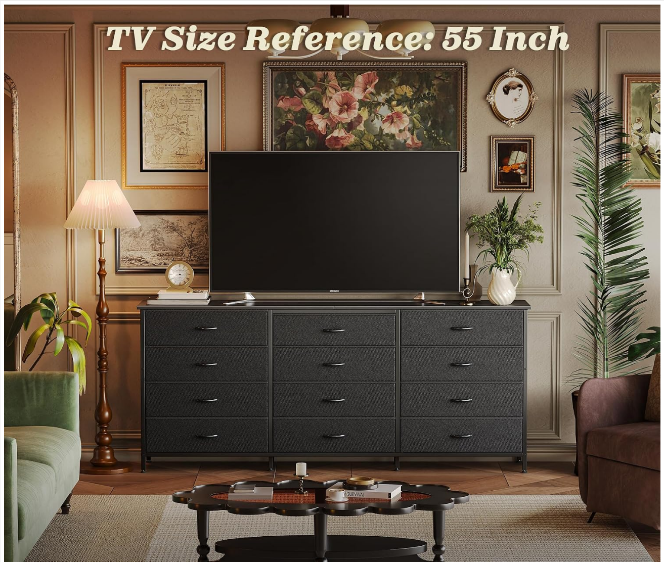
Image 5: The dresser functioning as a TV stand, accommodating a 55-inch television in a living room setting.