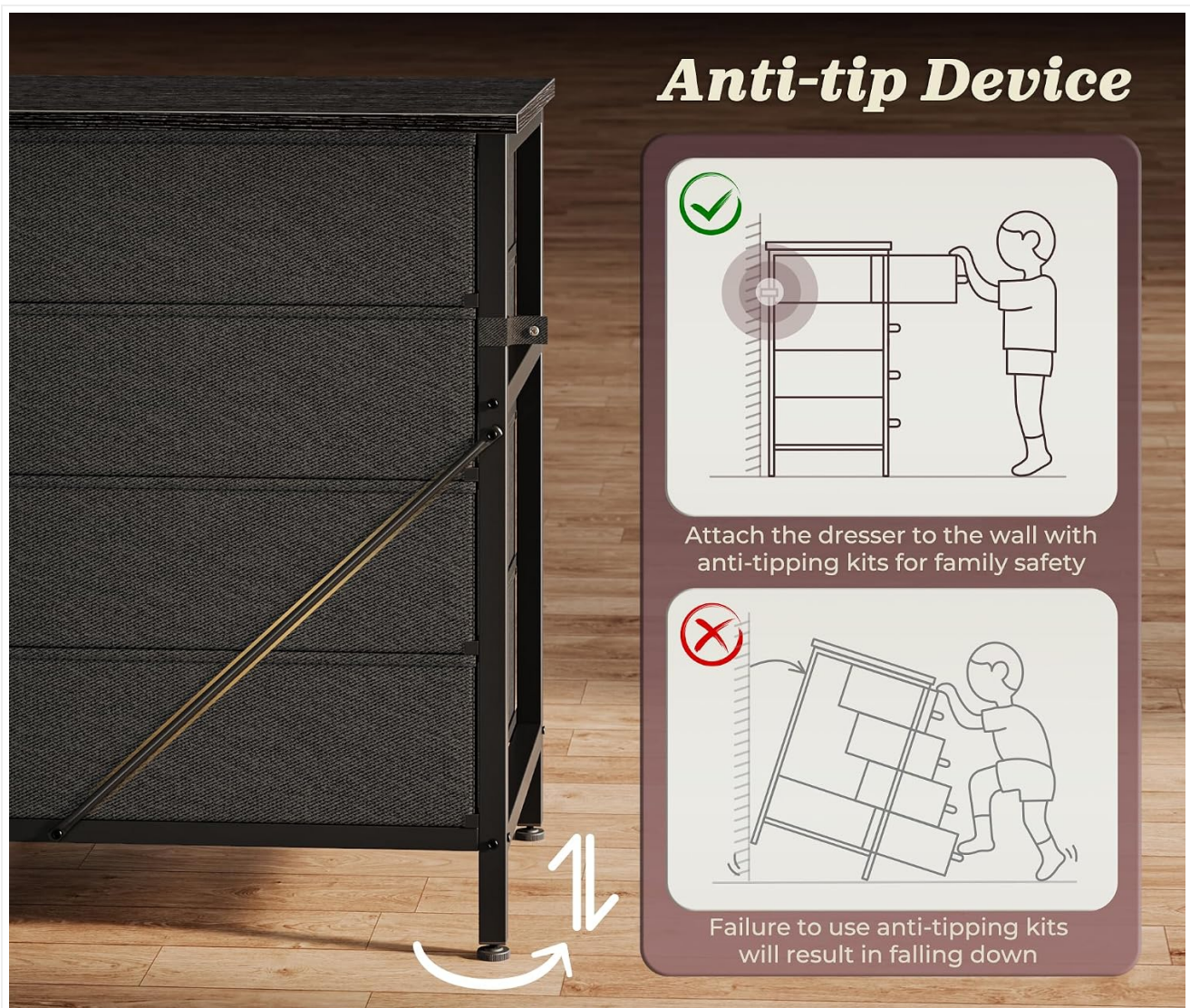
Image 2: Diagram demonstrating the correct installation of the anti-tip device for enhanced safety.