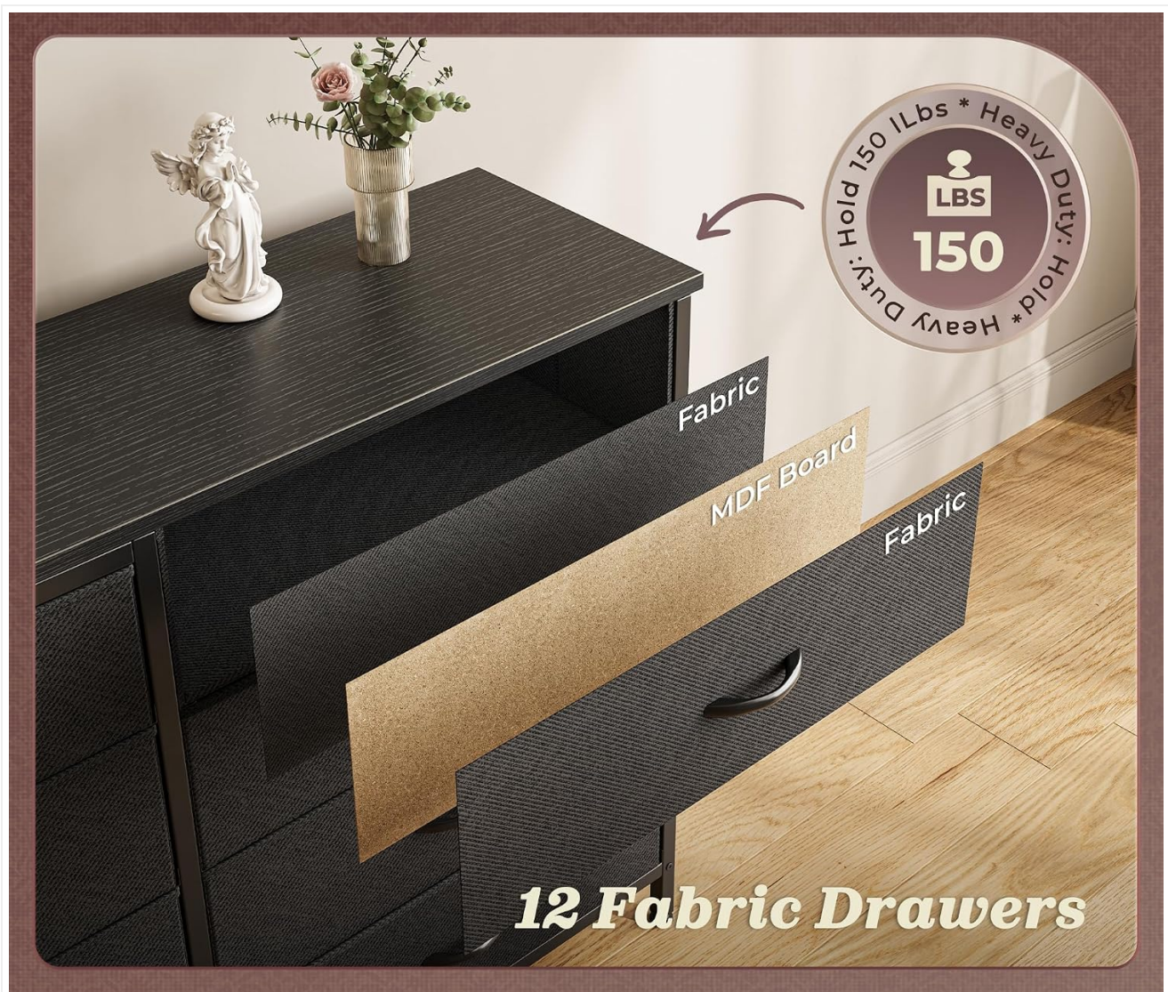
Image 3: Detailed view of a fabric drawer, highlighting its construction with an internal MDF board for support.