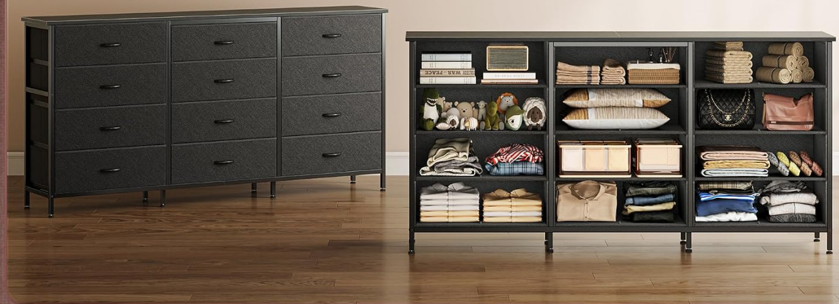
Image 4: Visual representation of the dresser's storage capabilities, illustrating how various items can be organized within its drawers.