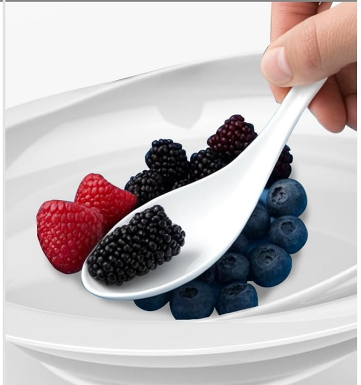
Image: The white color of the plate enhancing food recognition.