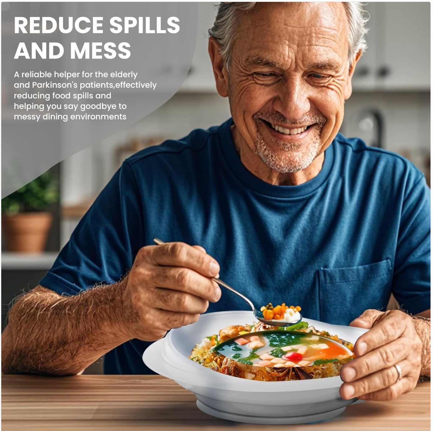
Image: Demonstrating the plate's effectiveness in reducing spills.

A reliable helper for the elderly and Parkinson's patients, effectively reducing food spills and helping you say goodbye to messy dining environments