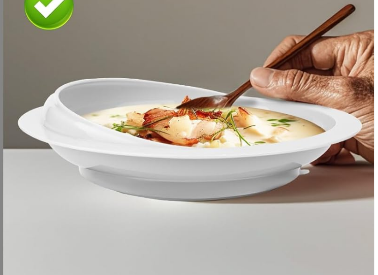
Image: Visual comparison of spill prevention with high-rimmed plates.