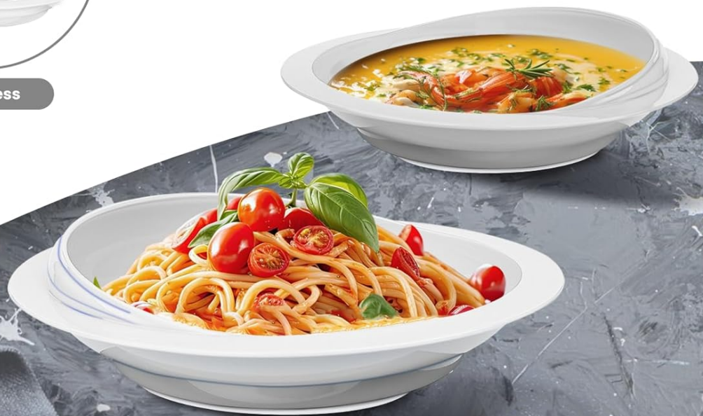
Image: Detailed view of product features including the removable suction pad and spill-proof design.