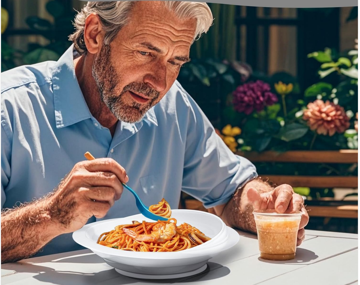
Image: User demonstrating the MOSKESON Spill Proof Scoop Plate.

This spoon bowl/plate features a removable non-slip pad design, ensuring it stays securely in place during use