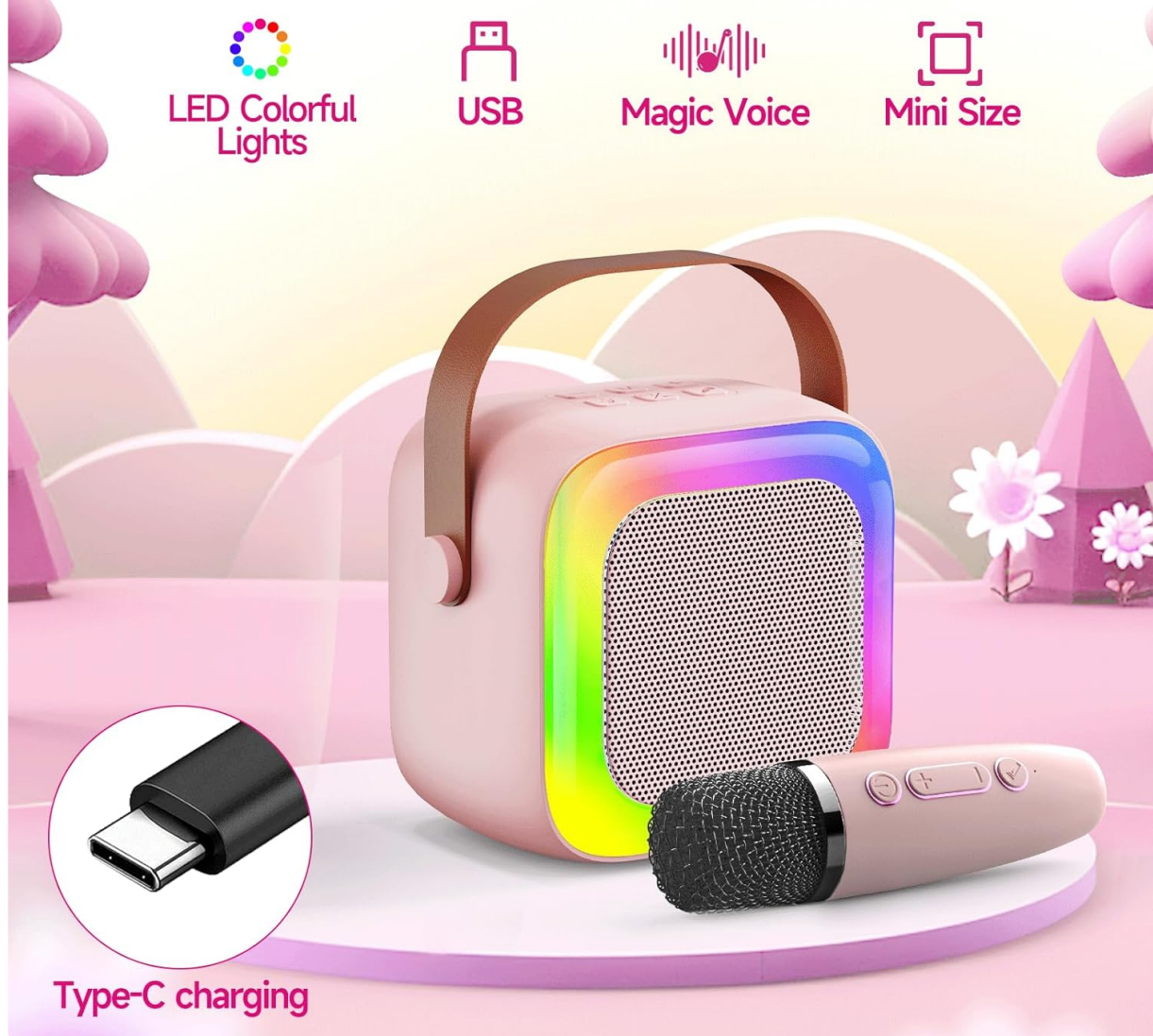
Figure 2: Speaker with Type-C charging port highlighted.