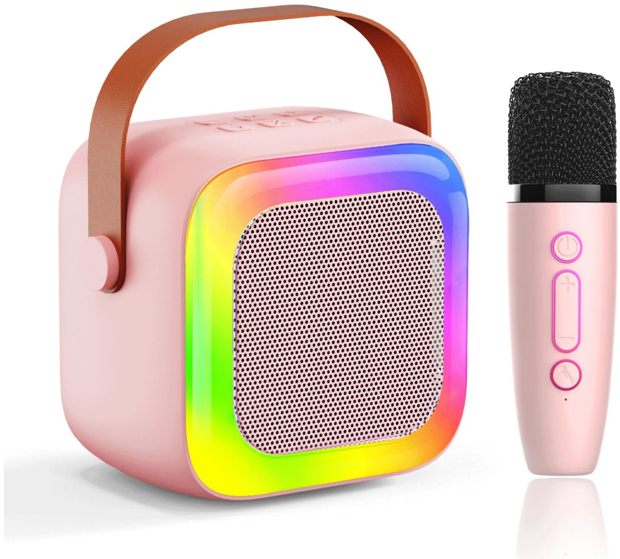
Figure 1: Main product image showing the speaker and one microphone.