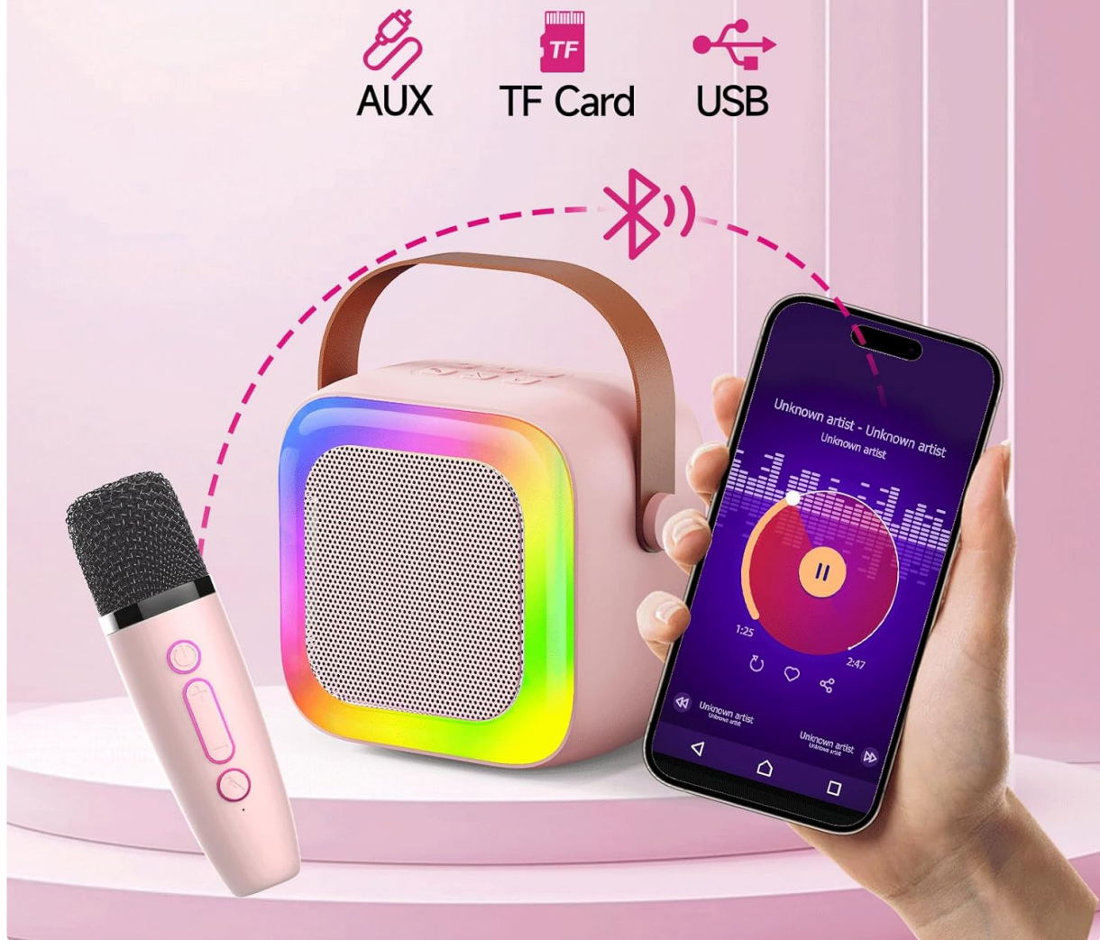
Figure 3: Speaker showing Bluetooth, TF Card, USB, and AUX connectivity.