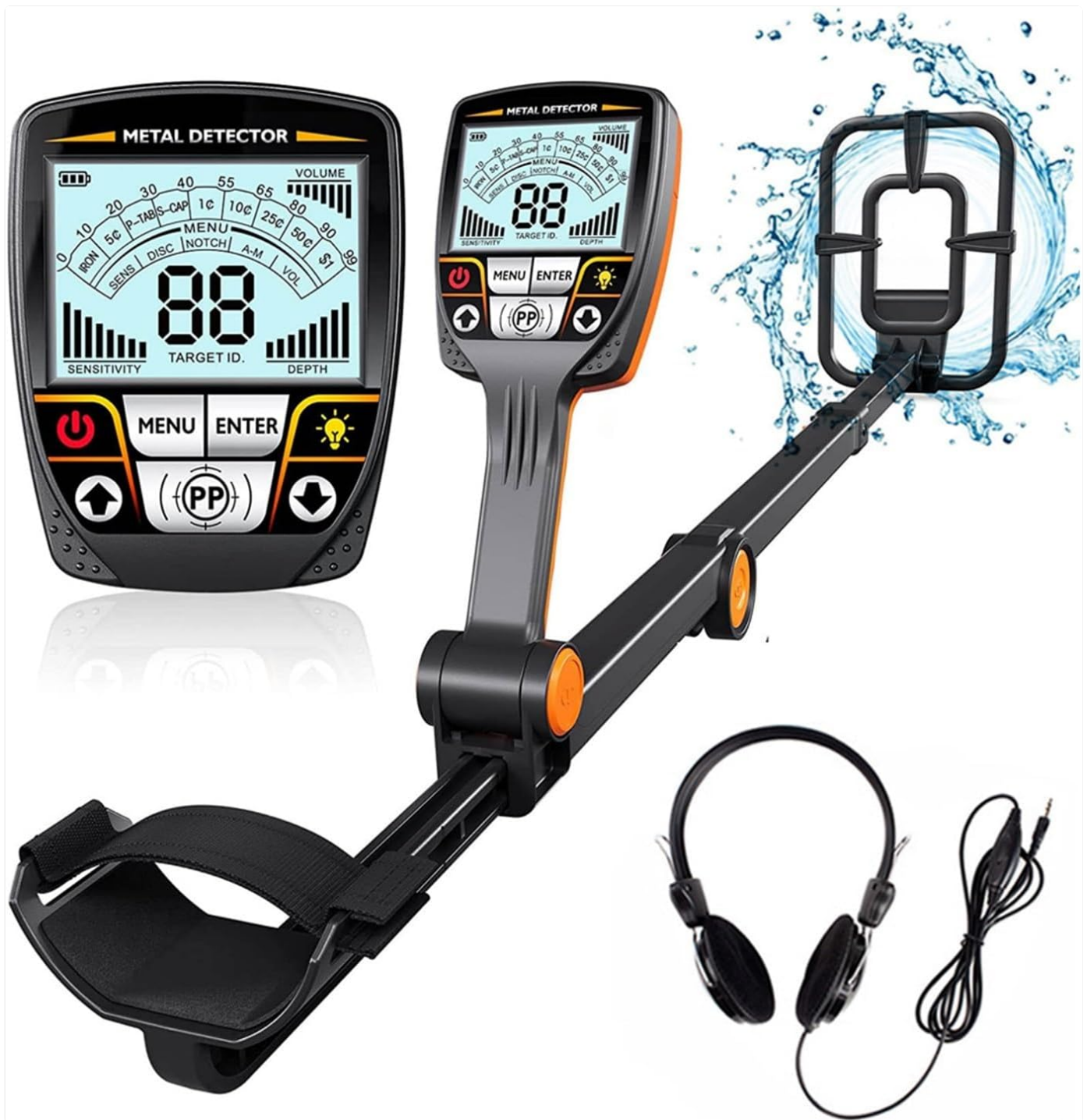
Image: The complete BUUBO TX-640H metal detector assembly, including the main unit with its control panel, the foldable shaft, the waterproof search coil, and a pair of wired headphones.