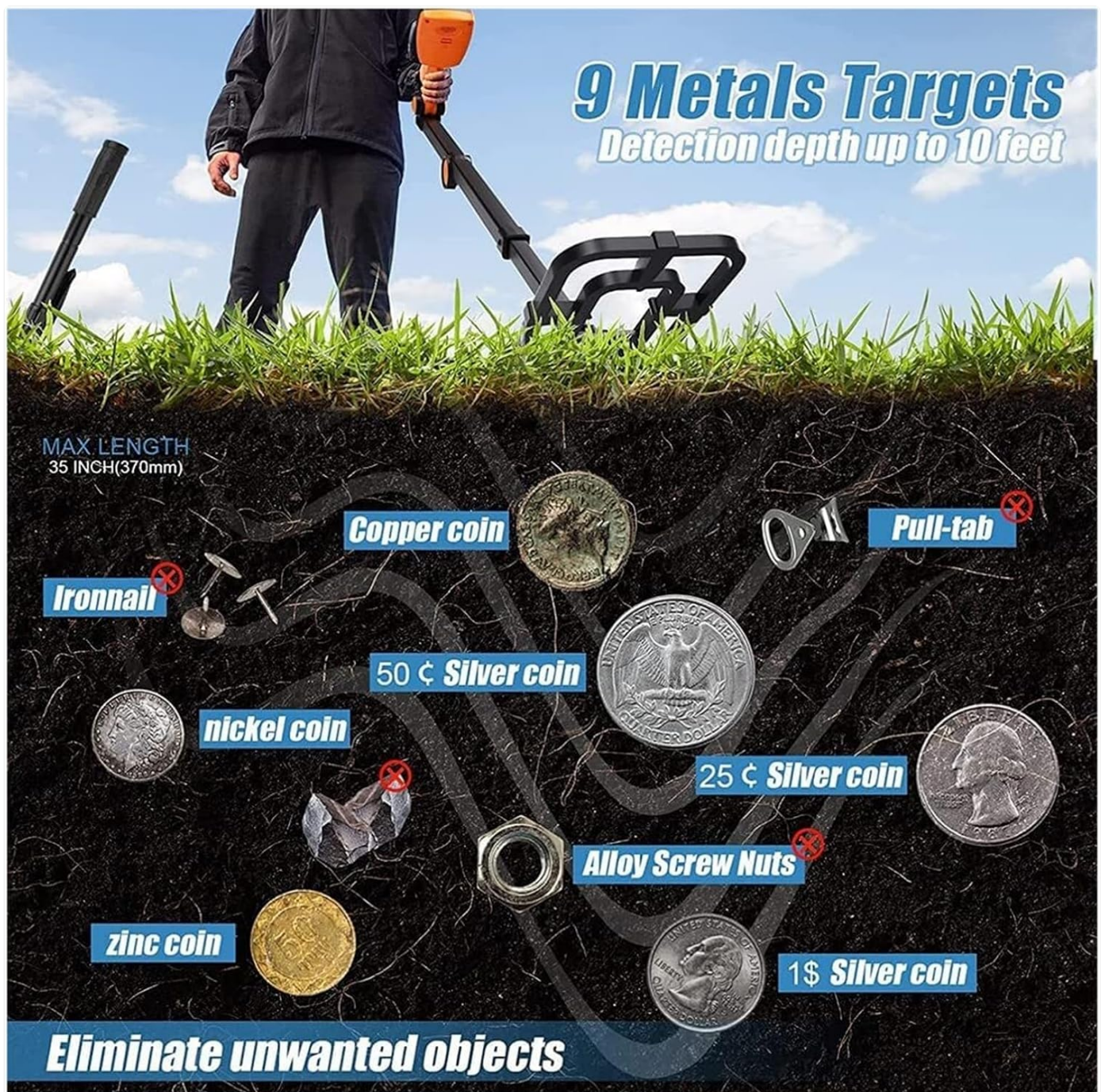
Image: An illustrative diagram showing various metal targets (e.g., iron nail, copper coin, nickel coin, zinc coin, silver coins, pull-tab, alloy screw nuts) buried at different depths, demonstrating the detector's ability to identify and eliminate unwanted objects. Detection depth is up to 10 feet.