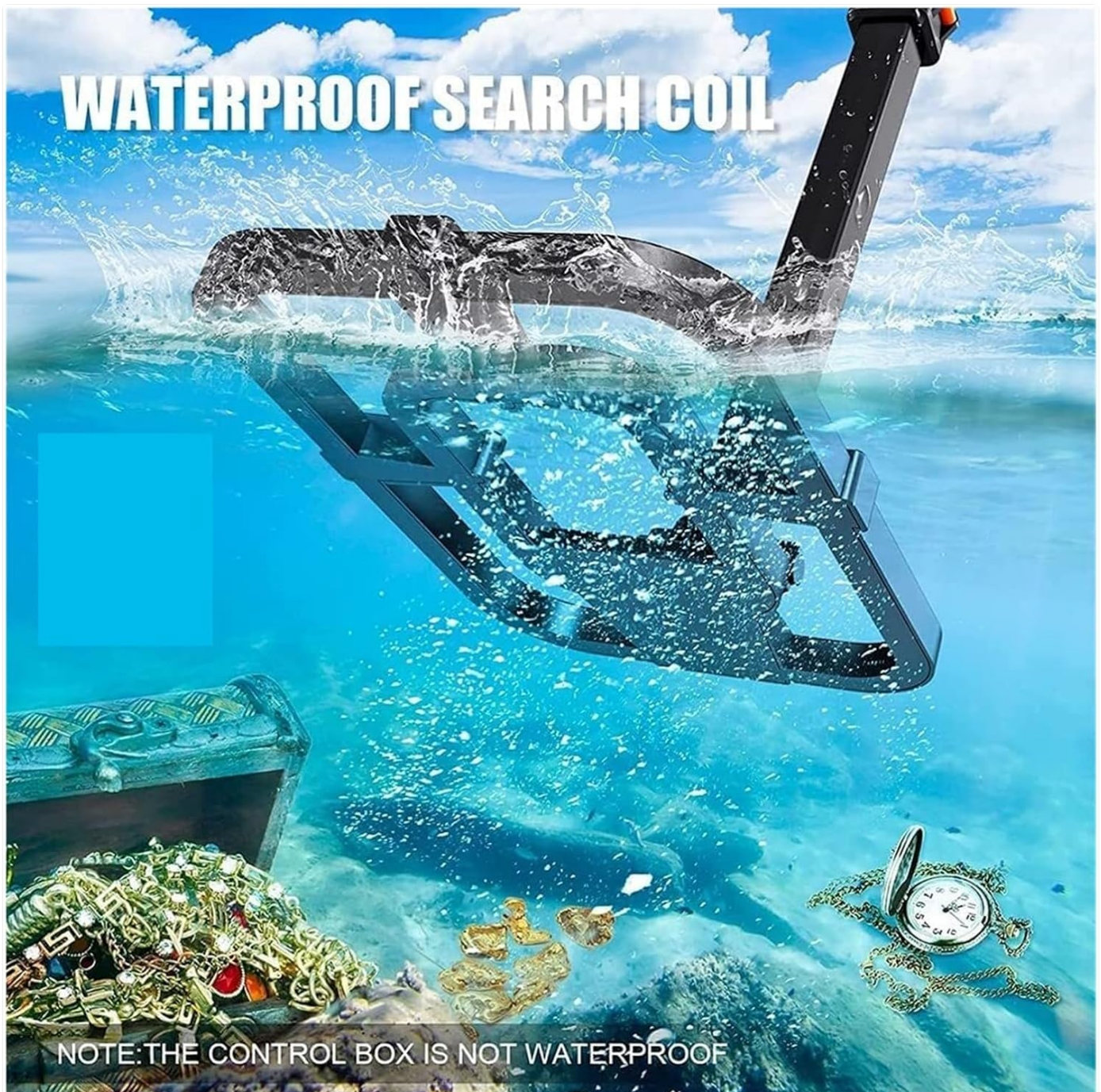
Image: The waterproof search coil of the TX-640H metal detector submerged in water, indicating its capability for underwater detection.

Note: The control box is not waterproof.