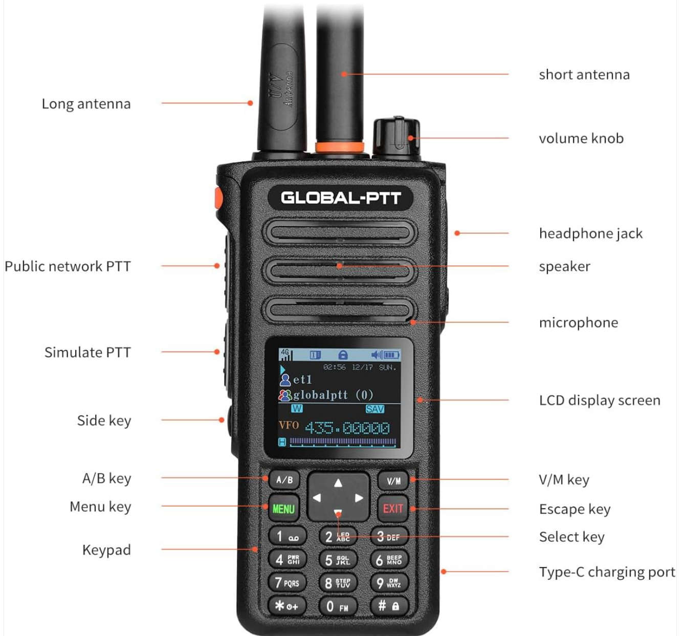
Figure 1: Front view of the global-ptt G8plus radio with labels for its components including long antenna, volume knob, public network PTT, simulate PTT, side key, A/B key, menu key, keypad, headphone jack, speaker, microphone, LCD display screen, V/M key, escape key, select key, and Type-C charging port.