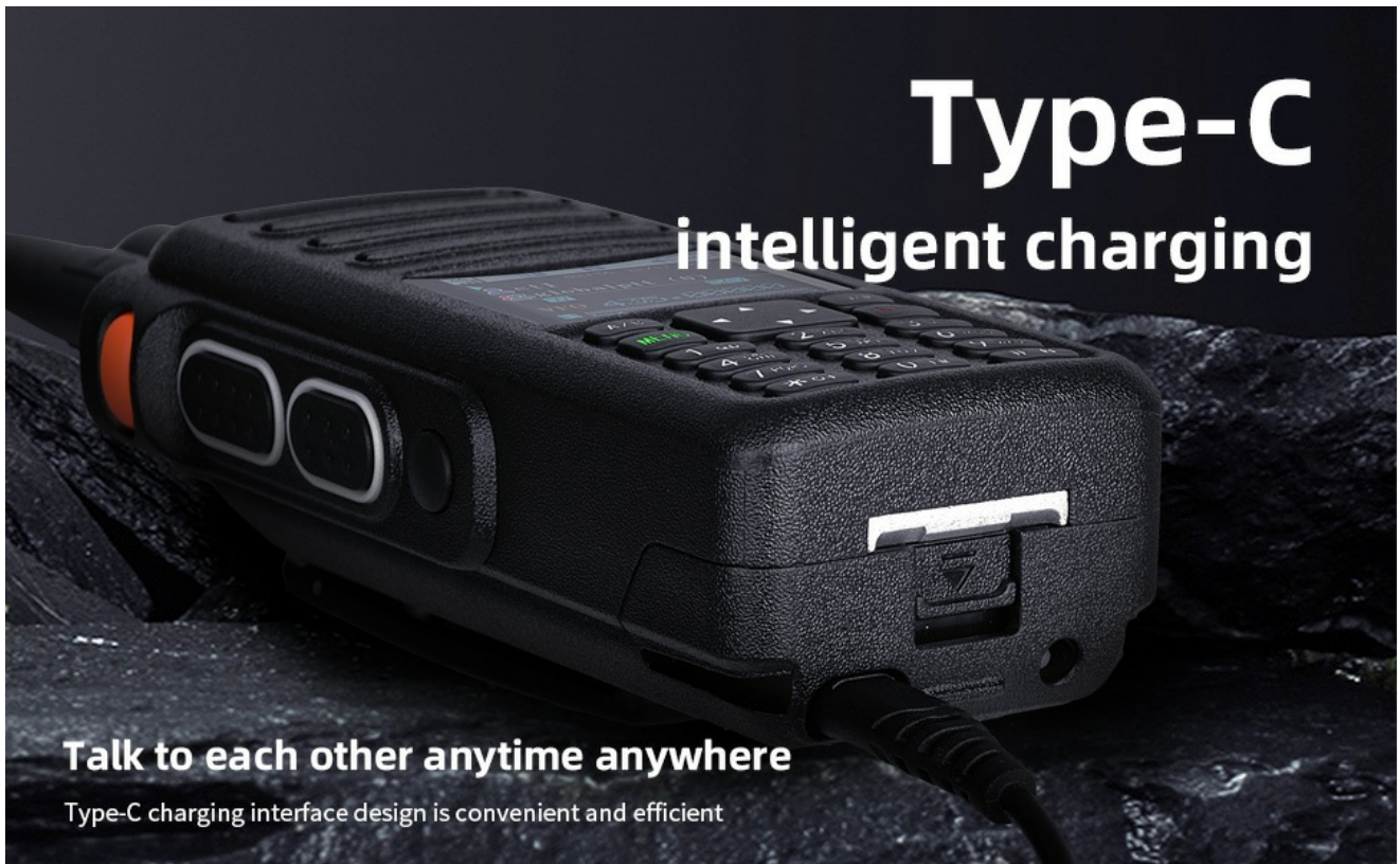
Figure 2: The Type-C charging port on the global-ptt G8plus radio, highlighting its convenient and efficient design.