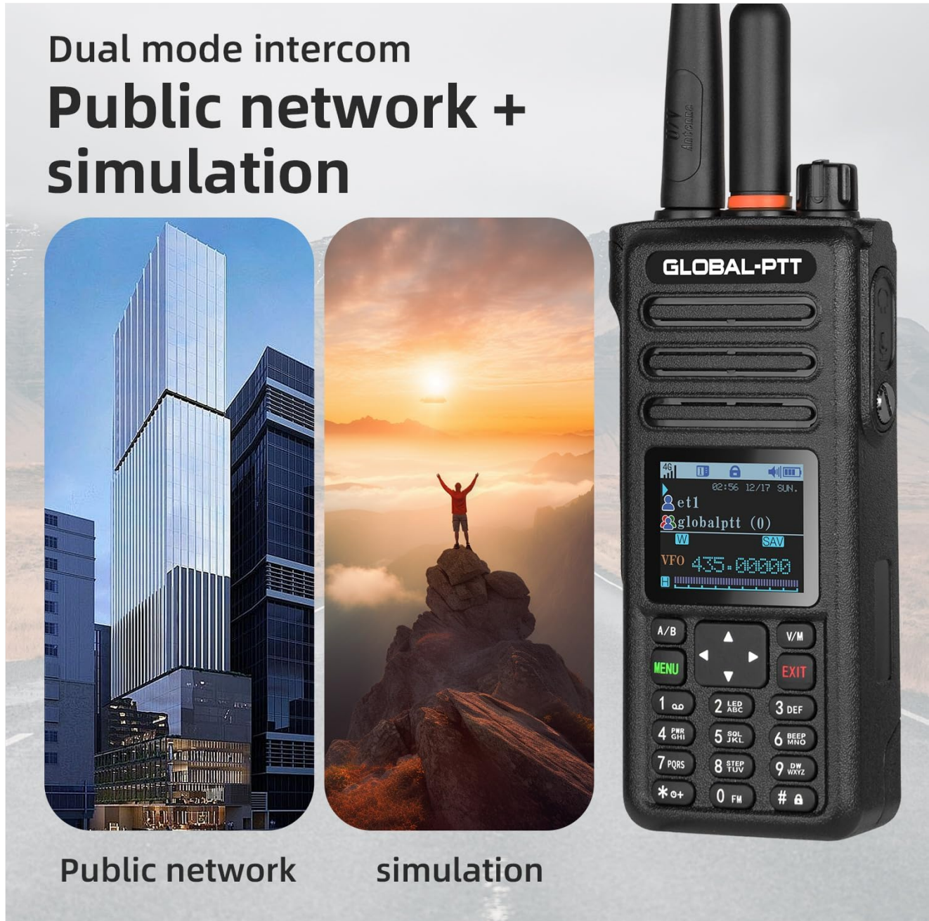
Figure 4: The dual mode intercom capability of the G8plus, allowing communication via public cellular networks (PoC) and traditional analog radio.

The G8plus supports both PoC (Push-to-Talk over Cellular) and UHF Analog modes. Use the designated buttons (e.g., 'A/B' key or a menu option) to switch between these modes. The display will indicate the currently active mode.