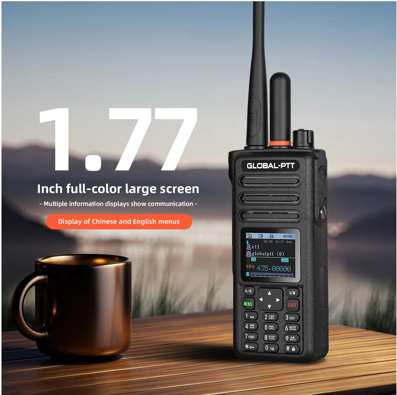
Figure 5: The 1.77-inch full-color display of the G8plus, providing multiple information displays for clear communication.

The 1.77-inch full-color display shows essential information such as current channel/frequency, signal strength, battery level, and active mode. Refer to the display for operational status.