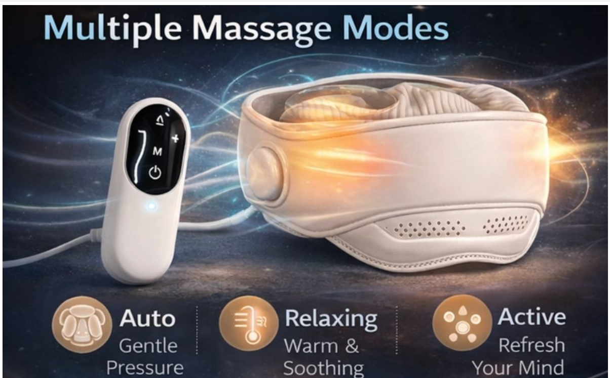
Figure 4: Illustration of 6D deep kneading pressure points.