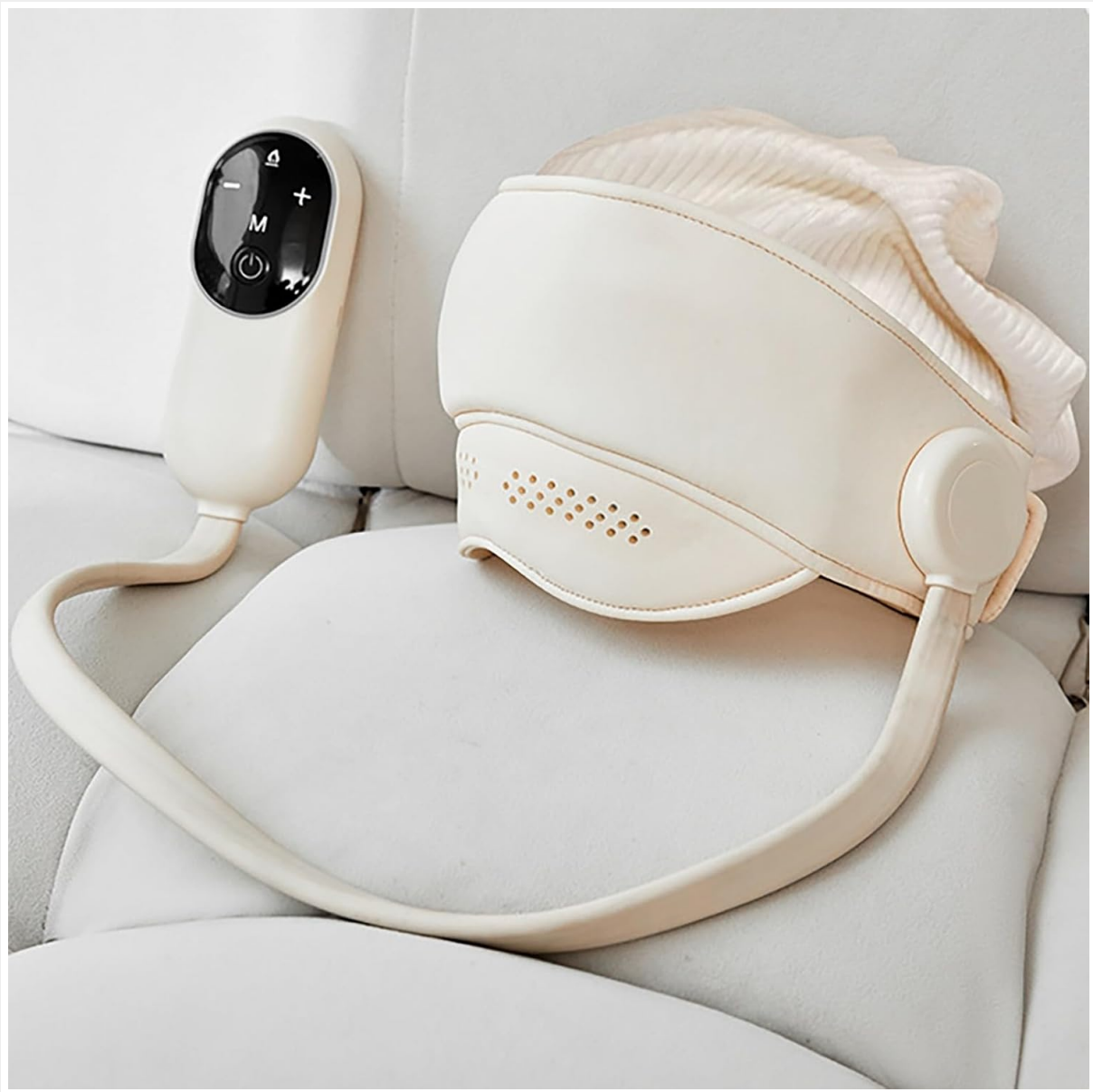
Figure 2: The head massager cap and its controller, highlighting the charging port.