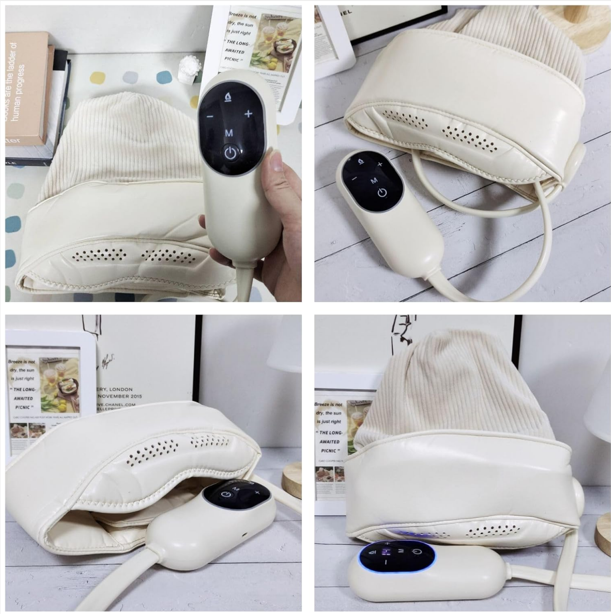
Figure 7: Various views of the massager and its controller.

Your browser does not support the video tag.