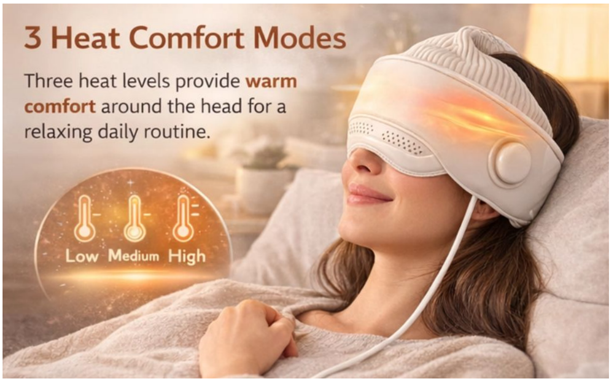
Figure 3: Heat level indicators for the eye area.