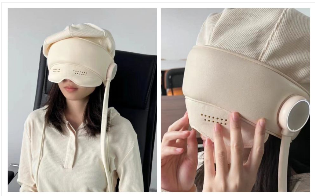
Figure 6: Overview of the Smart Head Relaxation Massager's key features.