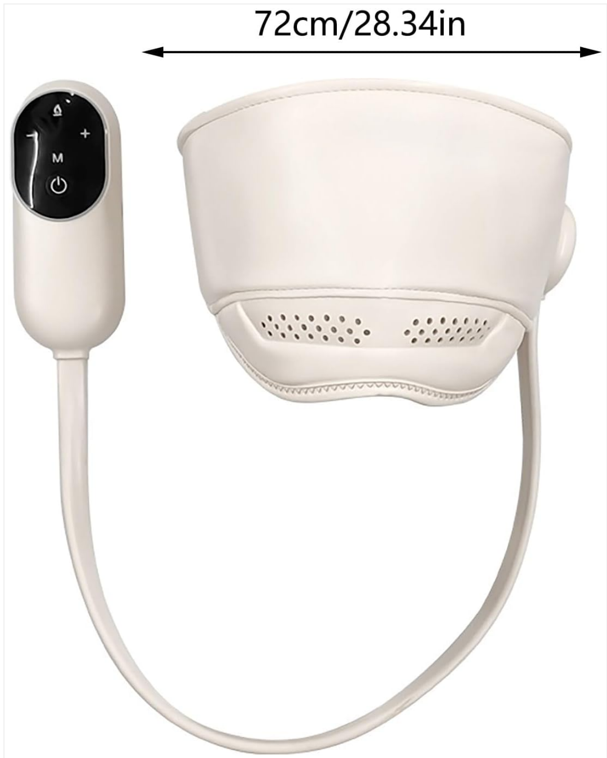
Figure 8: Product dimensions.