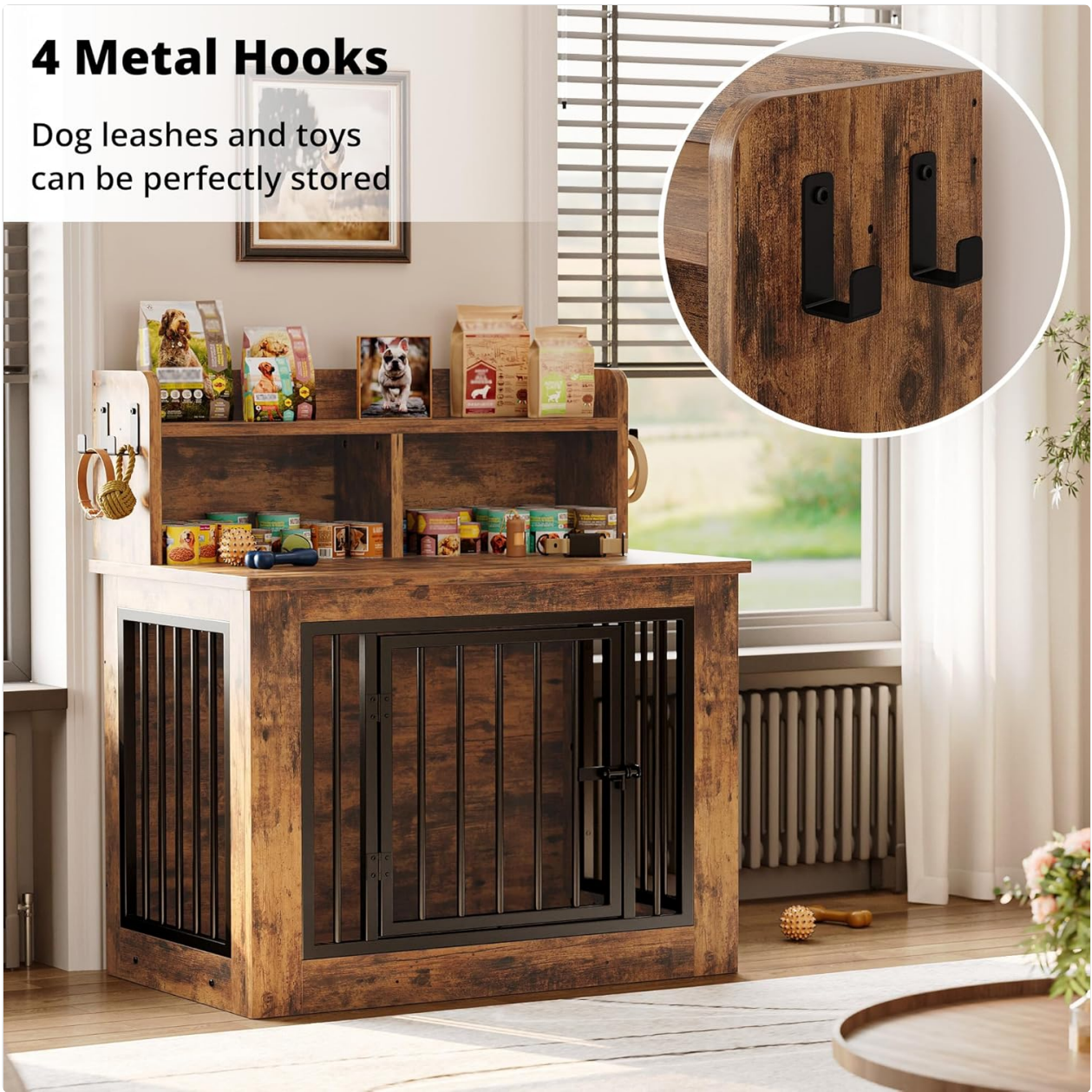
Image 5.1: Detail of the four metal hooks, useful for organizing pet accessories.

Dog leashes and toys can be perfectly stored