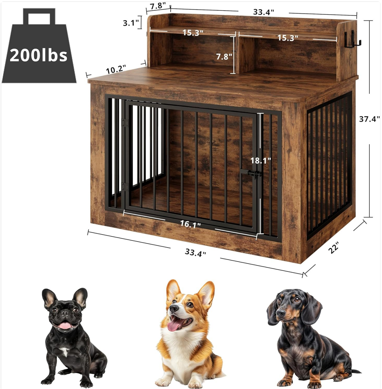
Image 4.1: Dimensional diagram of the dog crate furniture, indicating overall size and internal measurements.