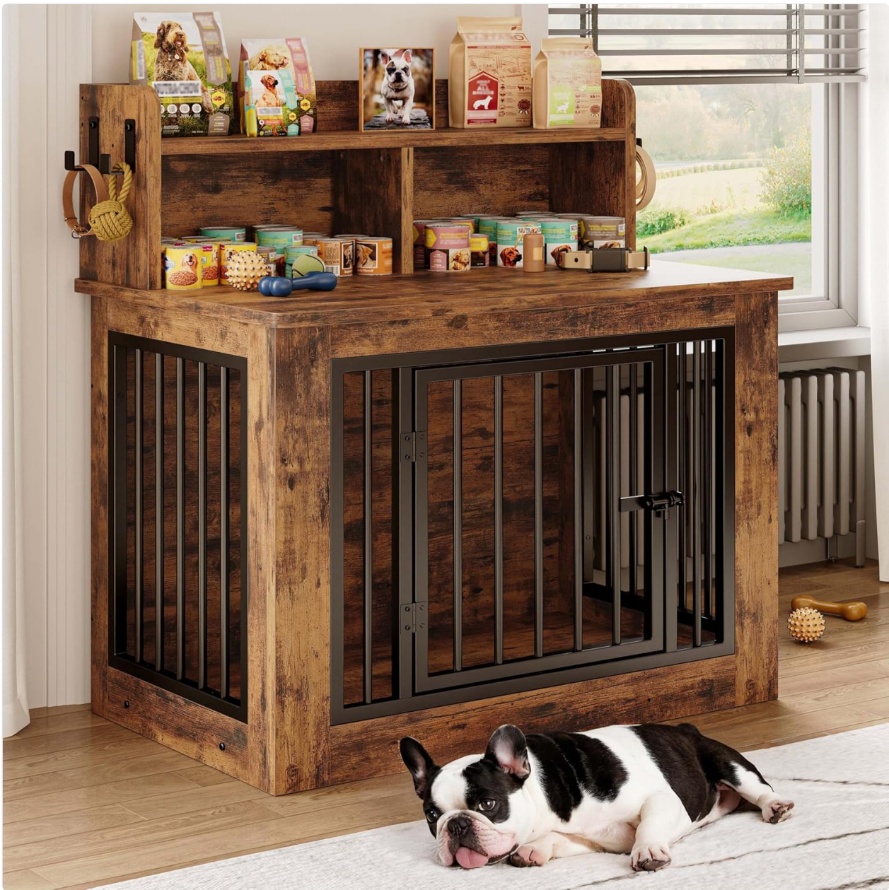
Image 1.1: The IRONCK Dog Crate Furniture, showcasing its dual functionality as a pet enclosure and a piece of home furniture.