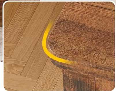
Easy to Clean Heavy-duty secure door latch Rounded corner design