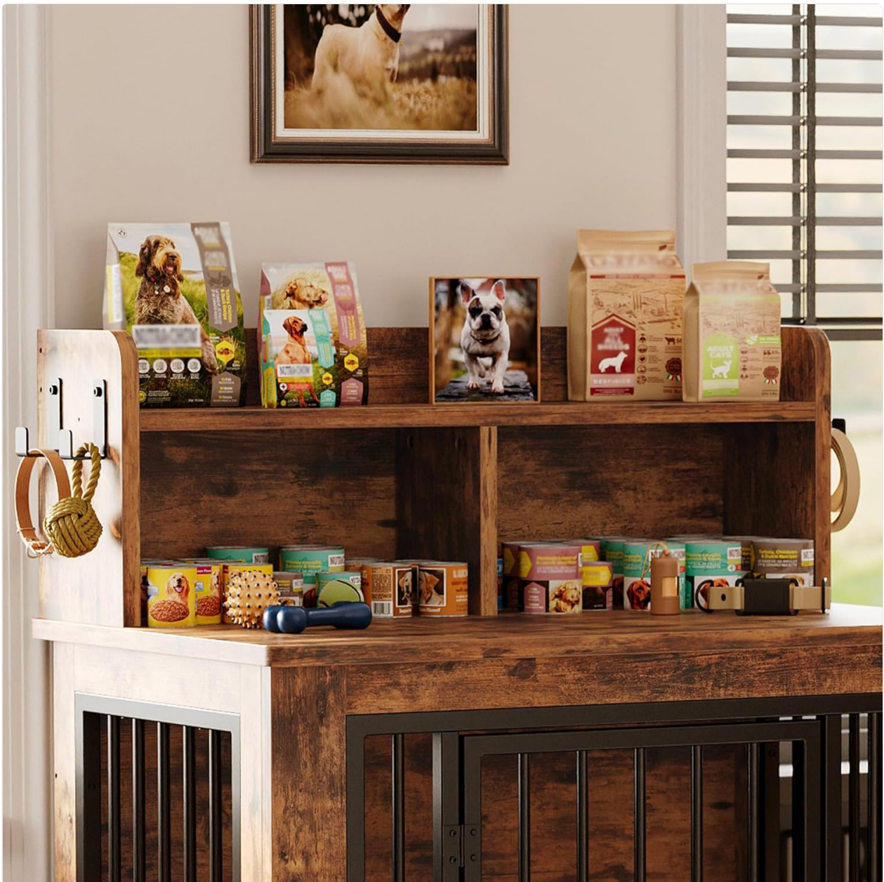
Image 5.2: The open storage shelves, providing convenient space for pet supplies.