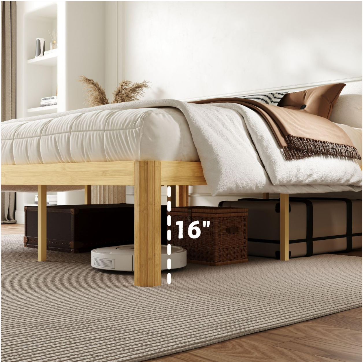
Image 5.1: The 16-inch under-bed clearance provides ample storage space.