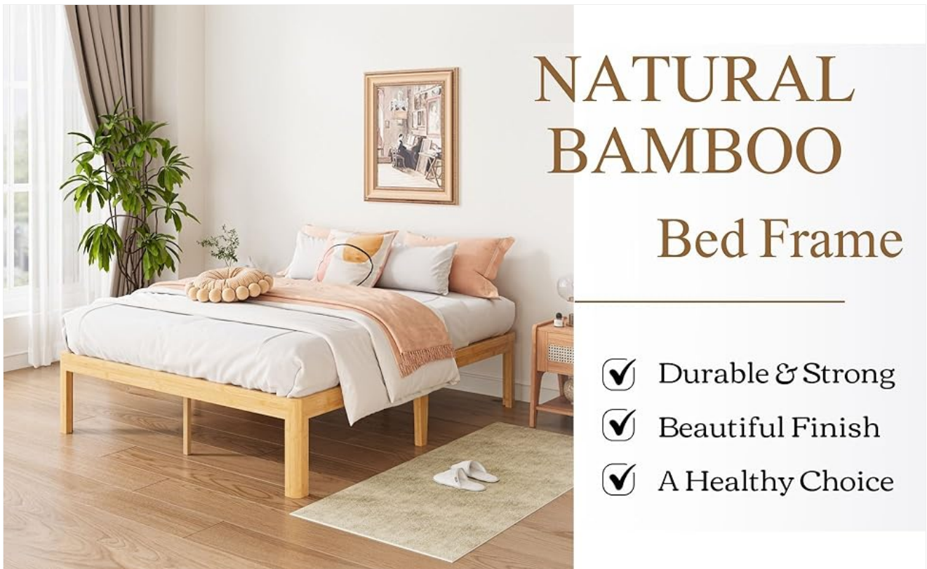
Image 1.1: The ZIYOO Natural Bamboo Bed Frame, showcasing its minimalist design.

Thank you for choosing the ZIYOO Twin 18-Inch Bamboo Platform Bed Frame. This manual provides essential information for the safe assembly, operation, and maintenance of your new bed frame. Please read these instructions carefully before beginning assembly and retain them for future reference.