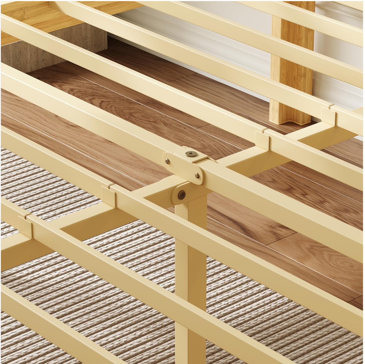
Image 4.2: The sturdy metal support structure integrated into the frame.