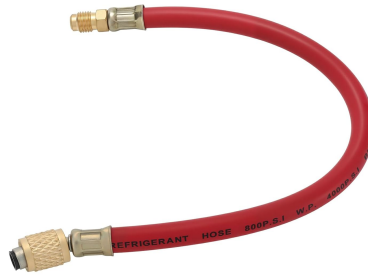
Image 3.2: The 12-inch red service hose, rated for 800 PSI working pressure and 4000 PSI burst pressure, equipped with 1/4" SAE fittings.