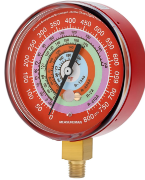
Image 3.1: The 3-1/8" AC Pressure Gauge, showing the dial with refrigerant scales for R410A, R22, R404A, and R134a, and the 0-800 PSI range.