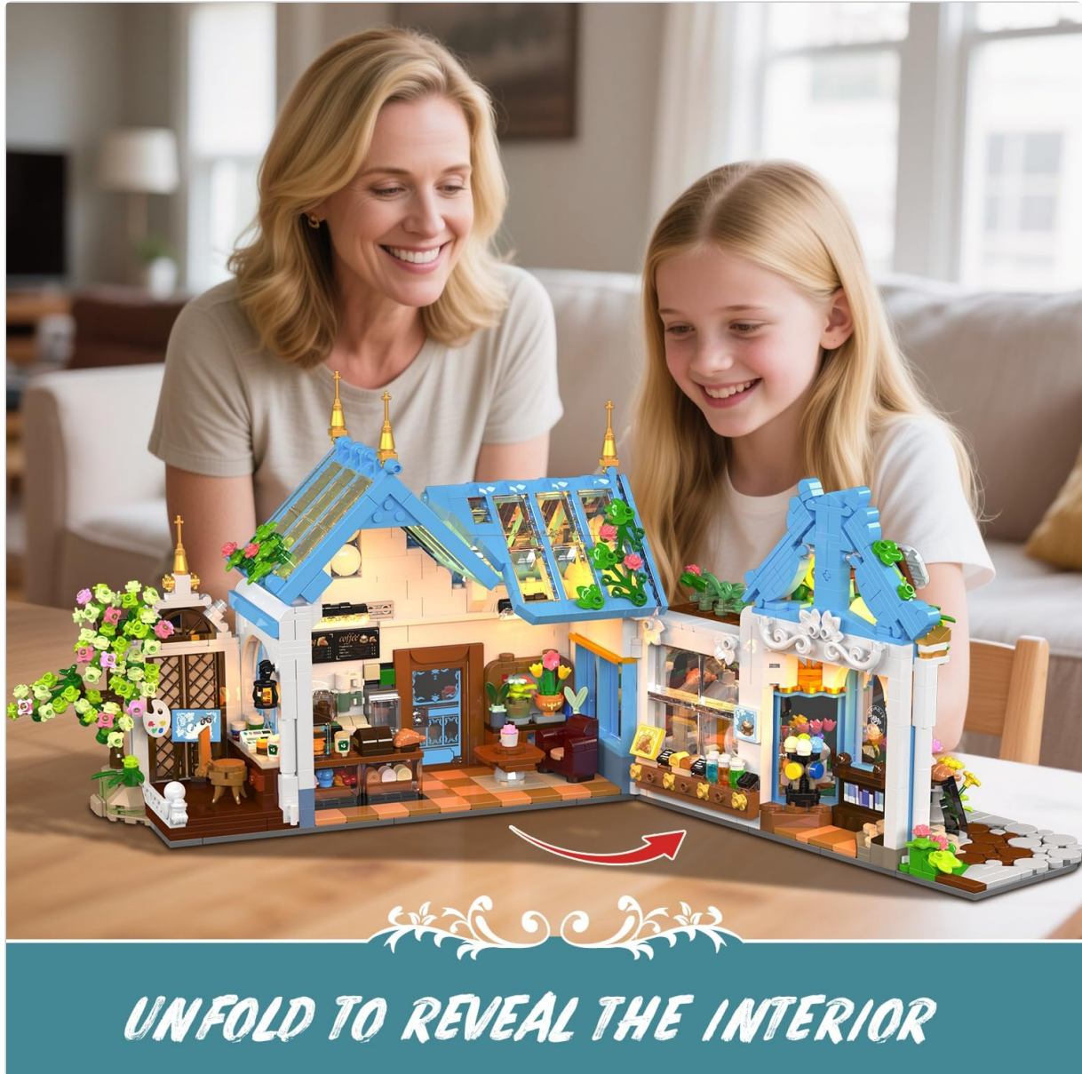
Figure 4.1: The Flower Café House features a split-open design, allowing for a wide display of its interior details. The image shows a mother and daughter interacting with the assembled model, demonstrating its open configuration.

Begin by assembling the base plates and initial structural elements as shown in the manual. Pay close attention to the orientation of the pieces.