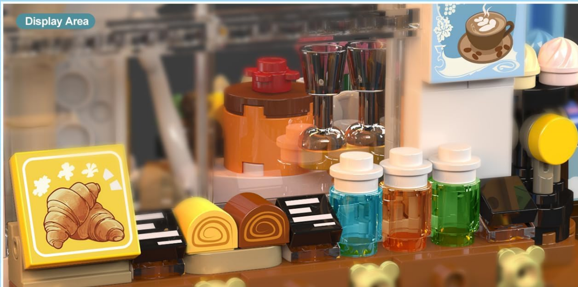
Figure 4.3: Interior details of the café, including a coffee and baking counter with miniature croissants and pastries, a cozy dining area with a small table and armchair, and a display area with various items.