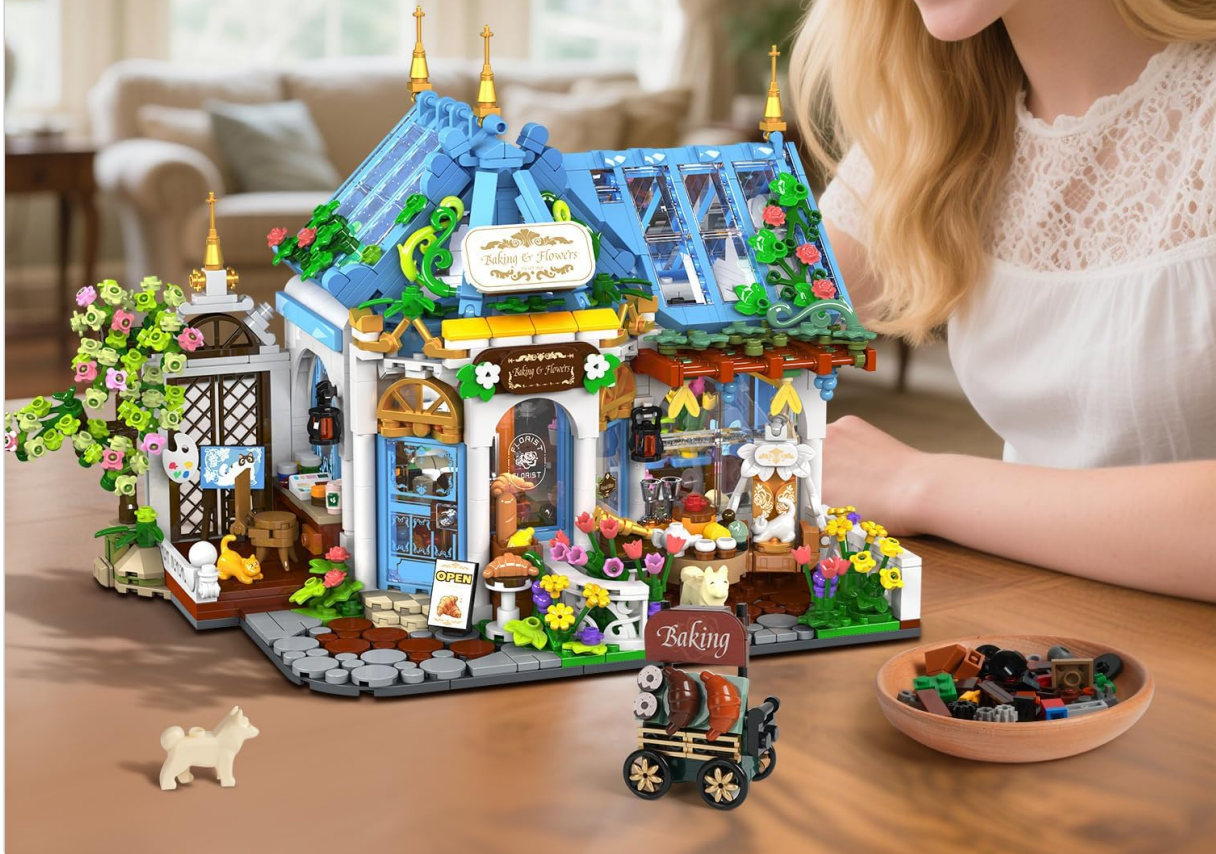
Figure 4.5: The fully assembled Flower Café House, showcasing its complete design with all 1520 pieces. The model is presented as a decorative item, suitable for display.

Video 4.1: An official product video demonstrating the features and details of the Flower Café House Building Set with LED. This video provides a dynamic overview of the assembled model and its various components.