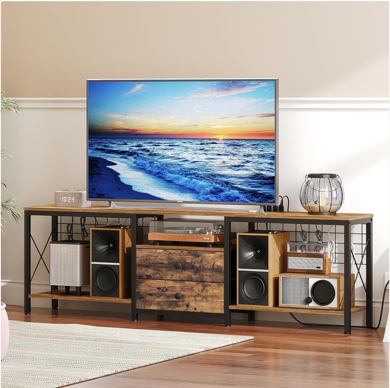
Image: The YATINEY DS18UBRY1 TV Stand, fully assembled and in use, showcasing its capacity for a television and various media devices.