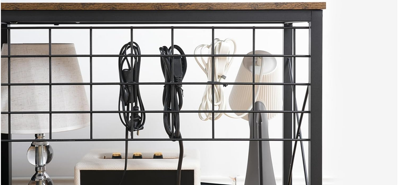
Image: A close-up demonstrating how cables can be neatly organized and secured using the wire mesh panels on the back of the TV stand, promoting an orderly look.