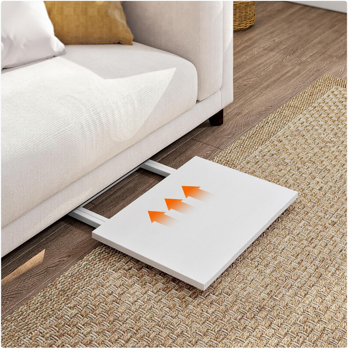
Image: The folding table stored compactly under a sofa, highlighting its easy storage feature.