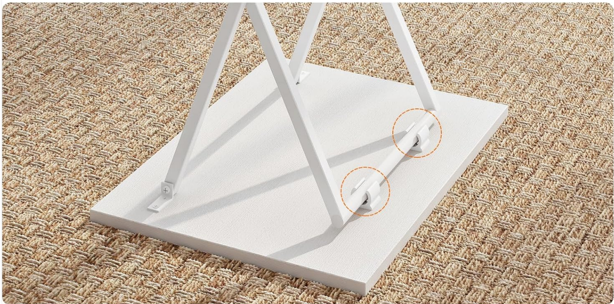
Image: Detailed view of the folding mechanism, highlighting the points where the legs lock into place when unfolded.