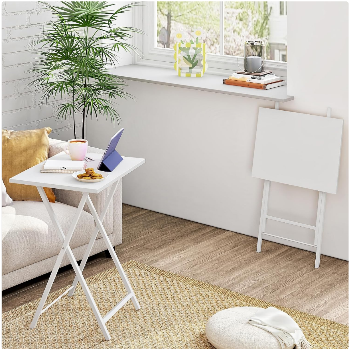
Image: One table in use next to a sofa, while another is folded and stored vertically, showcasing versatility.