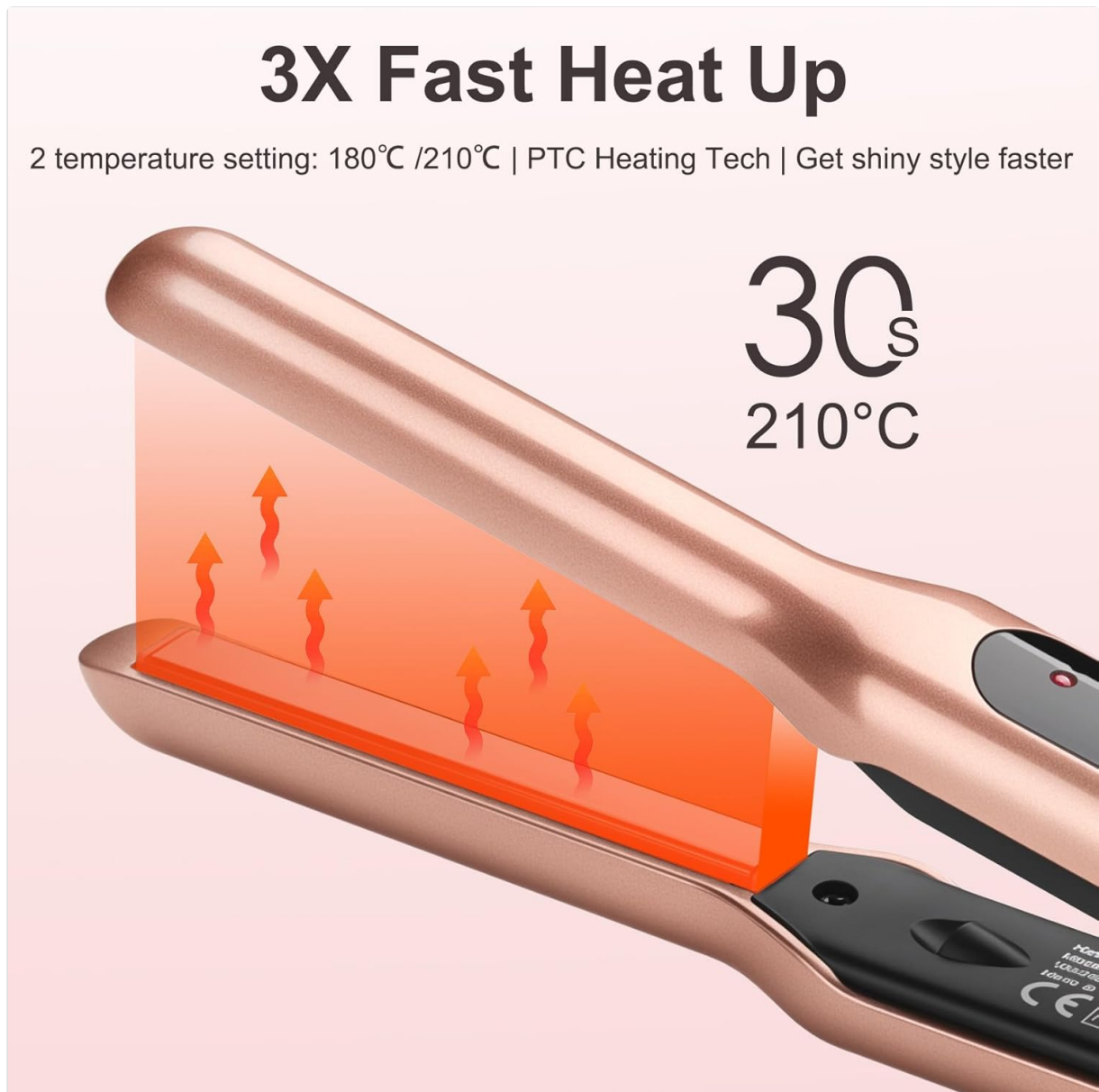
Figure 5.1: The flat iron features fast heat-up technology, reaching optimal temperature in about 30 seconds.

Select the desired temperature by sliding the temperature switch. The flat iron heats up quickly, reaching the selected temperature in approximately 30 seconds.