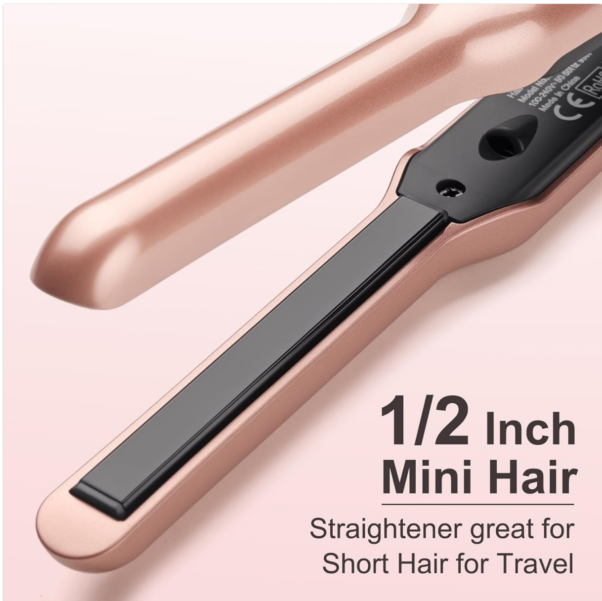
Figure 5.4: The lock feature keeps the plates closed for compact storage and travel.