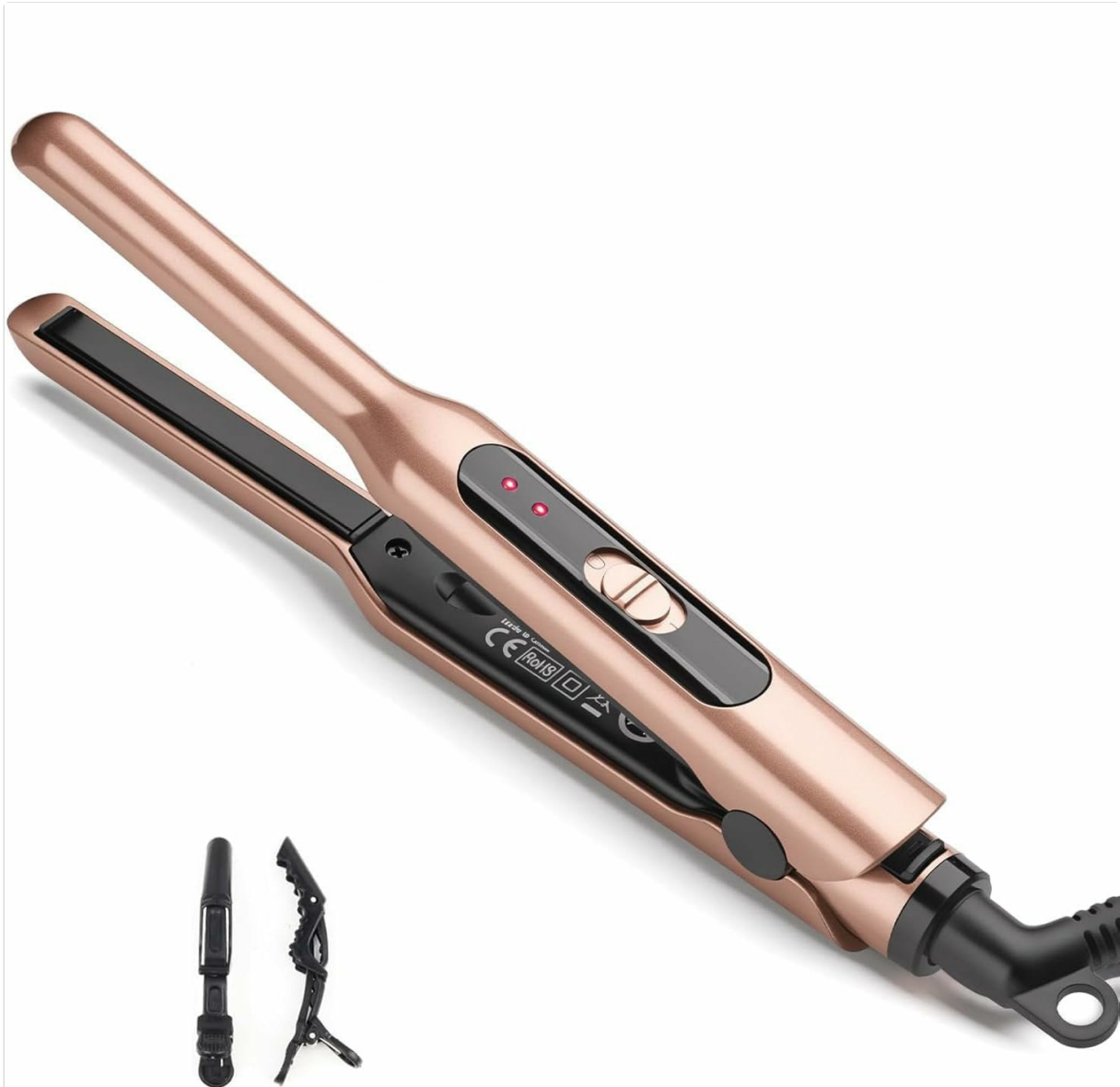
Figure 2.1: The JAETON 0.3 Inch Mini Flat Iron, a compact and versatile styling tool.