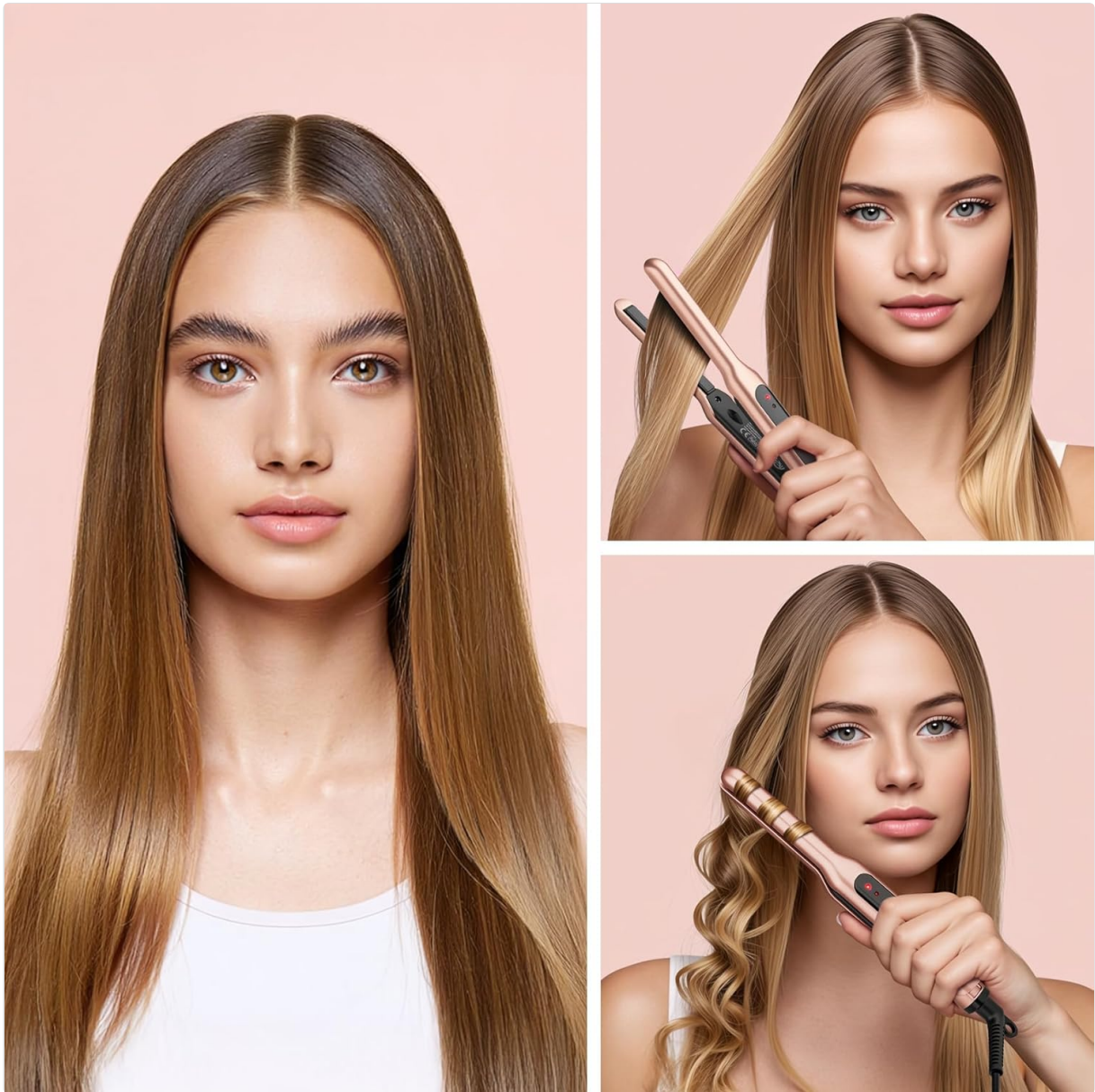
Figure 5.2: Demonstrating the use of the mini flat iron for straightening hair sections.