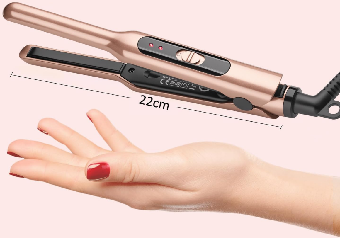
Figure 3.1: The JAETON Mini Flat Iron shown with typical accessories like hair clips.