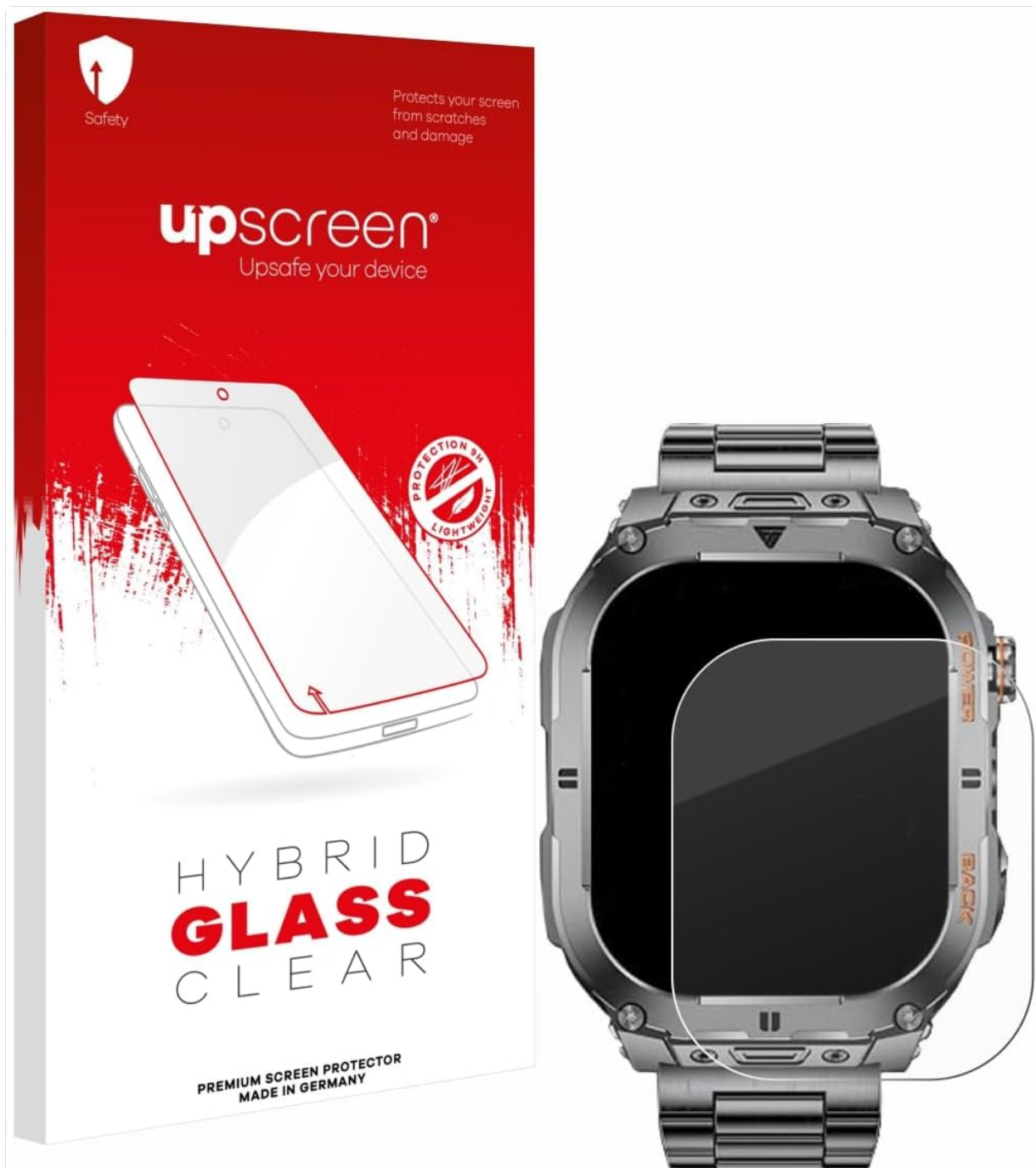
Image 1.1: upscreens Hybrid Glass Clear Premium Screen Protector packaging alongside the protector applied to an Esfoe ZC-EF9-A device.

Key features of this screen protector include: