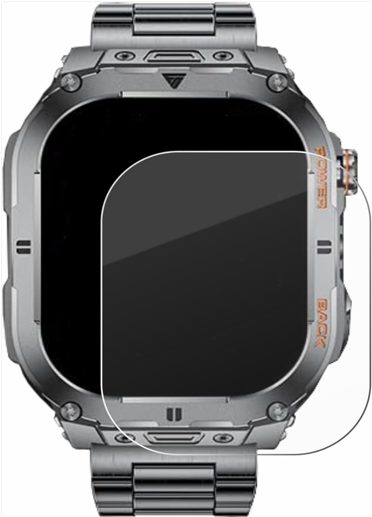
Image 3.1: Proper alignment of the screen protector on the device.