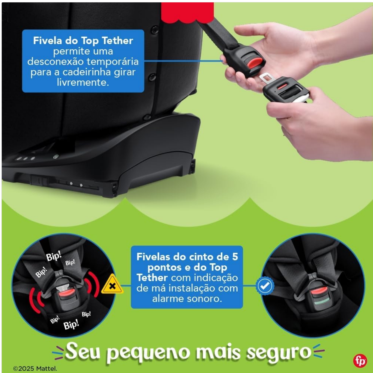
Image 4.2: Close-up of the Top Tether buckle and 5-point harness buckle, showing visual and audible indicators for correct installation.