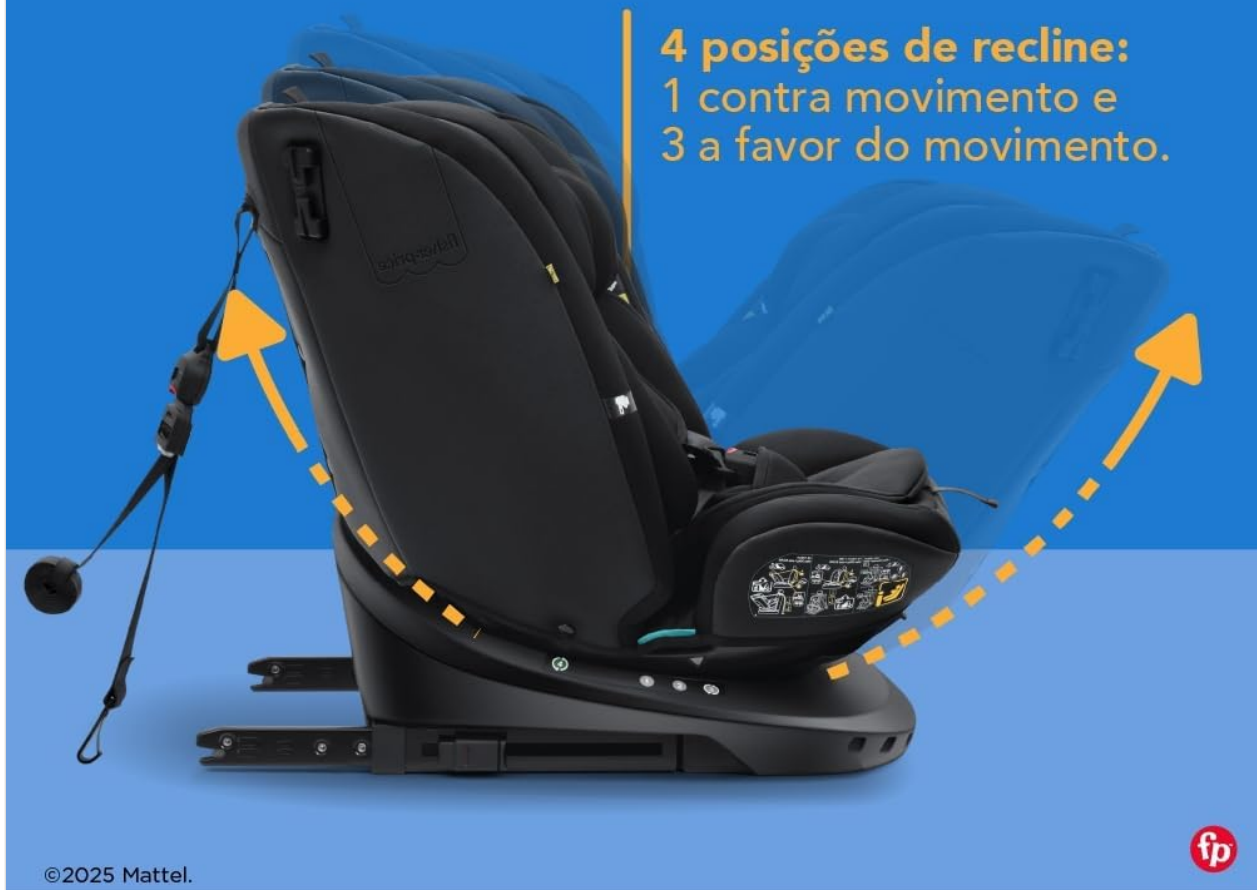
Image 5.2: Visual representation of the 4 available recline positions.