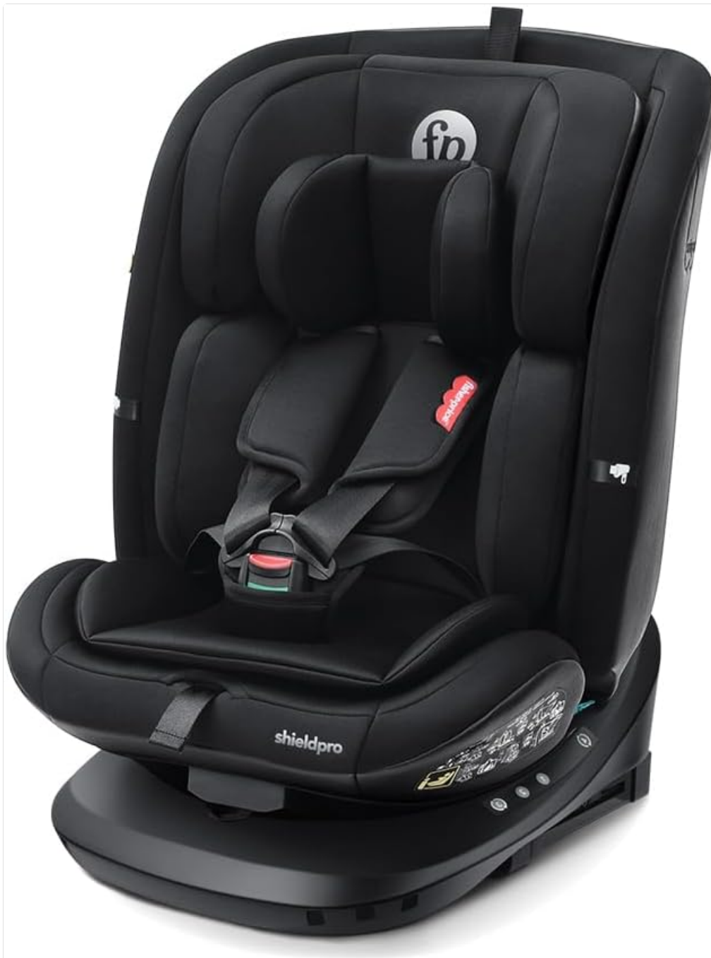
Image 3.1: Front view of the Fisher-Price Shieldpro 360° i-Size Car Seat.