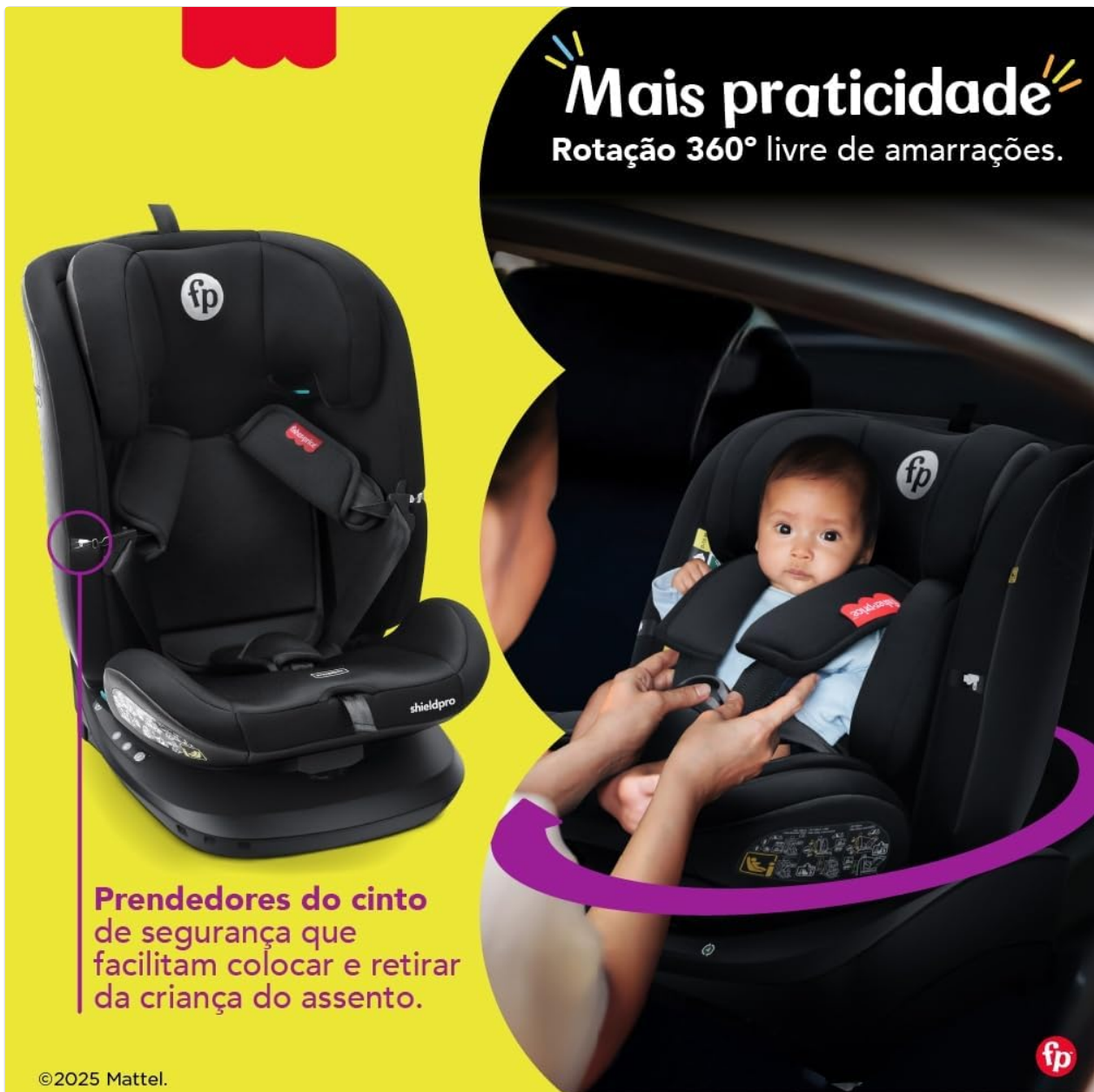
Image 5.1: Illustration of the 360° rotation feature and convenient harness buckle holders.