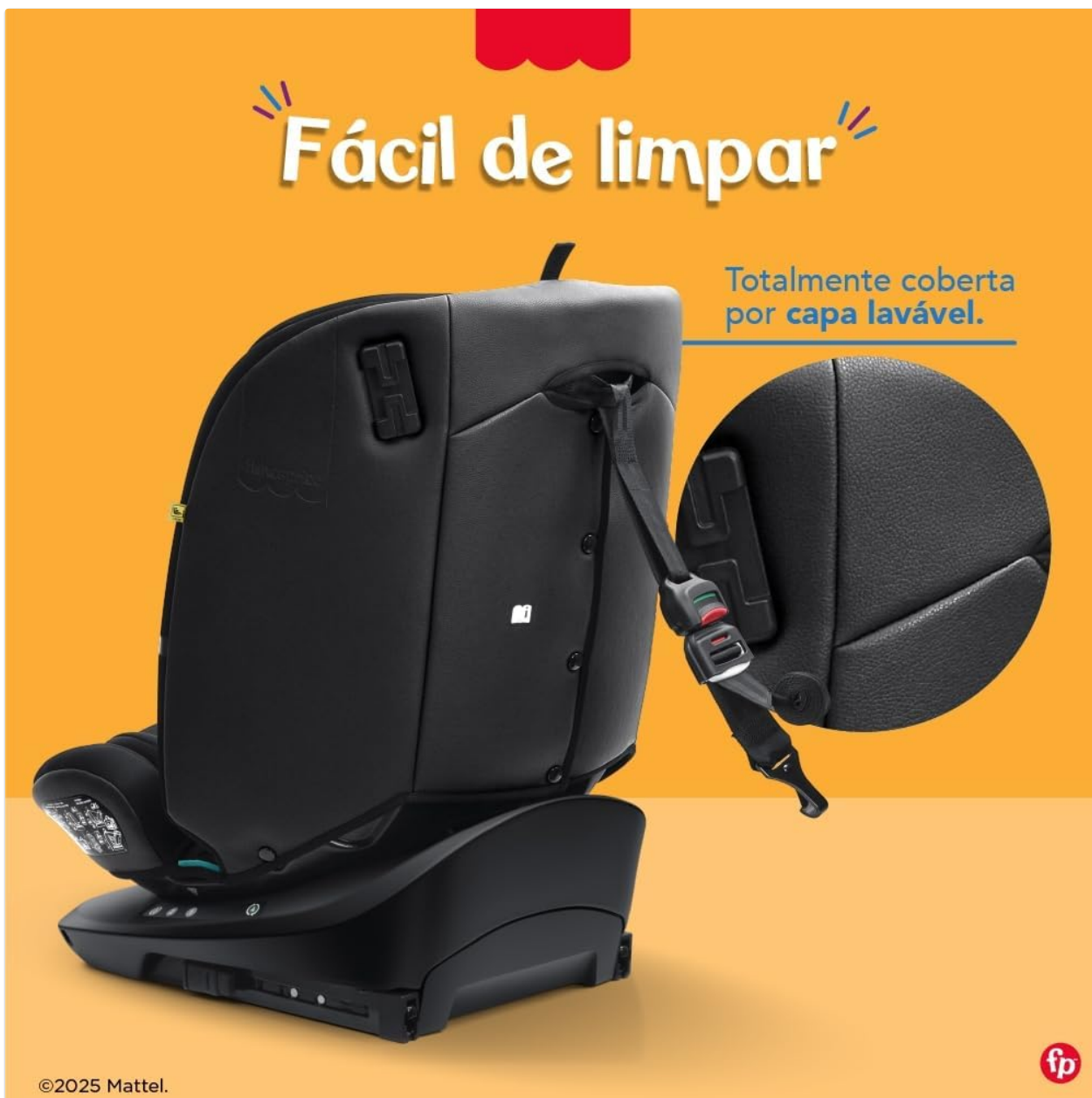
Image 6.1: The car seat with its fully removable and washable cover.