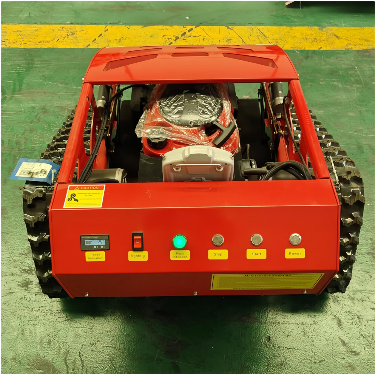
Figure 3: A close-up view of the rear control panel of the ADVOK AD-550, showing the power indicator, lighting switch, fault indication light, stop button, start button, and power switch.

Ensure the mower is on a level surface and clear of obstacles. Press the 'Power' button on the rear control panel, then the 'Start' button. The mower features a one-button start for ease of use.