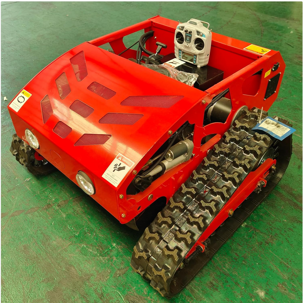
Figure 1: The ADVOK AD-550 Remote Control Crawler Lawn Mower from a top-down perspective, highlighting its red chassis, crawler tracks, and the remote control unit.