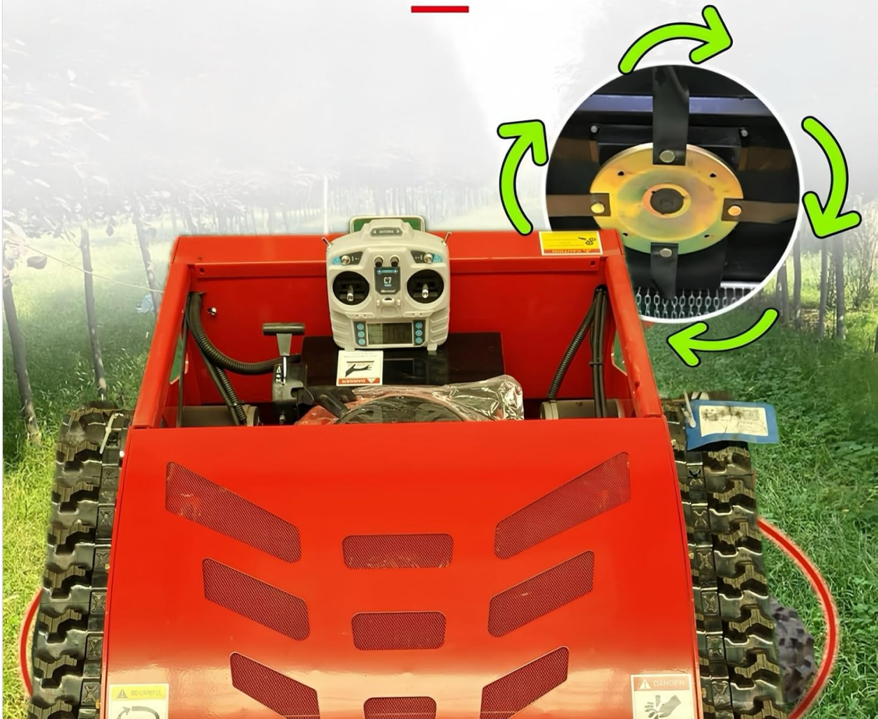
Figure 4: This image highlights the mower's capability for 360-degree rotation in place, illustrating its flexible maneuverability for efficient cutting around obstacles.