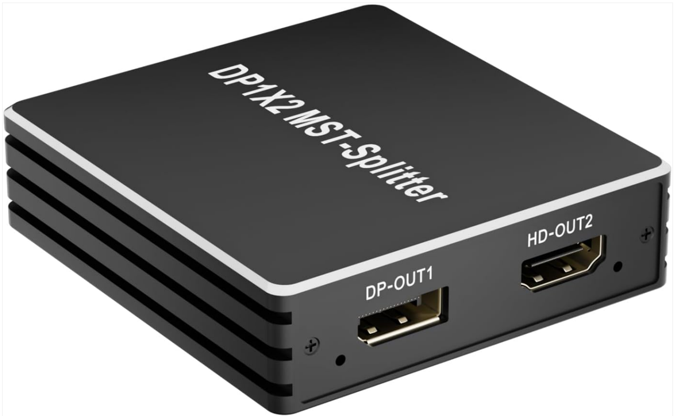
Image: Side view of the splitter showing output ports.