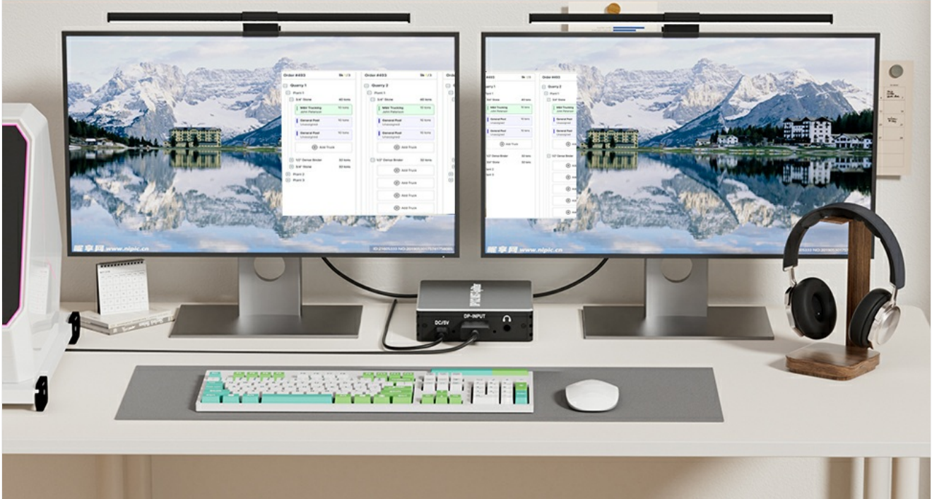
Image: Connection diagram for the DP102-HD splitter.