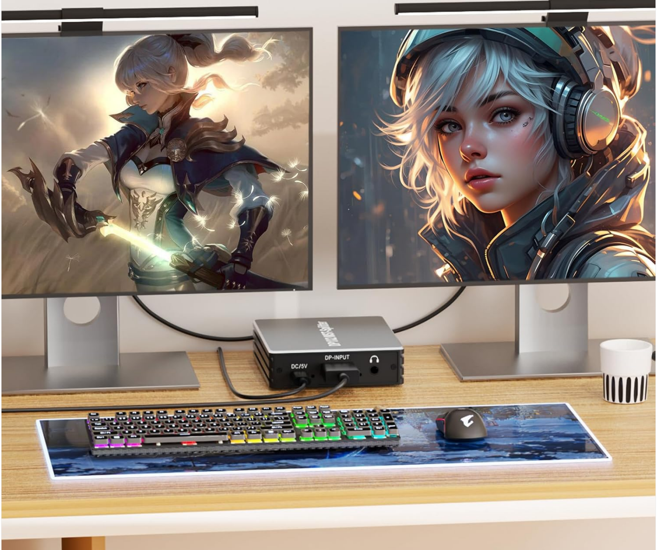
Image: Two monitors displaying different content in Extended Mode.