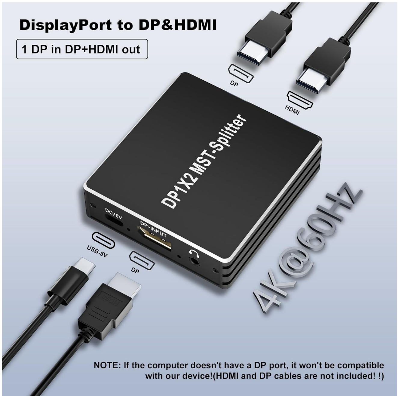
Image: Front view of the splitter with input and output cables connected.