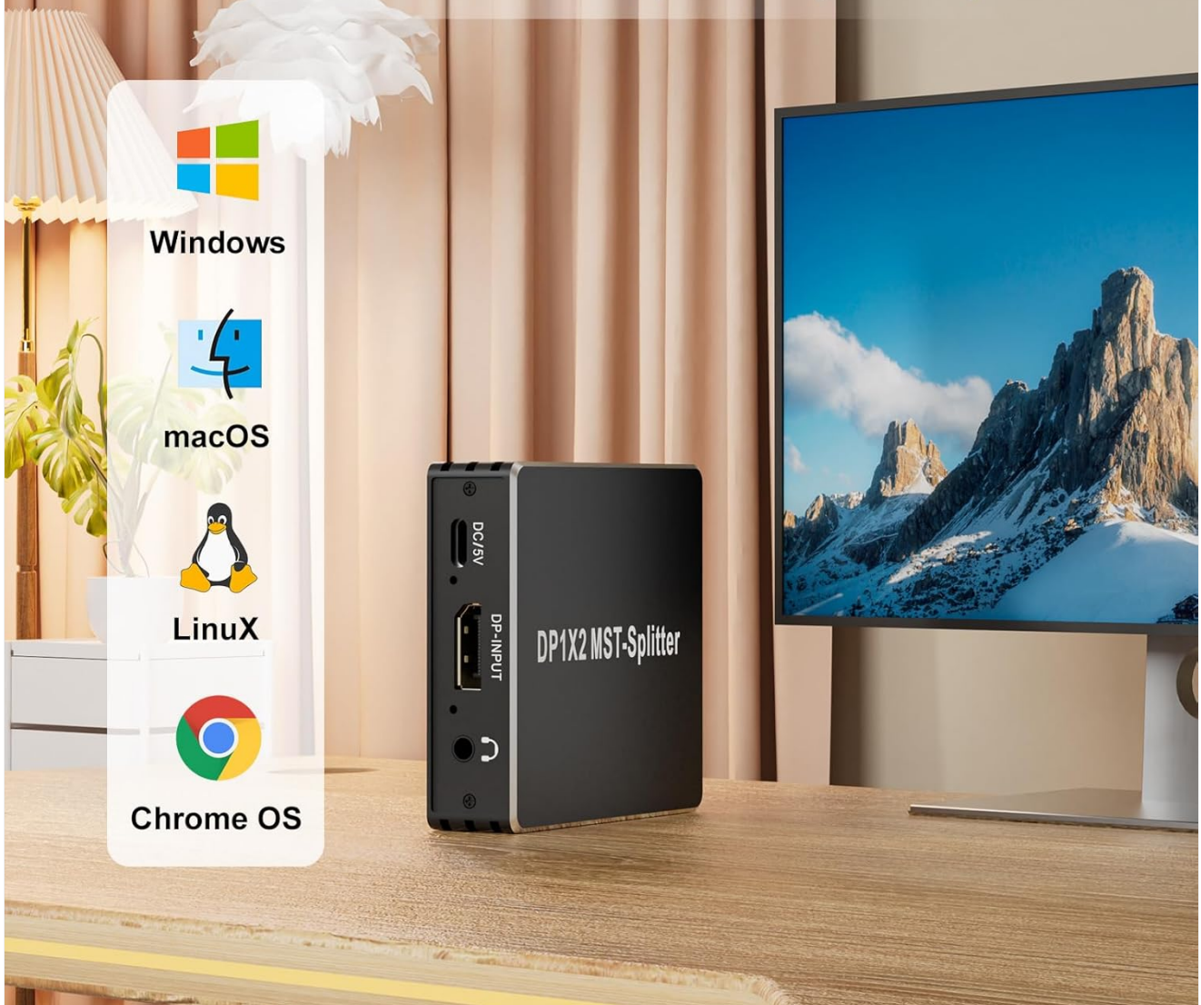
Image: Compatibility with various operating systems.

No drivers or installation required. Plug and Play