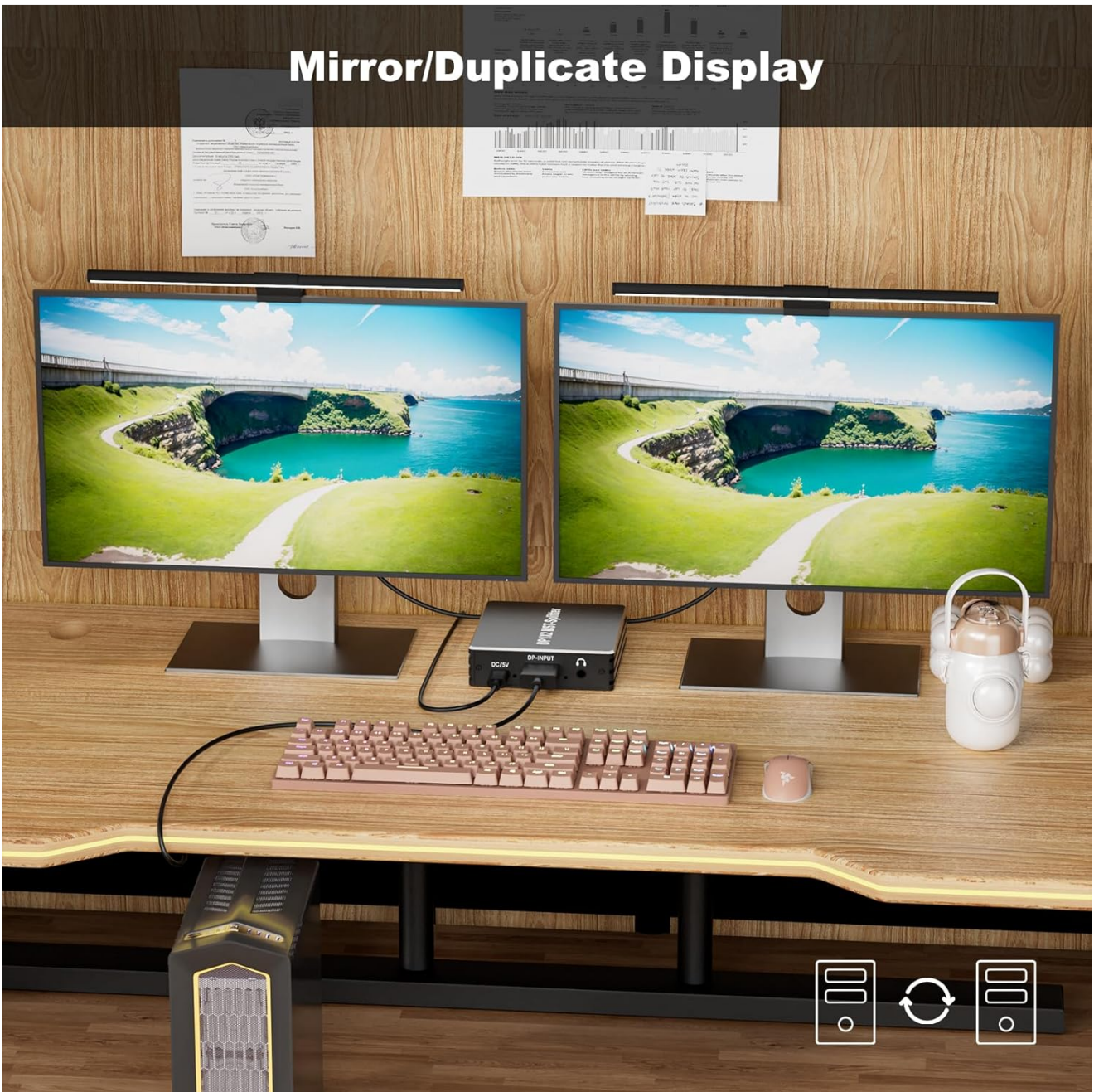
Image: Two monitors displaying identical content in Mirror Mode.