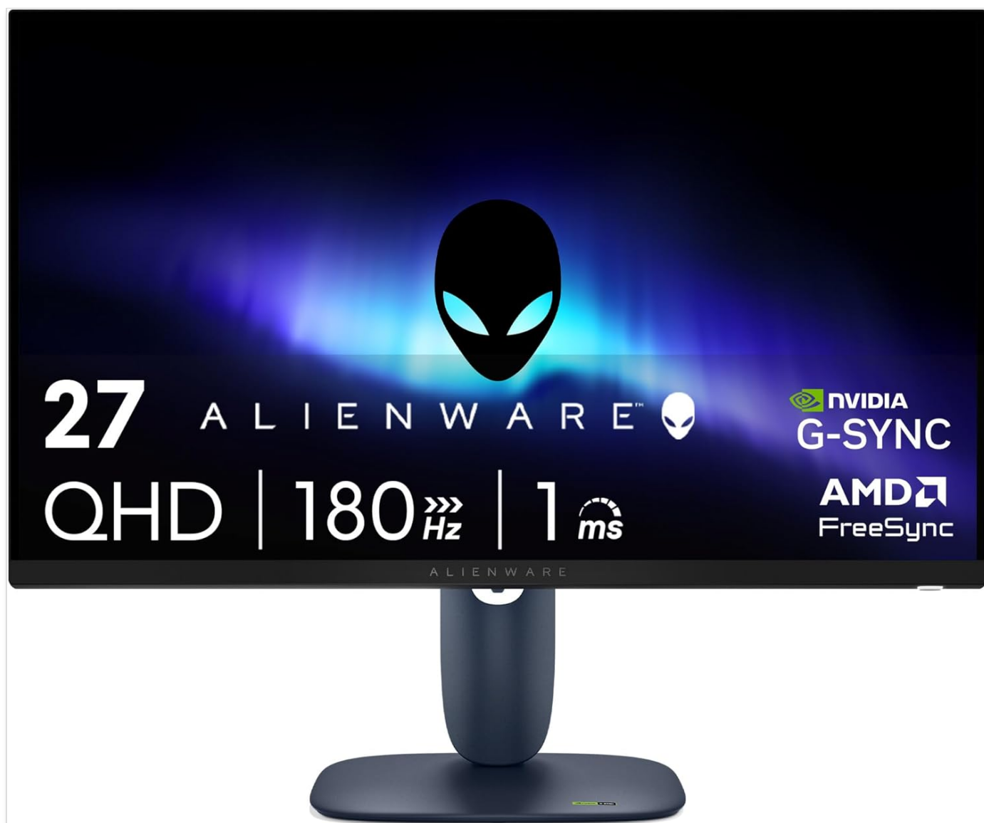
Figure 1.1: Front view of the Alienware 27 Gaming Monitor AW2725DM.

Welcome to the user manual for your new Alienware 27 Gaming Monitor AW2725DM. This 27-inch QHD gaming monitor features a Fast IPS panel, vivid color, and smooth visuals, designed to bring your favorite games to life. This manual provides essential information for setting up, operating, maintaining, and troubleshooting your monitor.