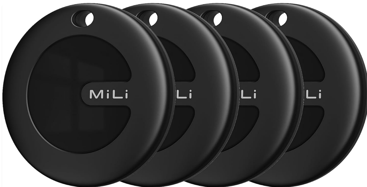
Image: Four MiLi MiTag Duo trackers, showcasing the product design.

The MiLi MiTag Duo is a versatile Bluetooth tracker designed to help you locate your belongings. It offers compatibility with both Apple's Find My network and Google's Find Hub network, providing flexible tracking options for iOS and Android users. This manual provides essential information for setting up, operating, maintaining, and troubleshooting your MiTag Duo.