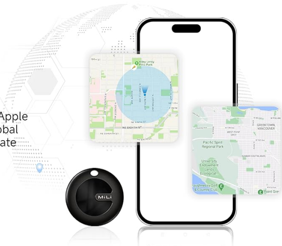
Image: The 'Share Your Device' feature, showing how to share the MiTag Duo's location with others.

Some extra help from a global network. Apple Find My and Google's Find Hub use a global network of iOS or Android devices to locate your belongings almost anywhere.