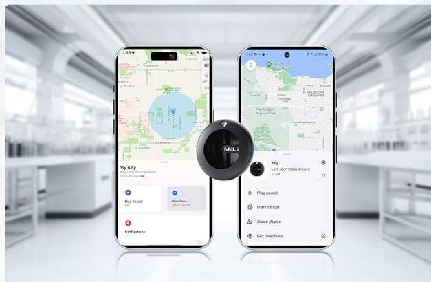
Image: Illustration of the one-click operation for easy setup and connection of the MiTag Duo.