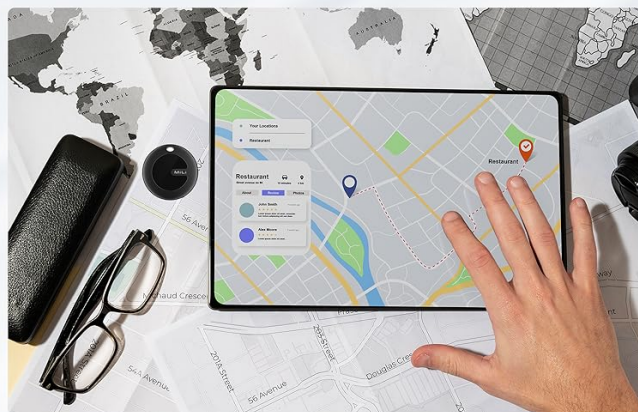
Image: Worldwide locating feature, showing a map on a tablet with a MiTag Duo.