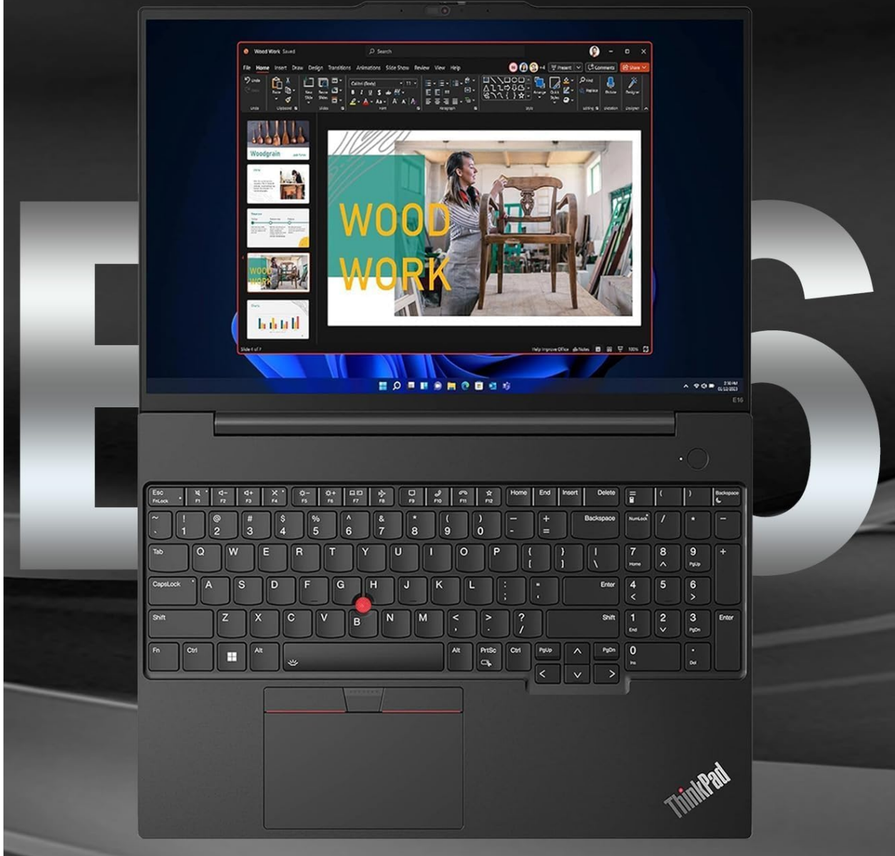
Image: Visual details of the Lenovo ThinkPad E16 G2 display, showing 16:10 aspect ratio, 1920x1200 resolution, 91% screen-to-body ratio, IPS technology, and anti-glare properties.