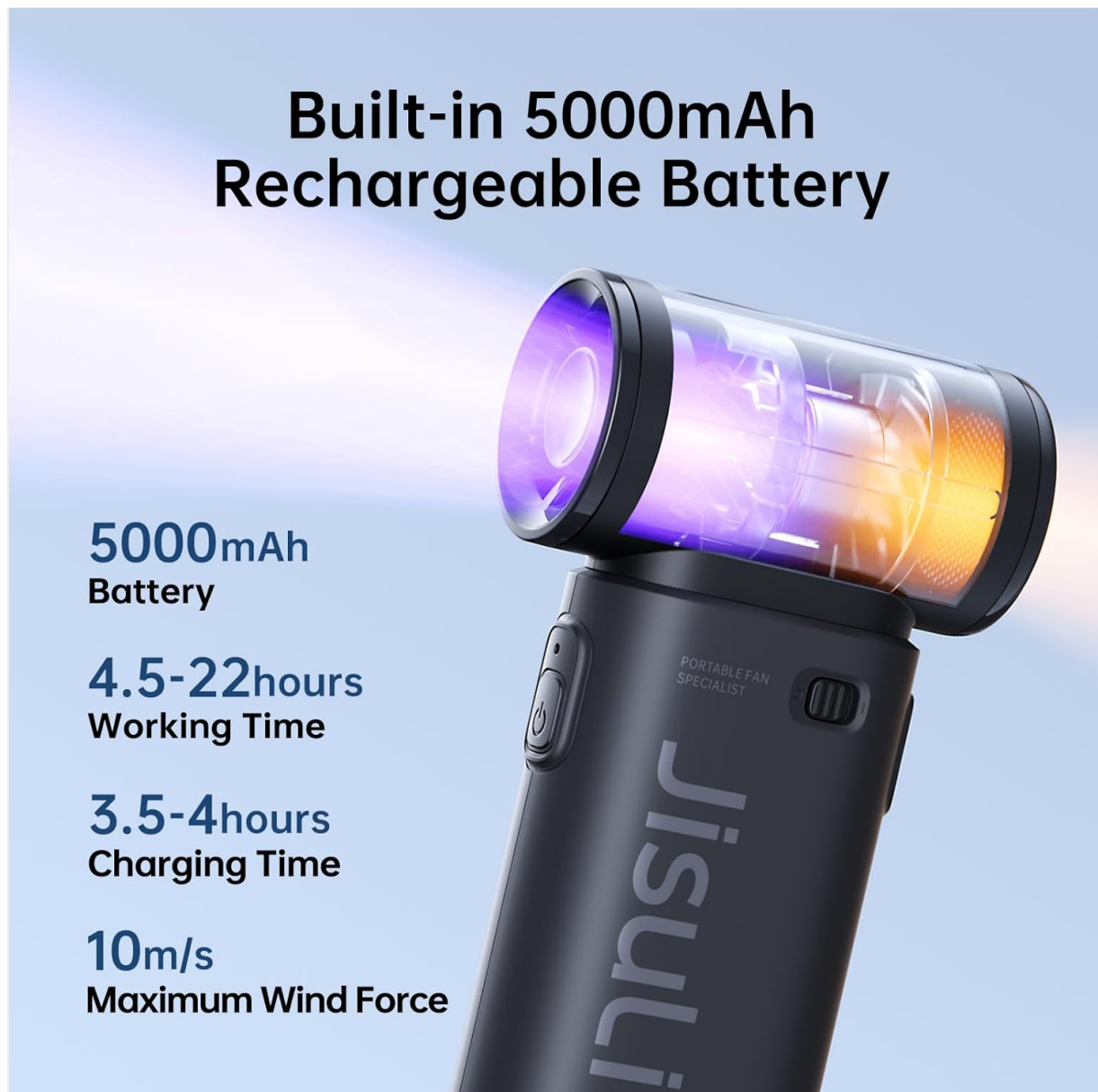
Image: Internal view of the fan highlighting battery capacity, working time, charging time, and wind force.

Charging time is approximately 3.5-4 hours for the 5000 mAh model and slightly less for the 3600 mAh model.