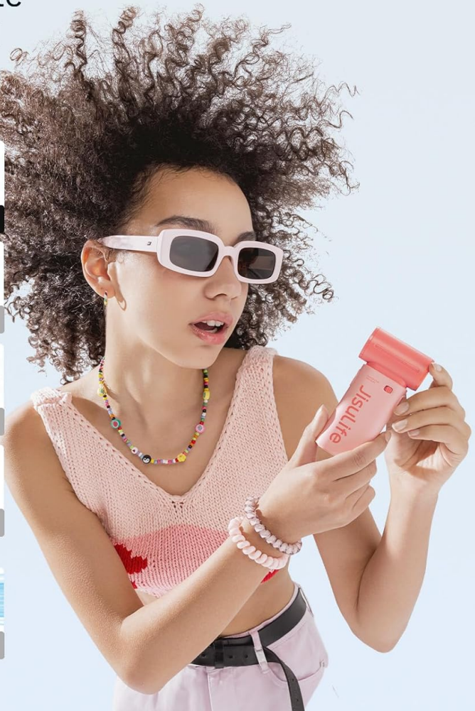
Image: Wind speed settings and battery life for the pink 3600 mAh fan.