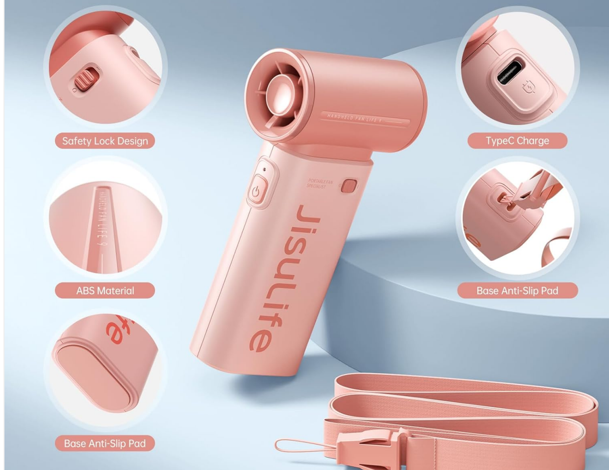
Image: Detailed view of the fan's features, including the safety lock.