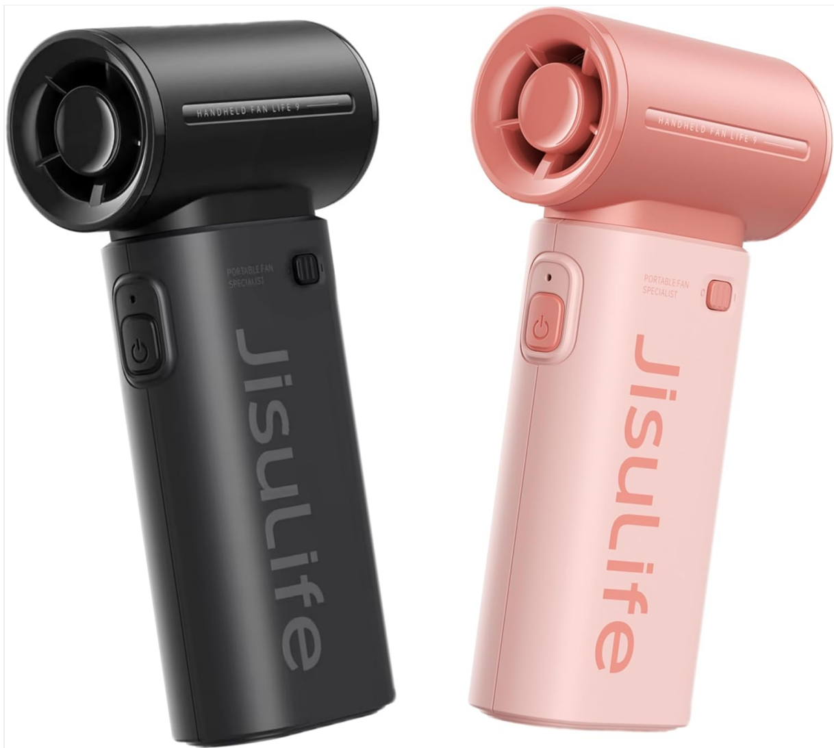
Image: The JISULIFE LIFE9 portable handheld fans in black and pink, showcasing their compact design.