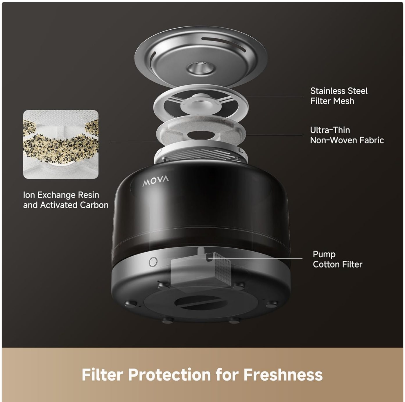
Figure 4: Multi-layer filtration system components.