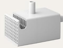
Wireless Water Pump x1