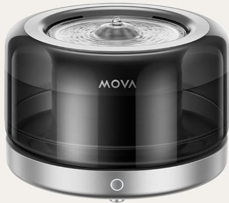
Main Unit x1 (Including the Base, Filter Box and Filter Mesh)