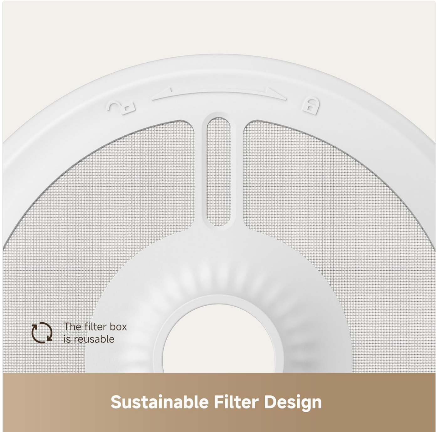
Figure 7: The reusable filter box design.

It is recommended to change the main filter every 30 days, or sooner if the filter needs replacement indicator light illuminates (red light). The pre-filters should be rinsed weekly and replaced as needed.