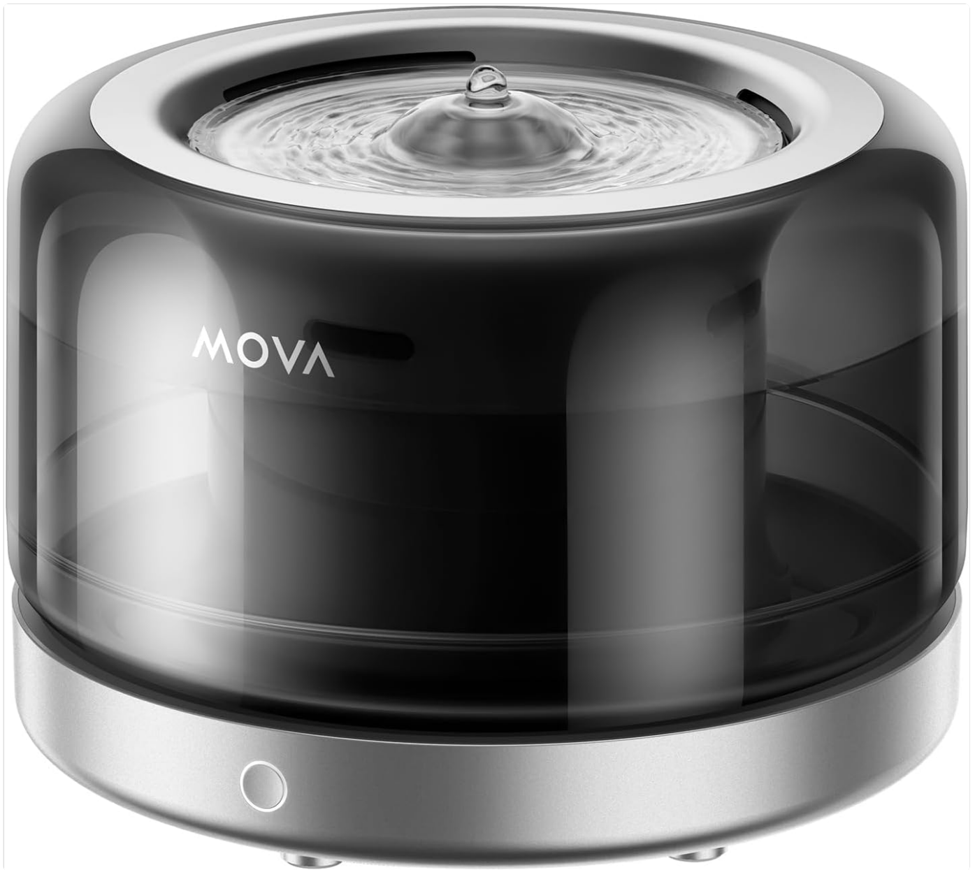
Figure 1: The Mova WF20 Pro Cat Water Fountain.