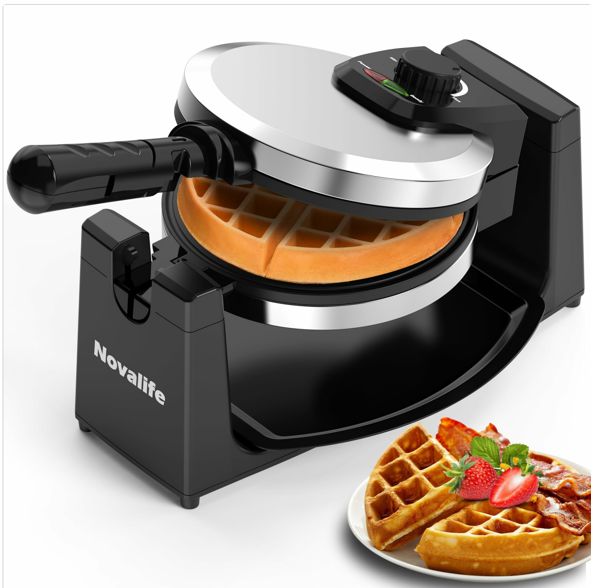
Overview of the Novalife Rotating Belgian Waffle Maker, highlighting its 1100W power, LED indicator lights, non-stick