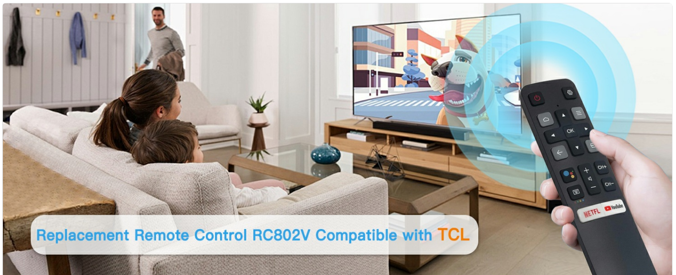
Image 1.1: The Terloogee RC802V remote control, compatible with various TCL Android Smart TVs. This remote does not include voice control functionality.

This manual provides comprehensive instructions for the Terloogee Replacement Remote Control, model RC802V. This remote is designed as a direct replacement for various TCL Android Smart 4K UHD TV models, offering immediate functionality without complex setup. Please note that this remote does not support voice control features.