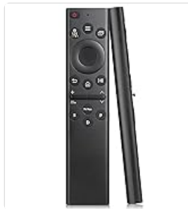
Image 2.1: Key features of the RC802V remote, highlighting its ergonomic design, stable signal transmission, and soft, responsive buttons.